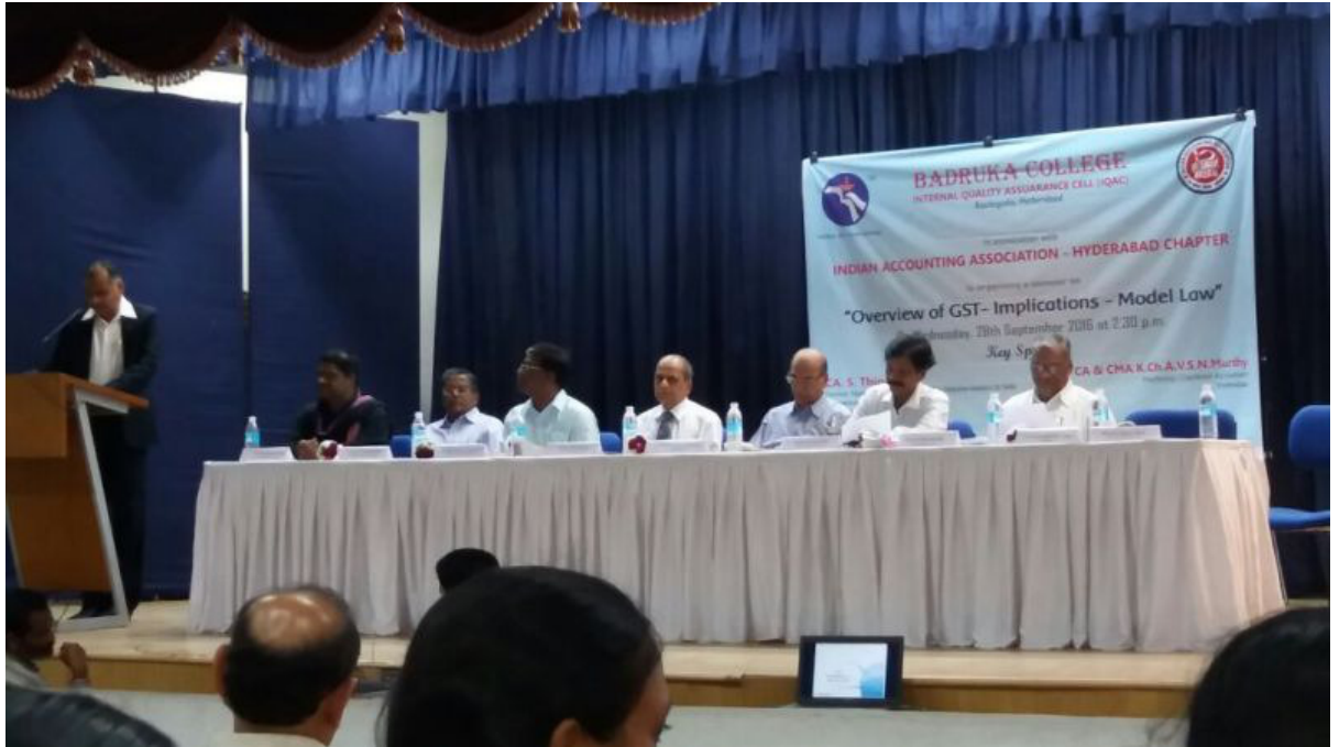
Seminar on Over view of GST – Implications –Model Law at Badruka College