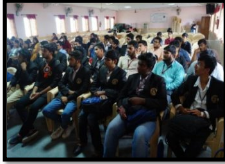
Participants keenly listening to the lectures