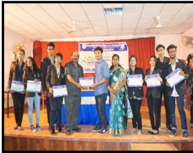
Award Certificates given to respective classes