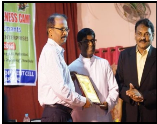
A token of appreciation from the Principal to ED Cell Director, OU