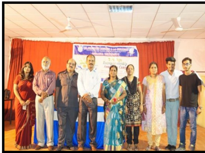
The EDC SJC Team Coordinators