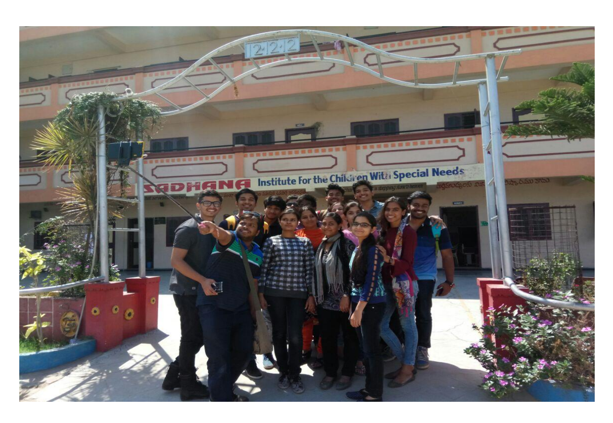
Sadhana institute for the Mentally Challenged