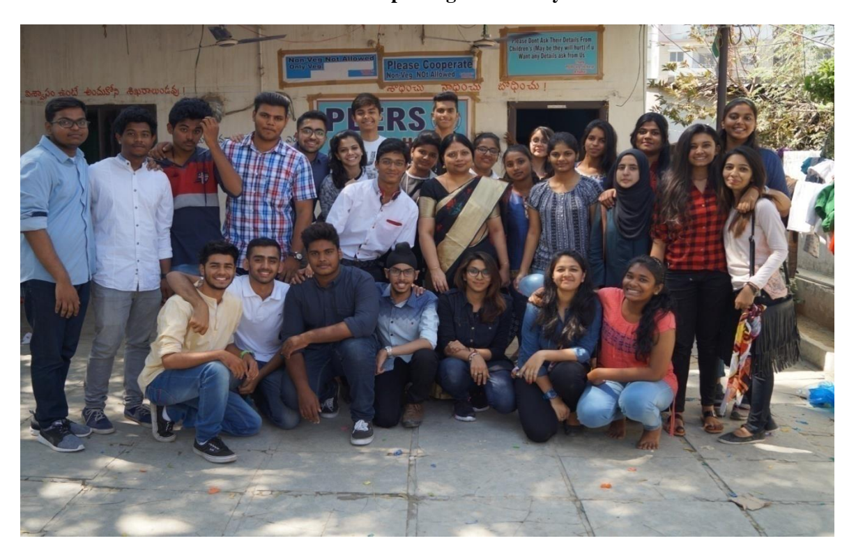
PEERS-Home for the under privileged orphan children