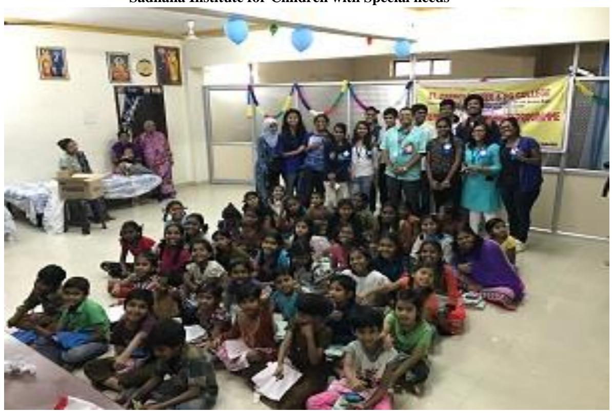
Aadarana -Home for the Orphanage and Needy Children

Sadhana Institute for Children with Special needs