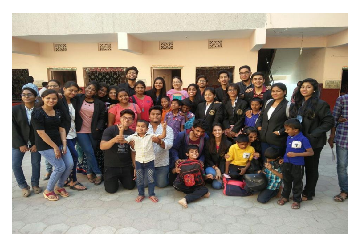
Devnar School for the Blind