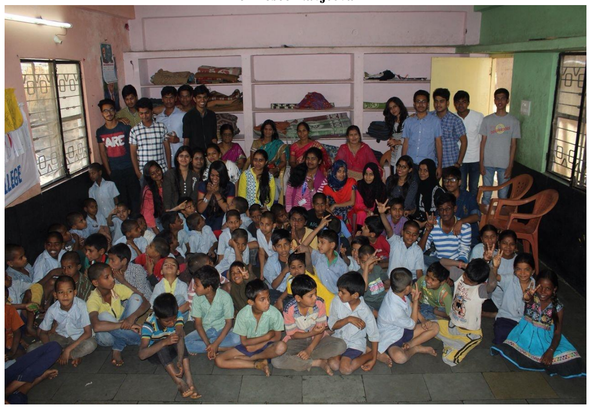
Government Primary School