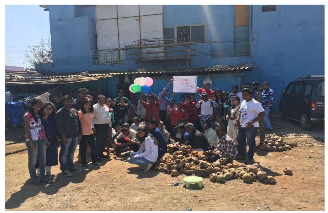
The Friends of the birds of the air