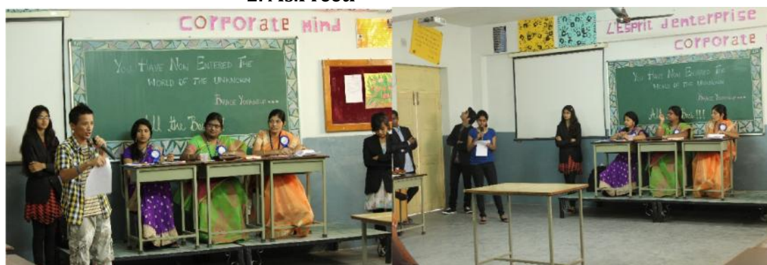
STUDENTS PARTICIPATING IN HR EVENT