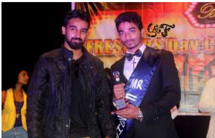
BBA Students Winning Awards at Fresher's Day

Objective:- To formally welcome first year in College