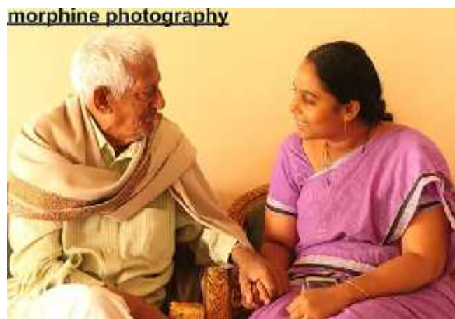
A heart to heart talk by the student and faculty