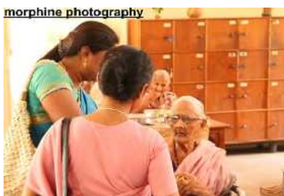
Faculty sharing lovely time with the elderly