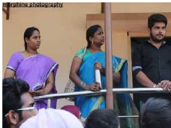
Faculty With Students At The Home

The students also donated an amount of Rs 7,840/- towards the Home.