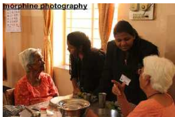
Students having a gossip with elderly