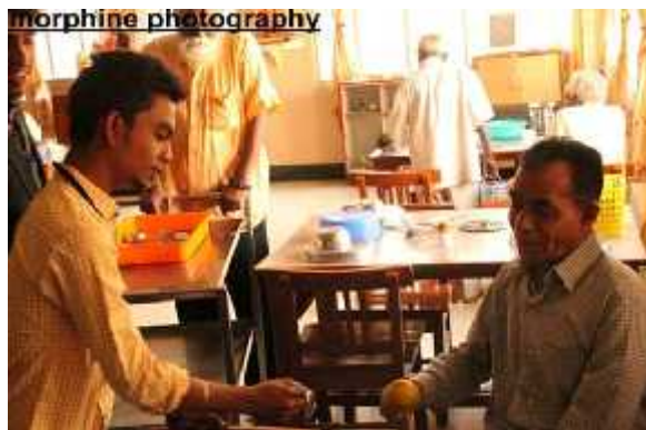
BBA students with the elder

The students had a great touching and warmth experience. They learnt that what ever happens in life, one should be positive towards life and also learnt various values and aspects of life .despite having many problems the elderly persons the learnt to live life happily .they see life with different vision and perspective .