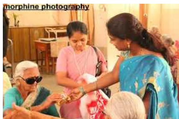
Faculty distributing food articles to the elderly