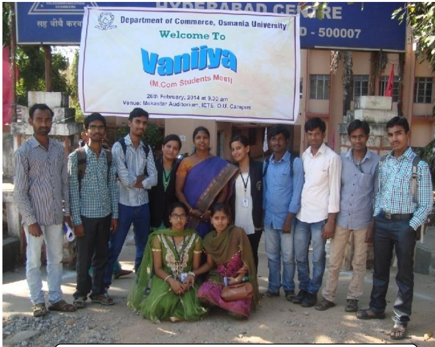
VANIYA-2014 M.COM I YR STUDENTS PARTICIPATED