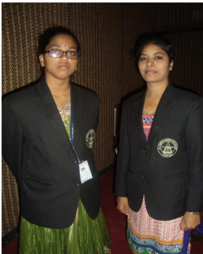
VANIJYA 2014 WINNERS OF II PRIZE IN MARKETING EVENT