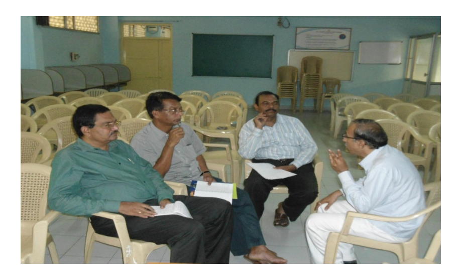
Visit by Principals and Faculty of Government Colleges

As our college is ranked 5<sup>th</sup> Best Commerce College in Hyderabad city and 41<sup>st</sup> among India's Best Commerce College by India Today, Neilson survey June 2014, a team of Principals and Faculty from various Government Colleges of Kadapa, Chitoor and Kurnool Districts visited the College on 15<sup>th</sup> July 2014 and from Guntur and Prakasam Districts on 23<sup>rd</sup> July 2014 to know about the best practices and innovative methods adopted by the commerce department.