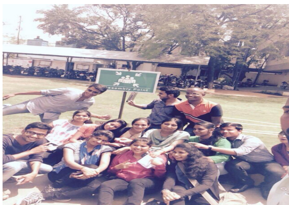
Industrial Visit to Coca Cola Company