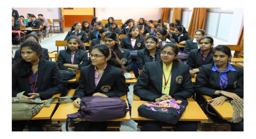
Participation of students in Placement Drive