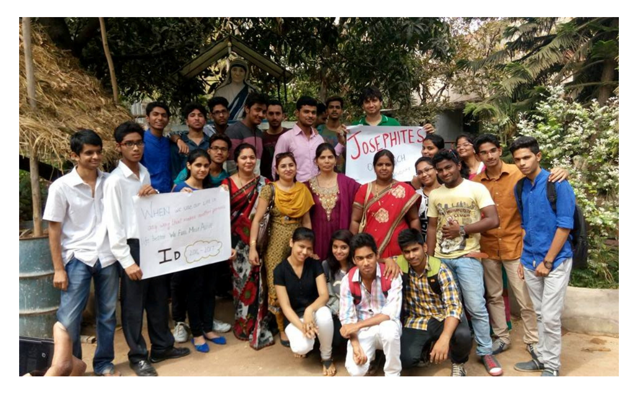
Visit to Mother Teresa Home for the Destitutes