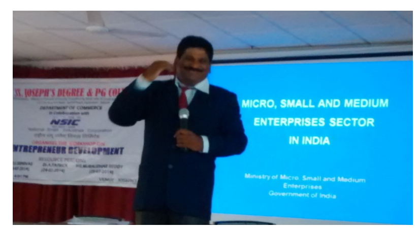
Lecture on Micro, Small & Medium Enterprises Sector in India