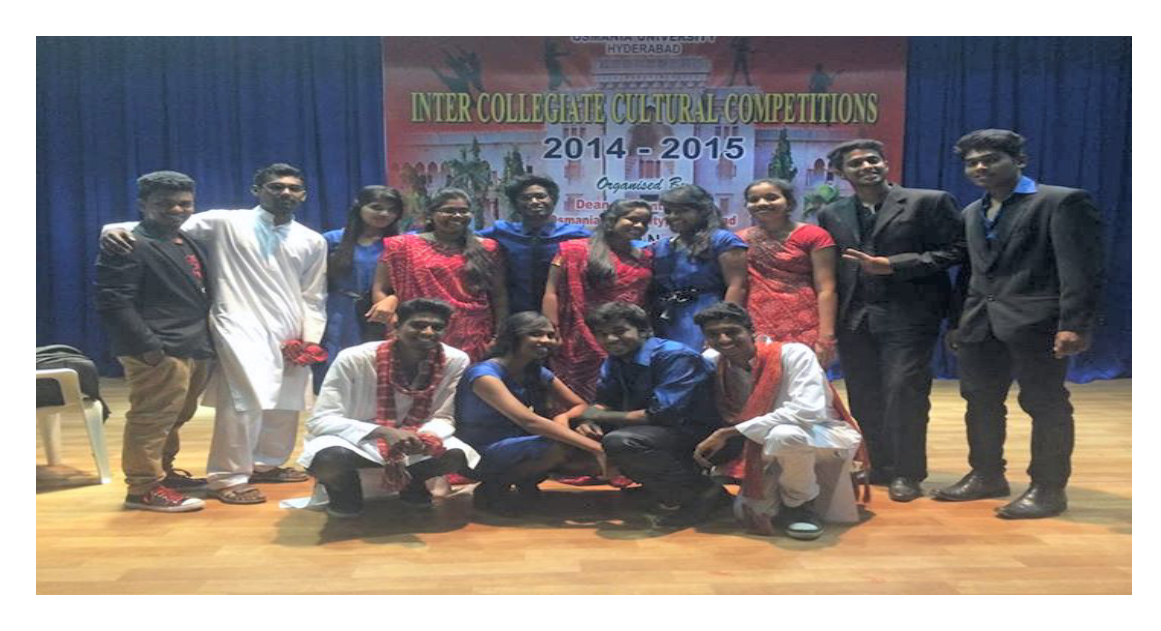
College Choir "Anna Domini"