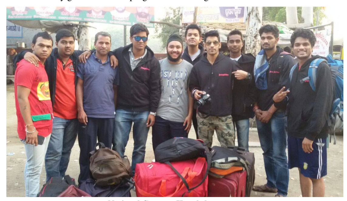
National Camp at Kurukshetra

Ten Red Cross volunteers of Youth Red Cross wing of the college have represented Telangana state and participated at National level Youth Red Cross training camp which was held at Kurukshetra by Haryana Red Cross Association from 22<sup>nd</sup> to 28<sup>th</sup> November 2014. Students from 11 states have actively participated in the camp. The National Camp has been a very good awareness program and was a great success.