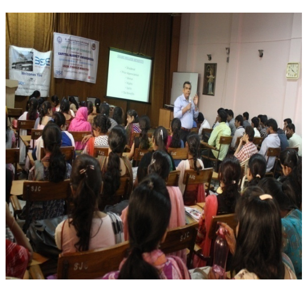
Seminar on Investors Protection by