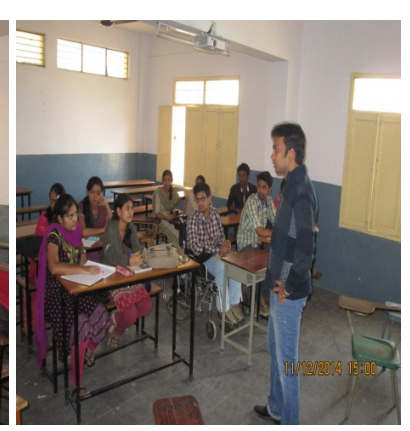
CRT by IIM Kolkata Alumni