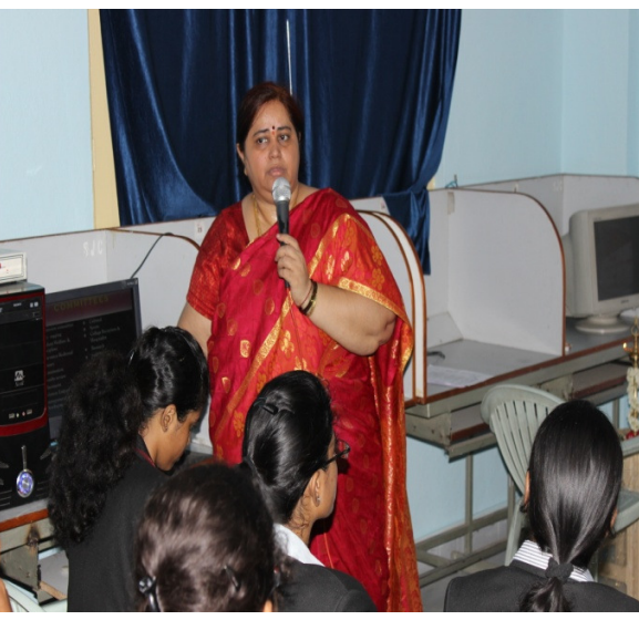
Briefing about B.Com Professional Curriculum