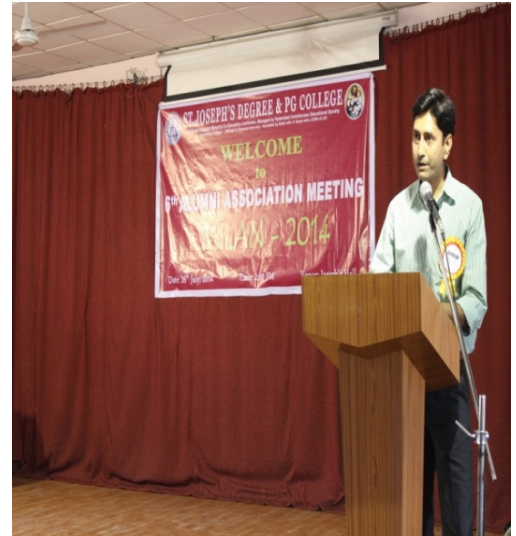
Message by the Chief Guest