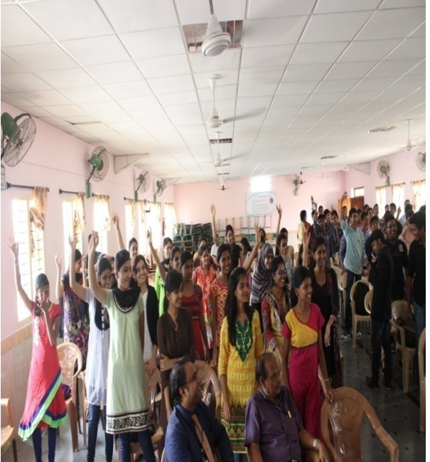
Briefing about the Departmental activities