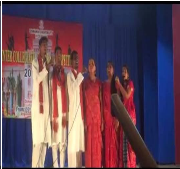
Group Song (Western) – I Prize