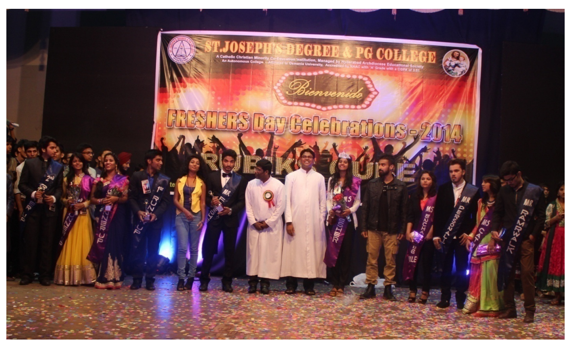
Principal & Vice Principal with the Winners of Fresher's Day Celebrations