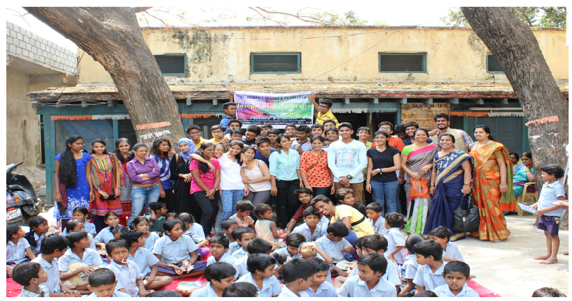
Visit to Sneha Ghar, Orphanage for Children