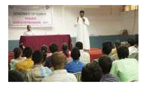
About College life-Interaction by Principal

we introduced activities which are focused on information for the first year, incorporation of Alumni student interaction and the inclusion of ice-breaker activities..