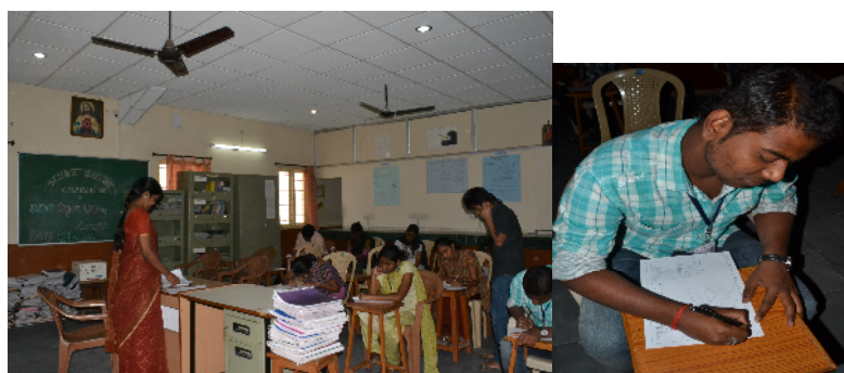
Participants during Solgan & Cartoon Drawing Events