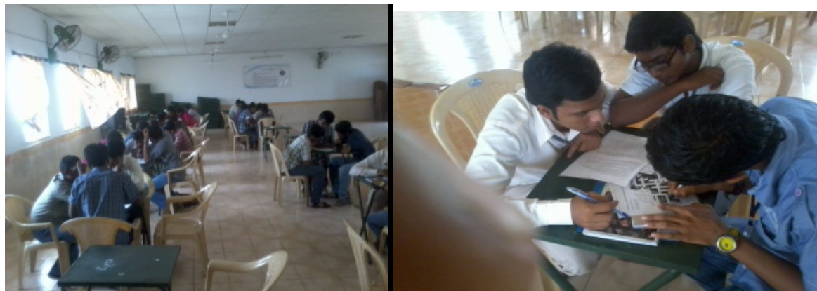
Students in action at the Venue of Crossword -Puzzle

The goal is to fill the white squares with letters, forming words or phrases, by solving clues which lead to the answers. At the end of the event 3 successful teams were selected, about 13 groups participated in this event .