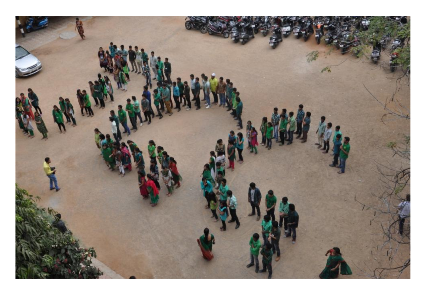
JGG FORMATION – March 1, 2014

The increasing human footprint on Earth poses great environmental challenges that continue to grow over time. An unprecedented effort is required to alleviate the adverse effects that human activities have on the ecosystem, effects that in turn alter how we interact with the Earth and with each other. Inclusion of all approaches to problem-solving will be necessary to effect a meaningful change. Joseph's Green Group addresses this global need as an unparalleled hub of environmental issues, innovation, and education. Its unique strength is the zeal with which this group has emerged to reduce the carbon footprints of Josephites .