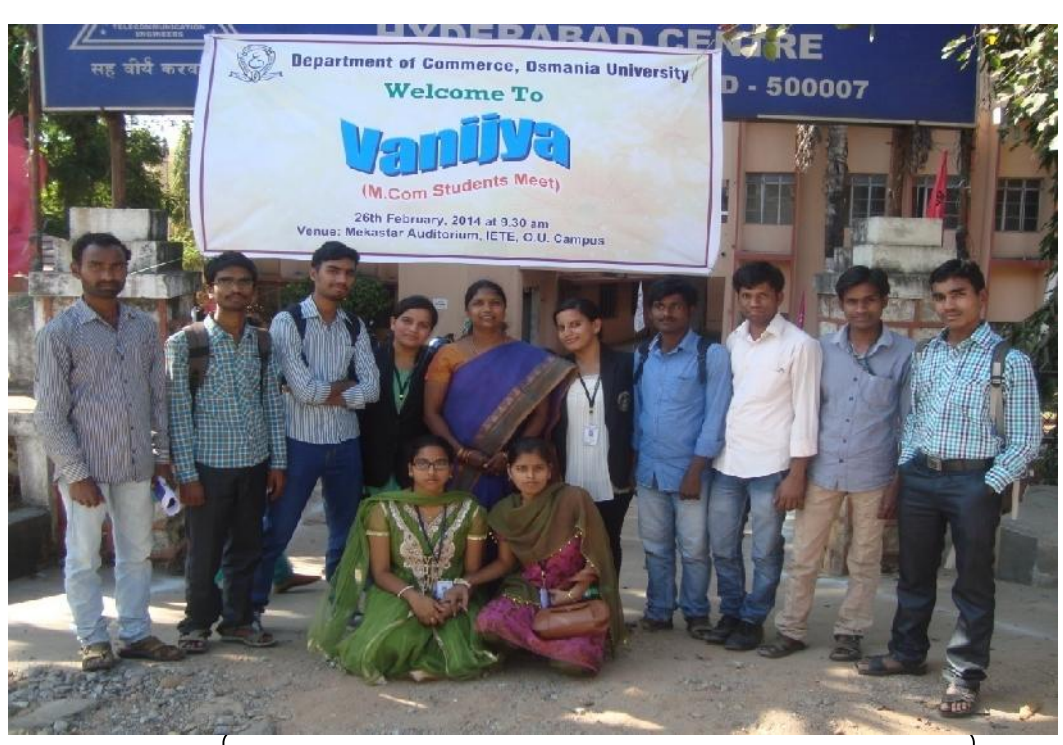
VANIJYA-2014 M.COM I YR STUDENTS PARTICIPATED