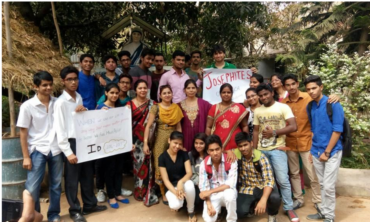
Visit to Mother Teresa Home for the Destitutes