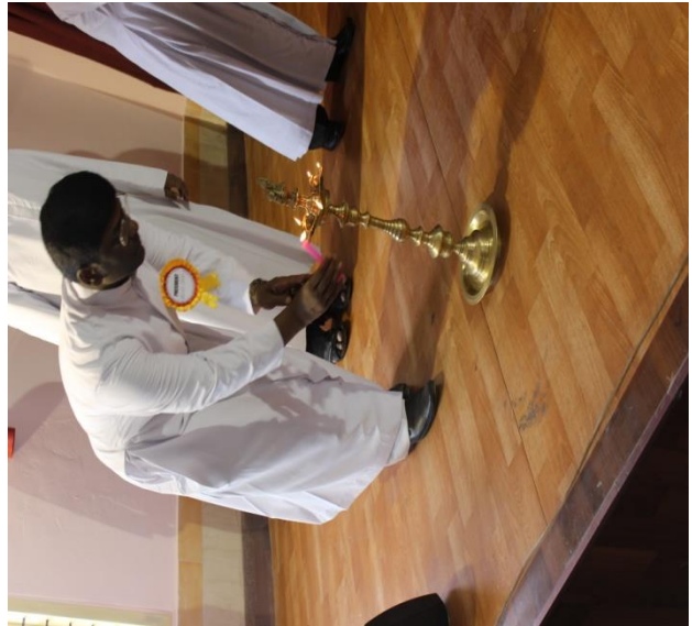
Lighting of the Lamp by Principal