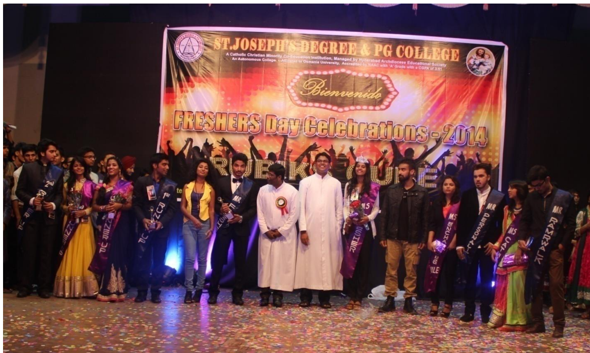
Principal & Vice Principal with the Winners of Fresher's Day Celebrations