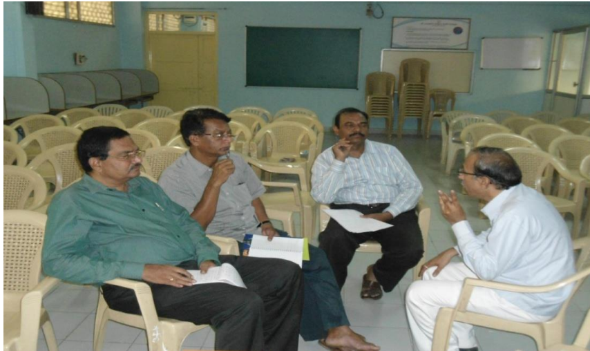
Visit by Principals and Faculty of Government Colleges

As our college is ranked 5 th Best Commerce College in Hyderabad city and 41 st among India's Best Commerce College by India Today, Neilson survey June 2014, a team of Principals and Faculty from various Government Colleges of Kadapa, Chitoor and Kurnool Districts visited the College on 15 th July 2014 and from Guntur and Prakasam Districts on 23 rd July 2014 to know about the best practices and innovative methods adopted by the commerce department.