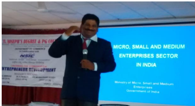
Lecture on Micro, Small & Medium Enterprises Sector in India