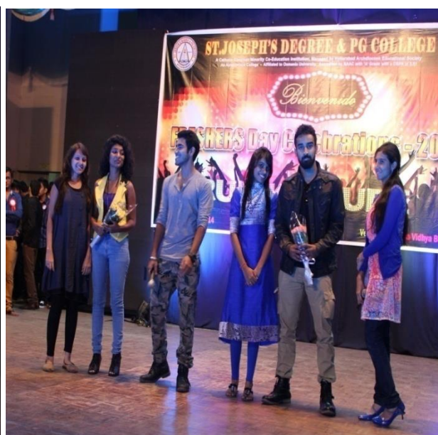
Judges for Mr. & Ms. Fresher