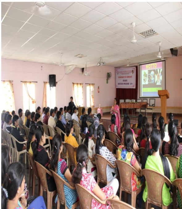
Briefing about the Departmental activities