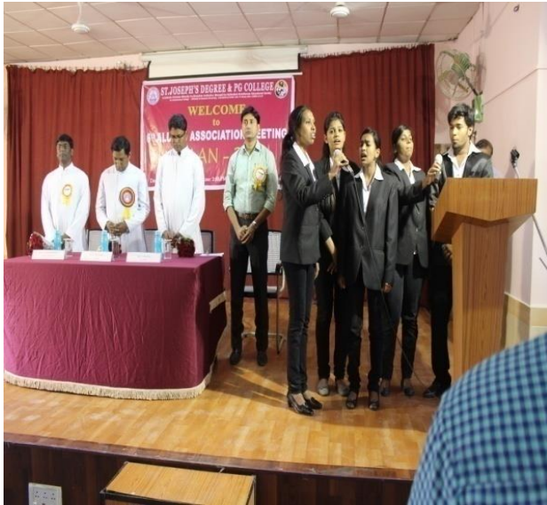
Prayer song by the College Choir Anna Domini