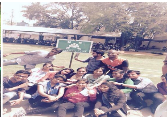
Industrial Visit to Coca Cola Company