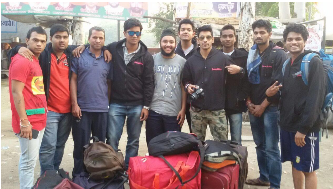
National Camp at Kurukshetra