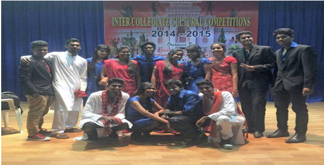
College Choir “Anna Domini”