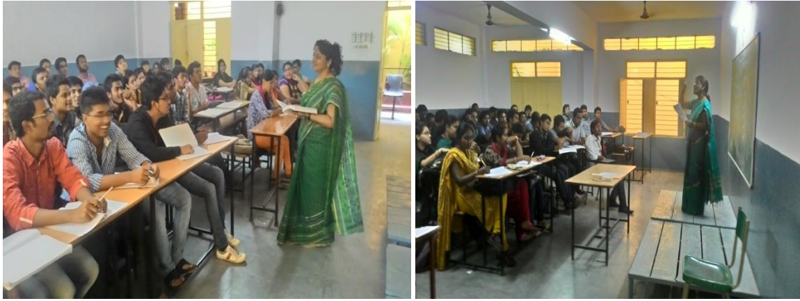
CRT by In House Faculty