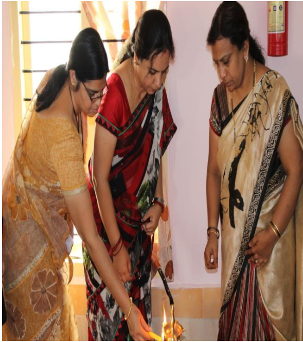
Lighting of the Lamp

the fresher's on their feet. The fresher's were enlightened and very much motivated to make their stand and fly high to reach heights.