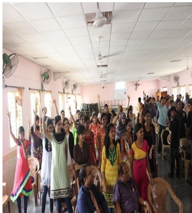
Ice Breaking Session