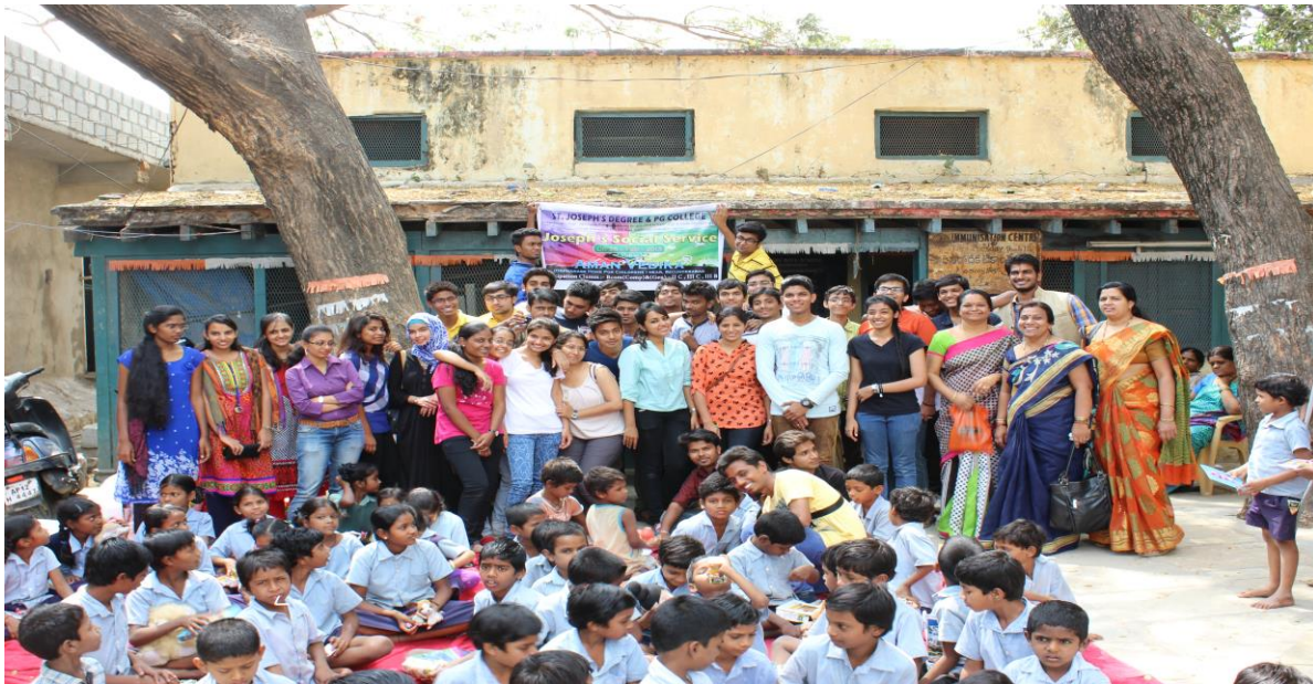
Visit to Sneha Ghar, Orphanage for Children