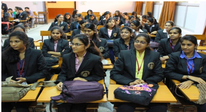
Participation of students in Placement Drive