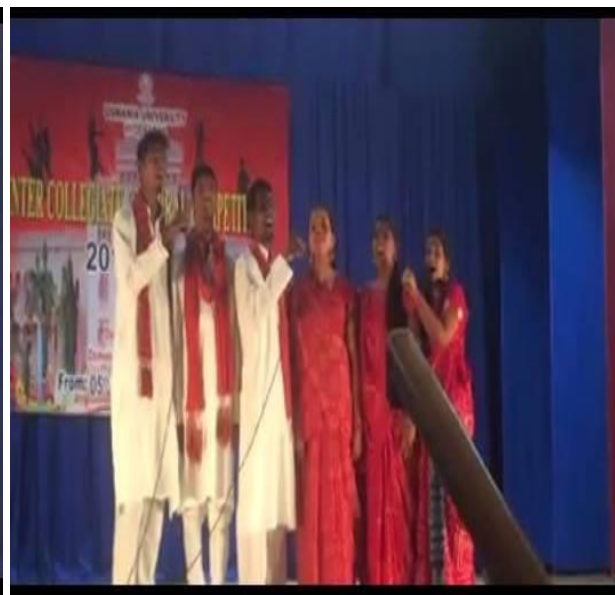
Group Song (Indian) – I Prize