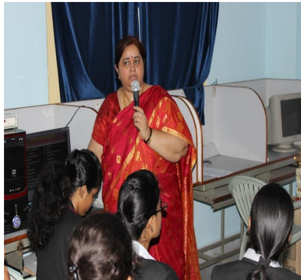
Briefing about B.Com Professional Curriculum