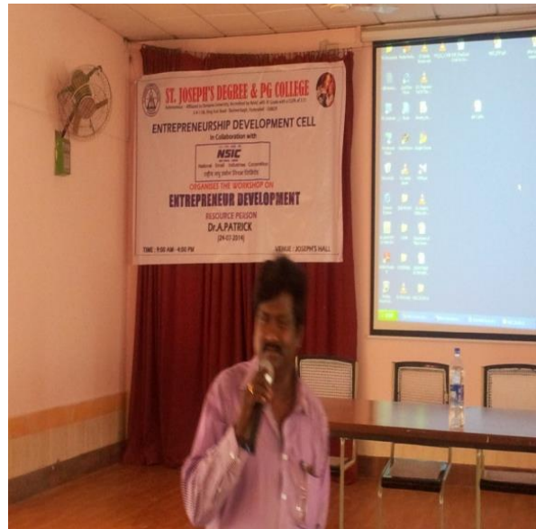
Introduction about NSIC