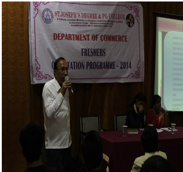
Briefing about the Course Structure