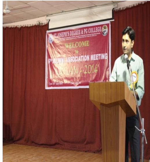
Speech by Alumni