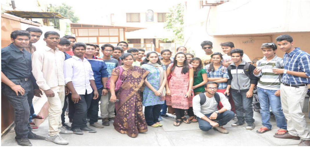
Visit to Missionaries of Charity, Mother Teresa Orphanage