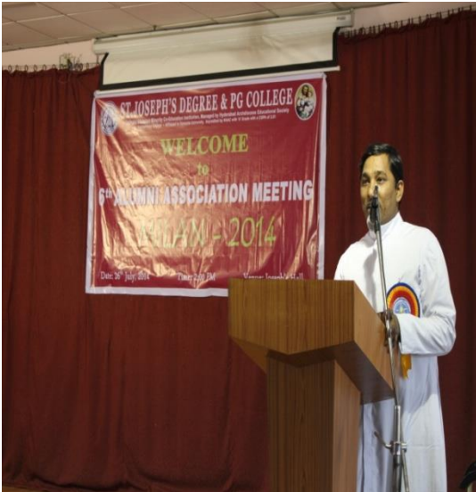
Message by the Chief Guest