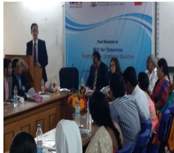
Panel Discussion on skill for tomorrow – Redefining the Commerce Education organized by Dept. of Commerce Osmania University