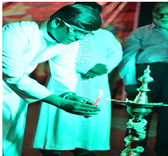
Lighting of Lamp by Principal