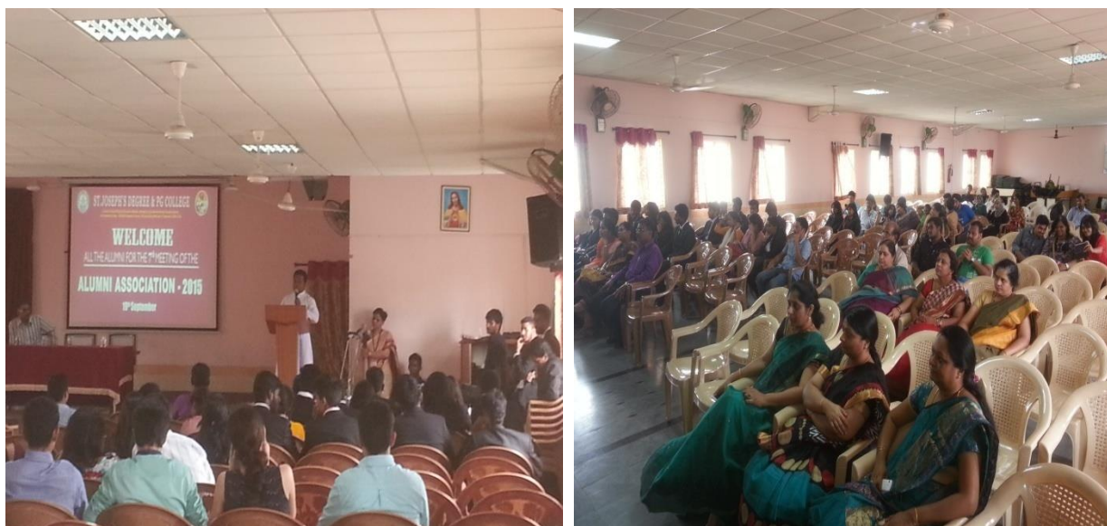
Alumni Meet 2015