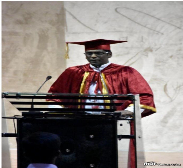
Address by Principal