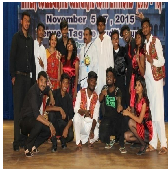
Winners at the Inter Collegiate Cultural Competitions, Osmania University