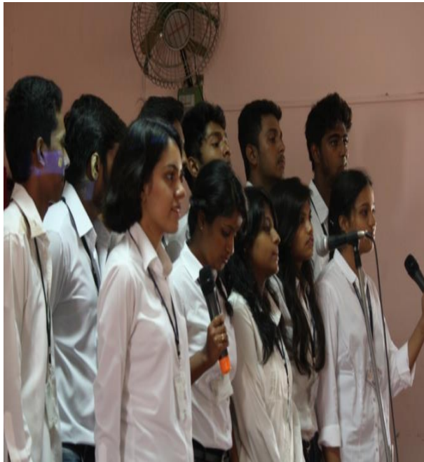
College Choir "Anna Domini"