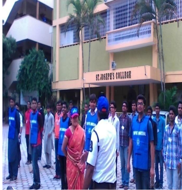
Training to students by Traffic Police Team