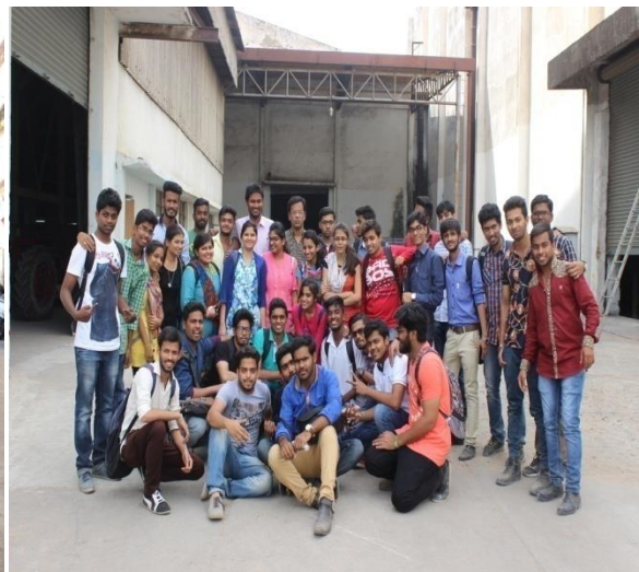
Industrial Visit to Ganpati Sugar Industries Ltd.