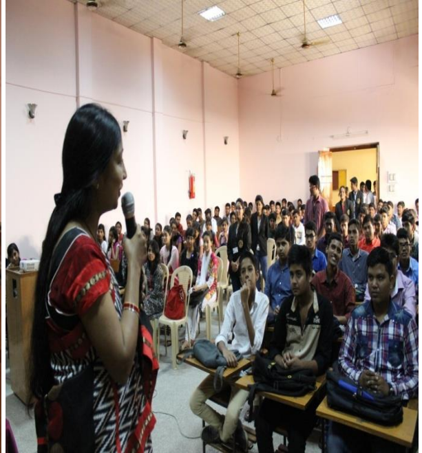
Briefing about the Departmental Activities