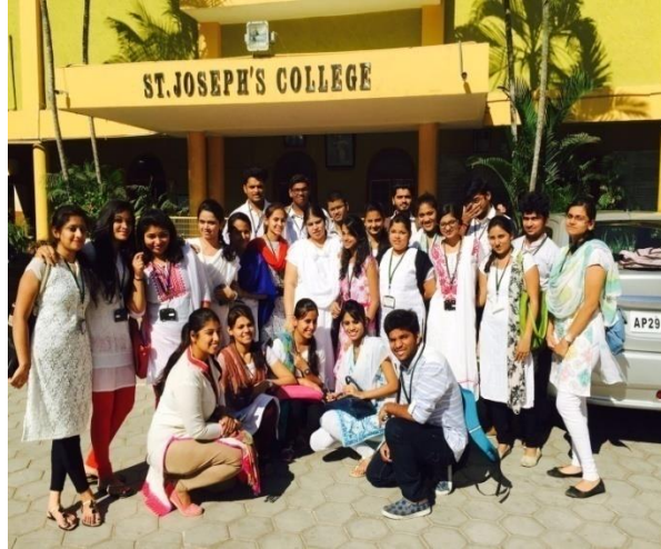
Visit to City Civil Court