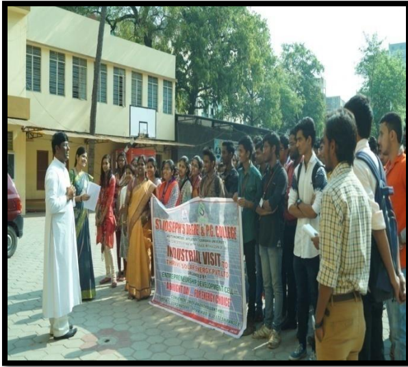
Principal Addressing the students