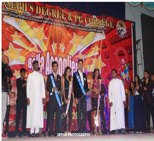
Mr. & Ms. Fresher