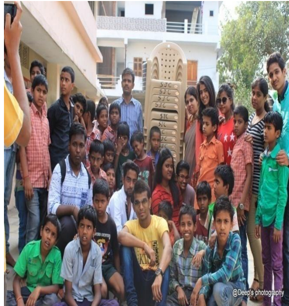
Visit to LSN Foundation