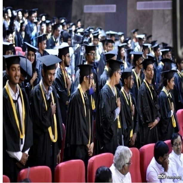
Degree Recipients taking Pledge