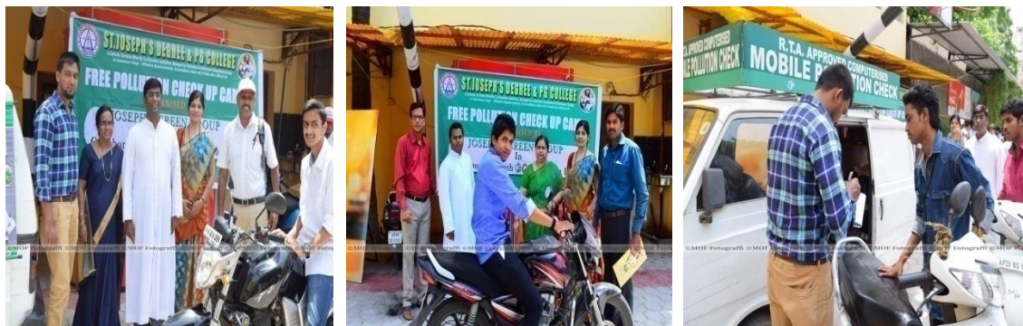
Free Pollution Check up Camp

As part of Josephs Green Group, Department of Commerce in collaboration with Castrol India Limited organized Free Pollution Check up Camp on 4 th July 2015. Around 500 students and also staff availed the benefit and were given computerized pollution under control certificate authorized by Transport Department, Government of Telangana State.