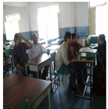
Parent Teacher Meet