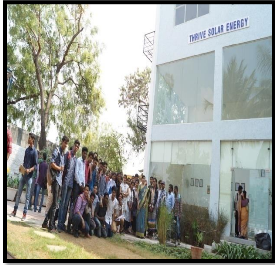
Thrive Solar Energy