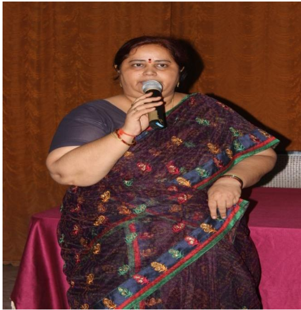
Address by Head, Department of Commerce