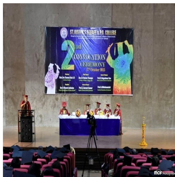
Address by Chief Guest