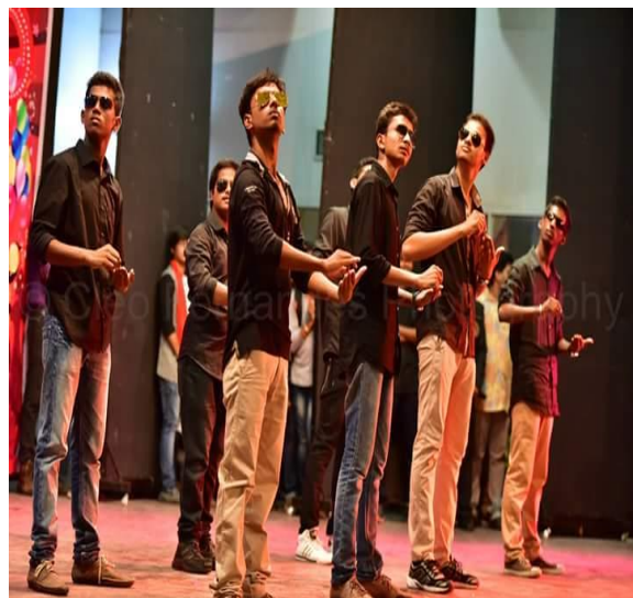
Dance Performance by Seniors