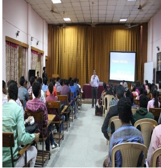
Address by Controller of Examinations