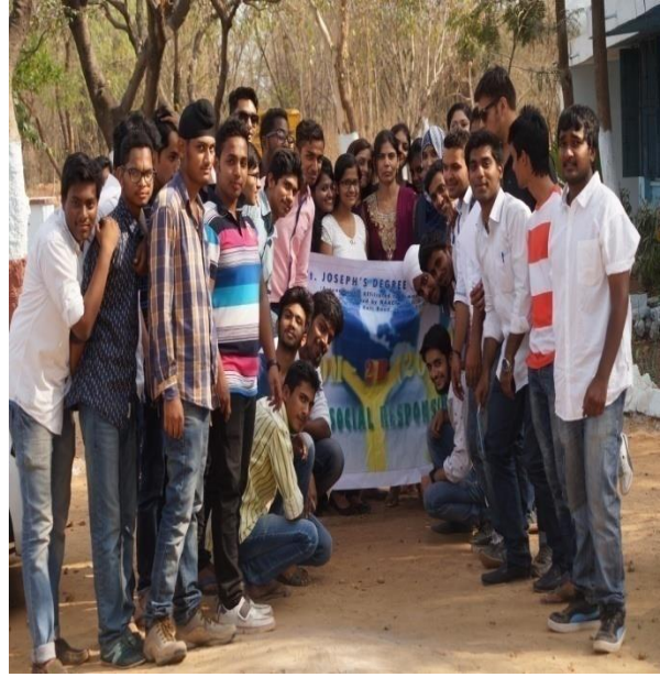
Visit to Aram Ghar