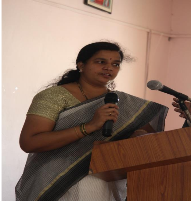
Briefing about the Course Structure