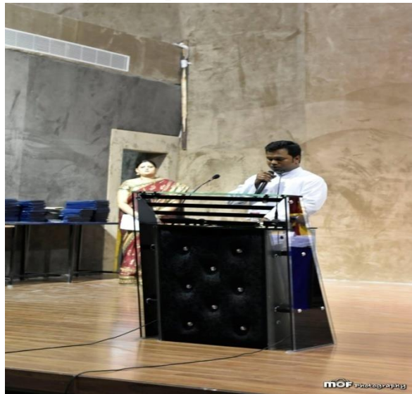
Address by Vice Principal