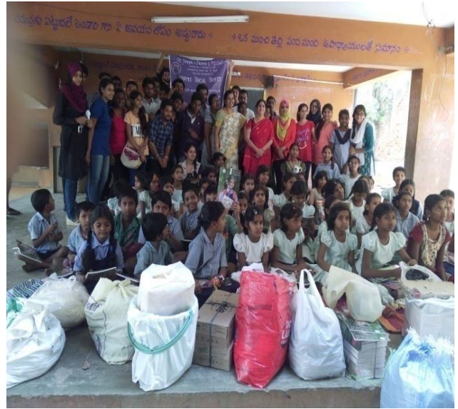
Visit to Gracious Paradise Charitable foundation Visit to Sannihita Centre for Women & girl child