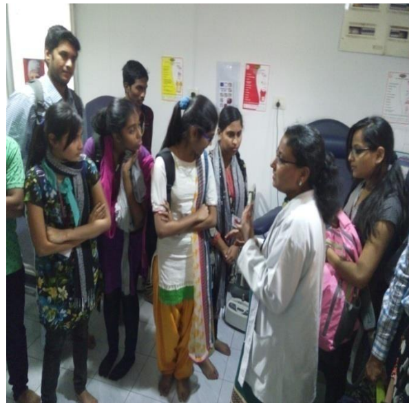
Visit to Blood Bank