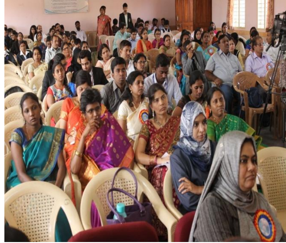
International Conference organized by Dept.of Commerce & Business Management, St.Josephs Degree & PG College