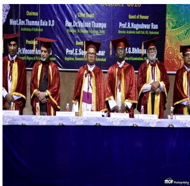
Dignitaries on the Dias