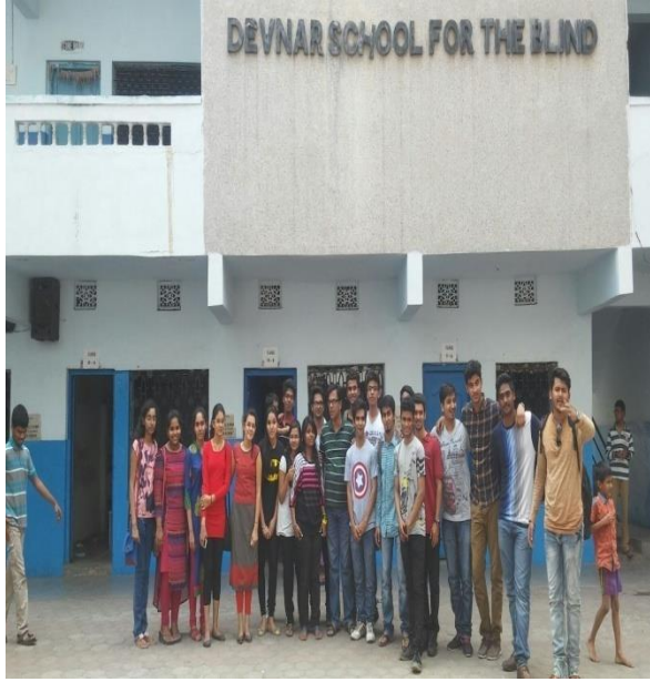
Visit to Devnar School for the Blind