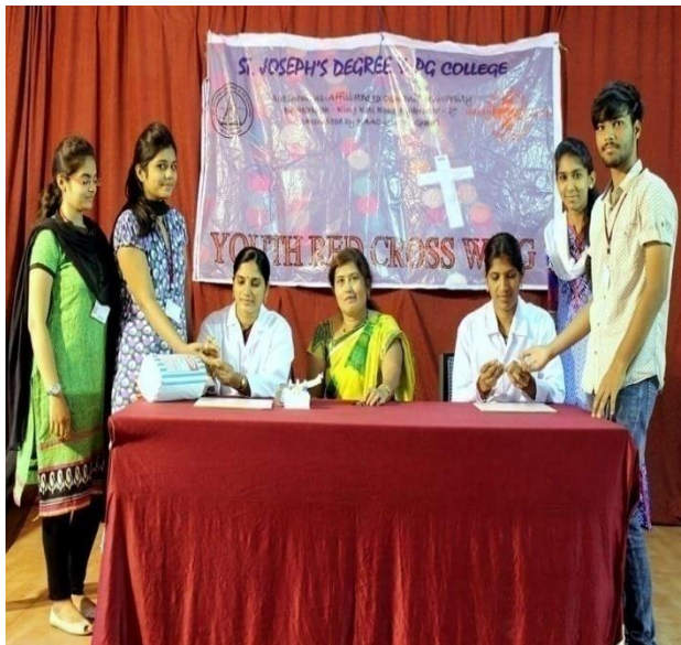
Blood Screening Camp