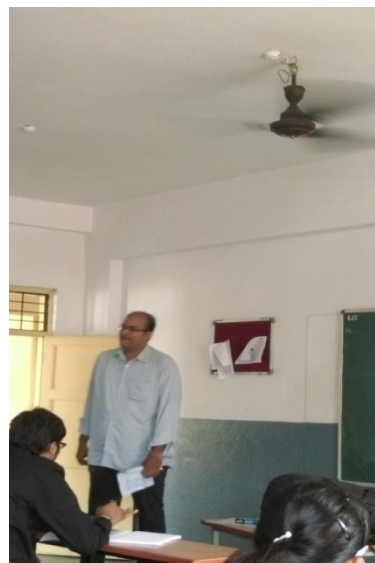
Numerical Ability & Reasoning