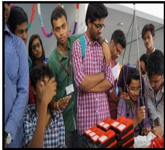
Assembling semi finished goods to finished product