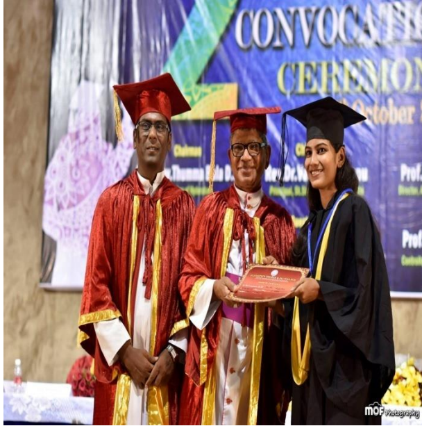
Gold Medalist from B.Com General