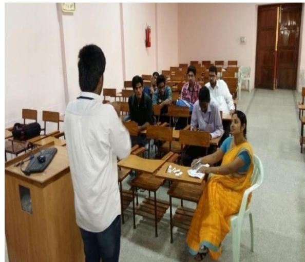
Just a Minute