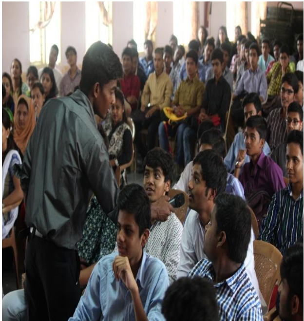
Ice Breaking Session