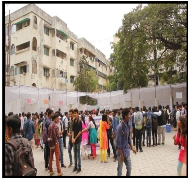
Students & Staff enjoying the Festival