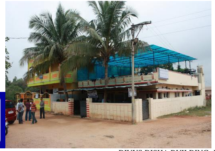
DIVYS DISHA BUILDING -UPPAL

The MBA students of St.JOSEPH'S PG COLLEGE visited DIVYA DISHA orphanage on 5-5-2012 Saturday. Around 50 students from the MBA I year participated in this Noble cause. All the students contributed an amount of Rs.9000 in total towards the distribution of snacks, dinner for all the children and prizes for the games / activities conducted.