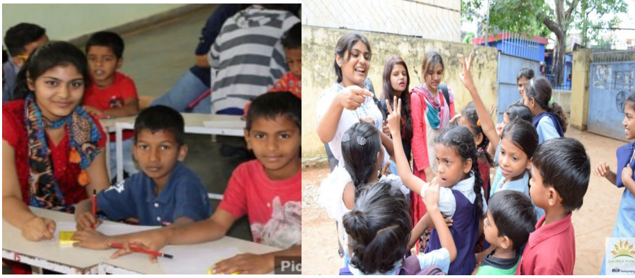
VOLUTEERING AT AN NGO