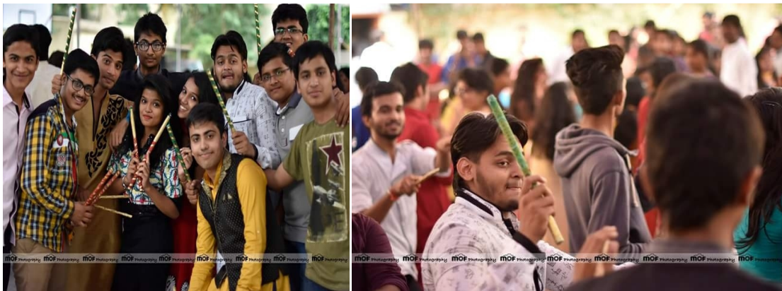
BBA (IT) STUDENTS PARTICIPATING IN DHANDIYA AT MAIN CAMPUS

All the BBA (IT) students participated in the Dandiya Fest in main campus on 10 th Oct 2015 in main campus