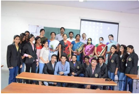
TEACHER'S DAY CELEBRATIONS