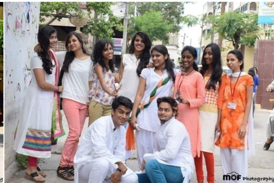
STUDENTS OF BBA (IT) AT CELEBRATIONS