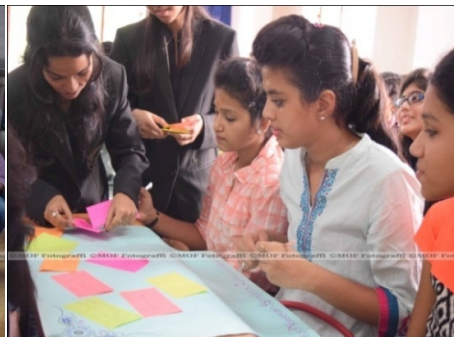
Students participating in Ice Breaking Session