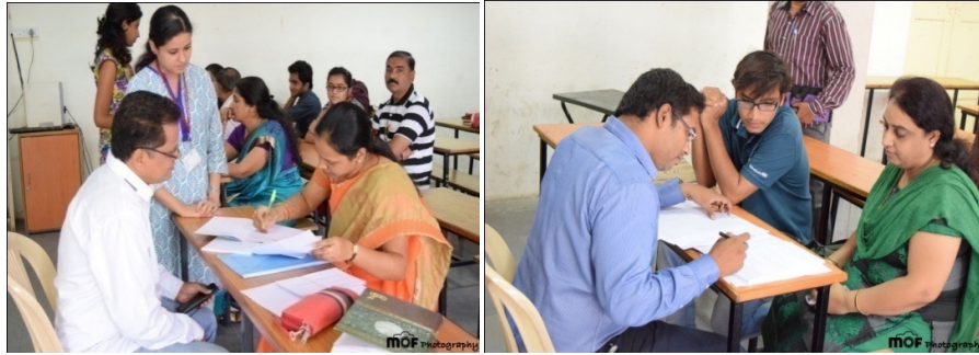
BBA I "A" & "B" Class Incharges