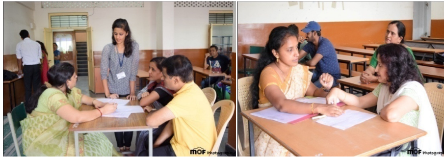
BBA II "A & "B" Class Incharges