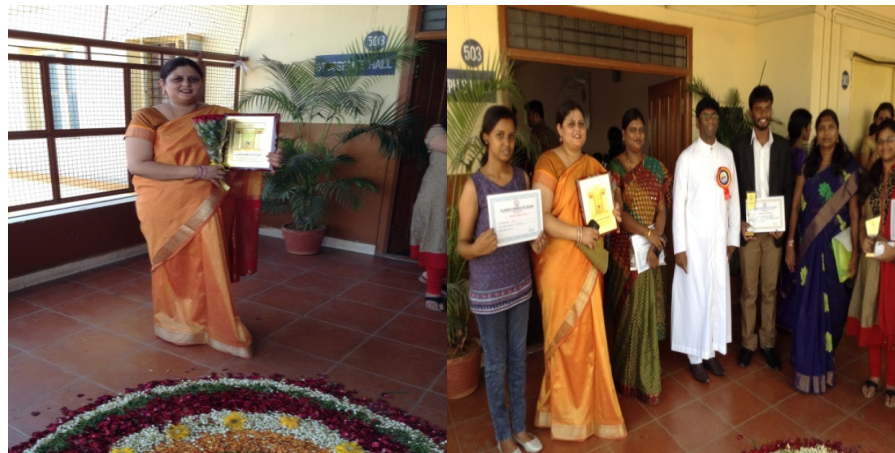
FACULTY APPRECIATION AWARDS GIVEN ON ANNUAL DAY