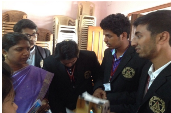
BBA (IT) STUDENTS AT INFORMATIQUE -SEP 2015

The students of BBA (IT) participated in the “ INFORMATIQUE 2015” which was organized by the Department of Computer Science on 17 th September 2015 which gave a platform for BBA (IT) students to create innovative models and display .The students stood in the second place in the Exhibition.