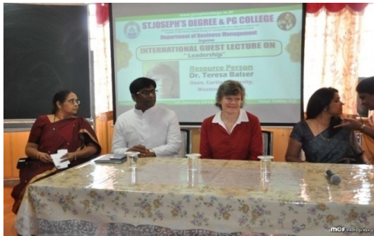
PRINCIPAL, DIRECTOR WITH THE GUEST SPEAKER