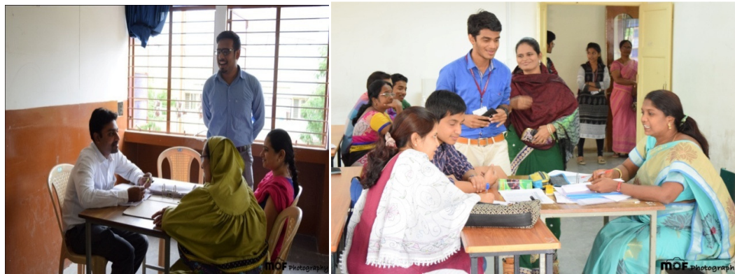
BBA III Year, Sem V Class In charge