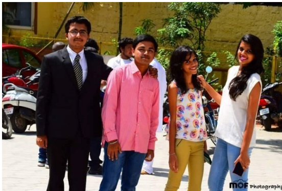
ANDREWBBA (IT) HOSTED THE PROGRAMME

The students of BBA (IT) Andrew and Akansha hosted the Independence day celebration on 15 th August 2015 in main campus and all the students participate in the event and cultural activities