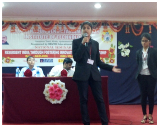
PAPER PRESENTATION AT RBVRR