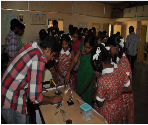
Our student demonstrating on various topics