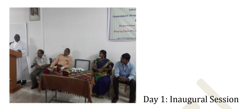
Day 1 & 2: Technical Sessions