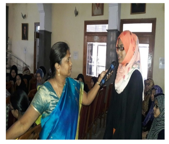
MRS.DANAM INTERACTING WITH STUDNETS