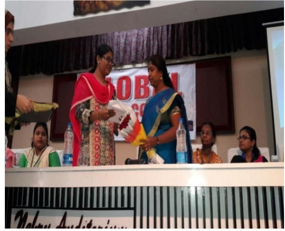
FELICITATION BY THE PRINCIPAL OF GLOBAL JUNIOR COLLEGE