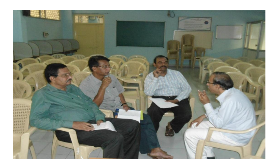
Visit by Principals and Faculty of Government Colleges

As our college is ranked 5<sup>th</sup> Best Commerce College in Hyderabad city and 41<sup>st</sup> among India's Best Commerce College by India Today, Neilson survey June 2014, a team of Principals and Faculty from various Government Colleges of Kadapa, Chitoor and Kurnool Districts visited the College on 15<sup>th</sup> July 2014 and from Guntur and Prakasam Districts on 23<sup>rd</sup> July 2014 to know about the best practices and innovative methods adopted by the commerce department.