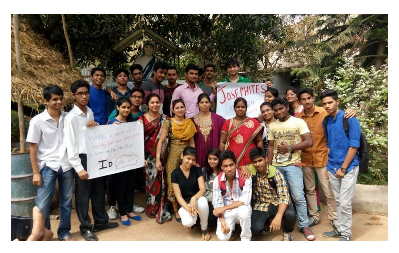
Visit to Mother Teresa Home for the Destitutes