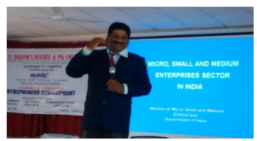
Lecture on Micro, Small & Medium Enterprises Sector in India