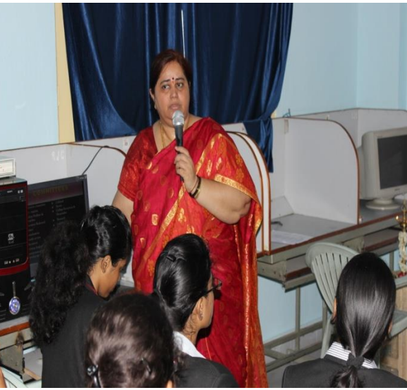
Briefing about B.Com Professional Curriculum