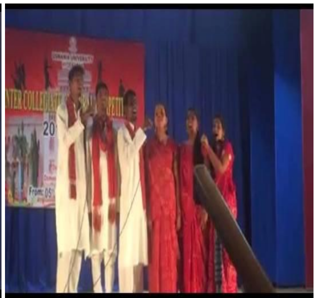
Group Song (Western) – I Prize