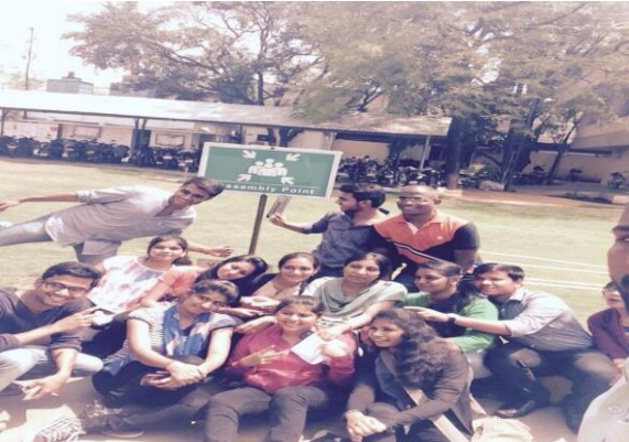
Industrial Visit to Coca Cola Company