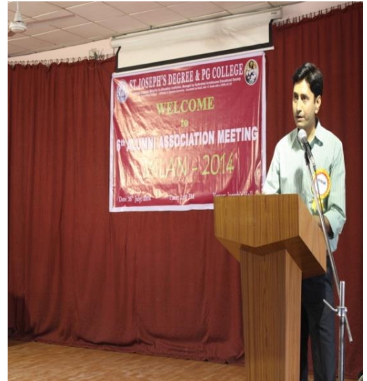
Message by the Chief Guest