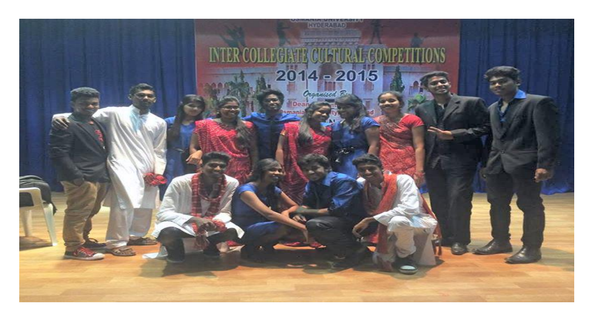
College Choir "Anna Domini"