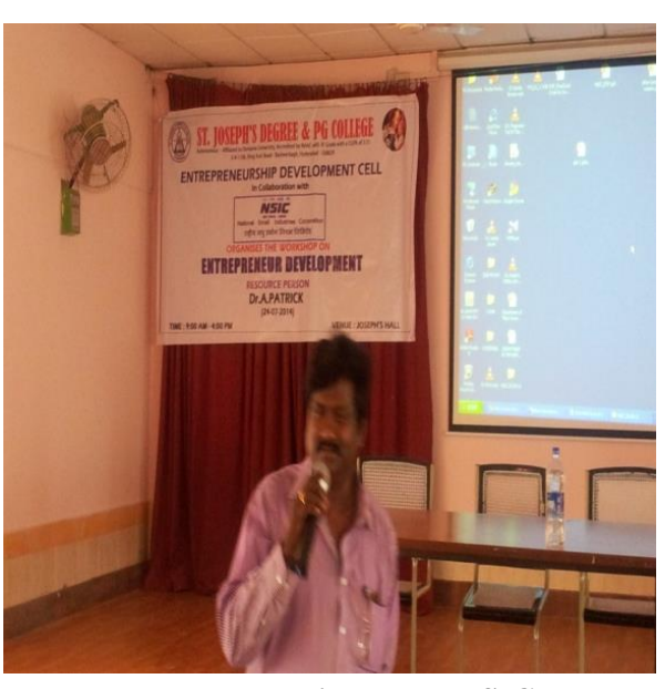
Introduction about NSIC