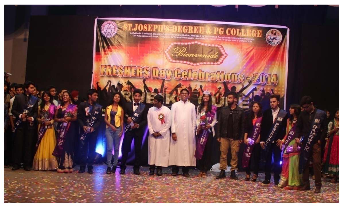
Principal & Vice Principal with the Winners of Fresher's Day Celebrations