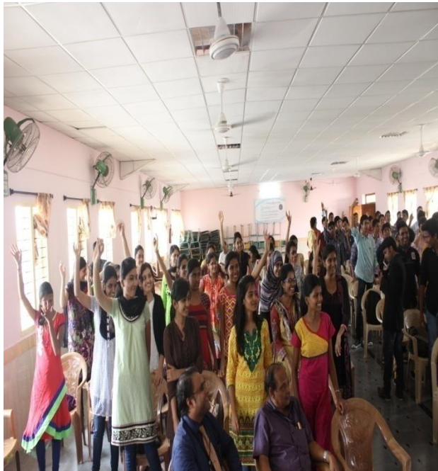
Briefing about the Departmental activities