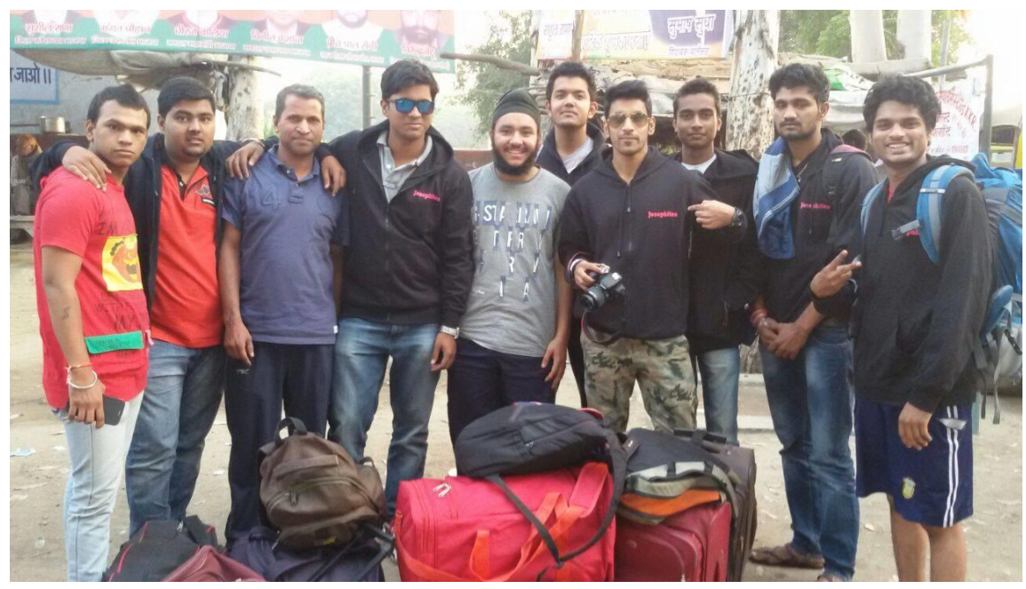
National Camp at Kurukshetra