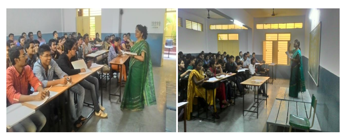
CRT by In House Faculty