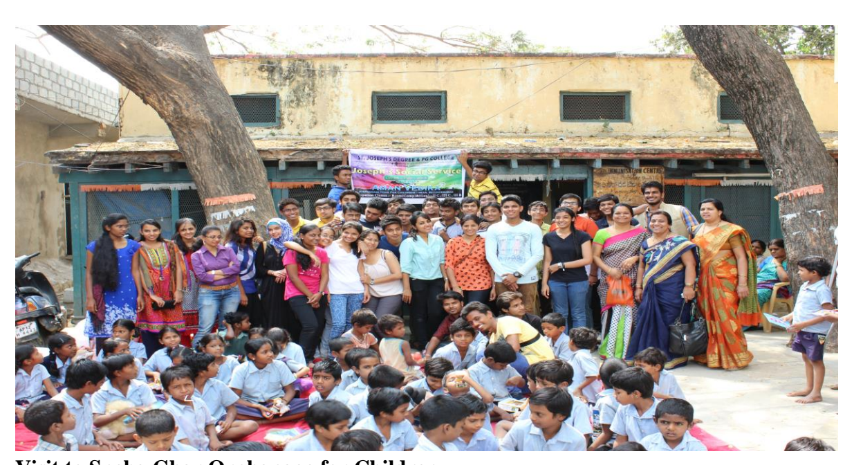
Visit to Sneha Ghar, Orphanage for Children