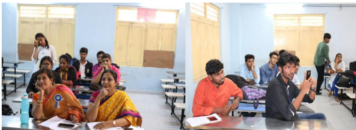
Faculty Coordinators for Turncoat