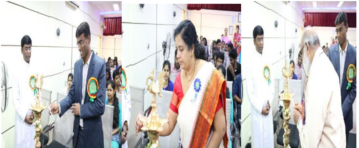
Lighting of Lamp