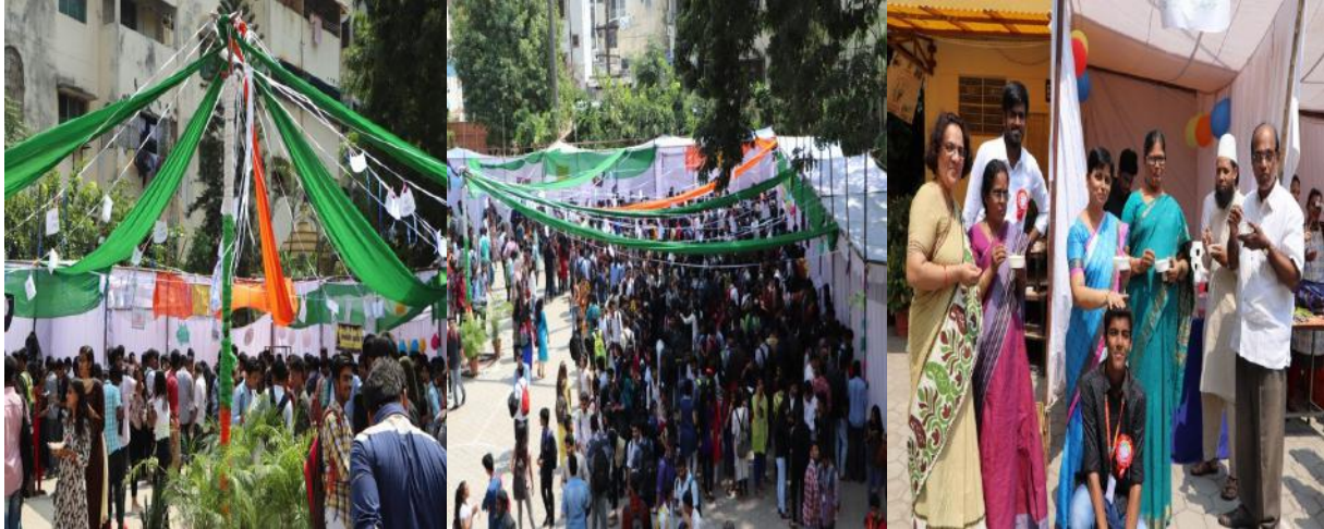
Students and Faculty at Food Fest