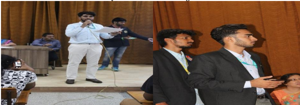
Student Coordinators for JAM