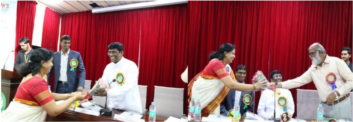
Welcoming of Principal and Director