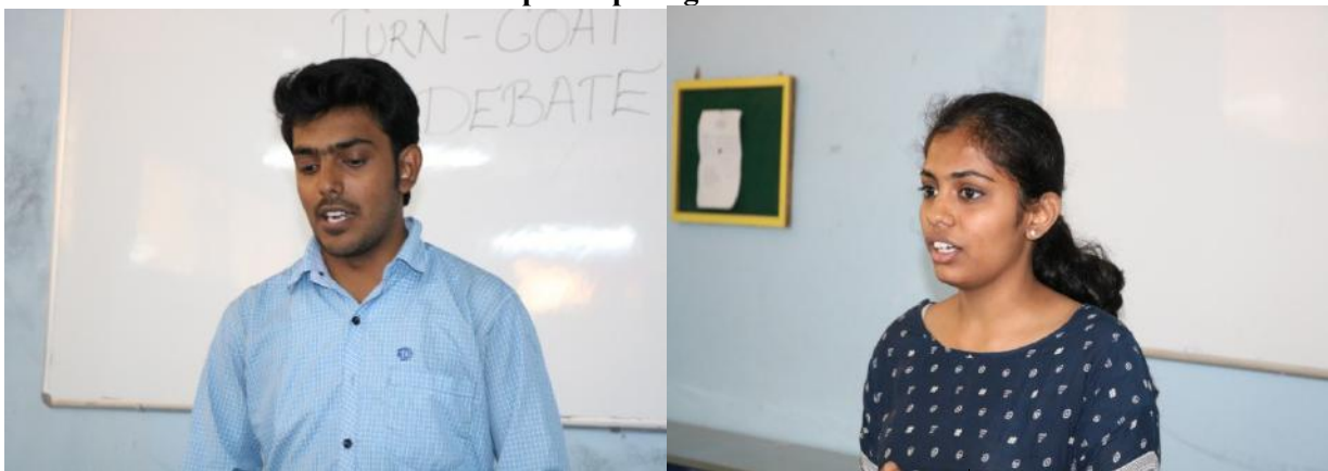
Students participating in Turncoat Debate