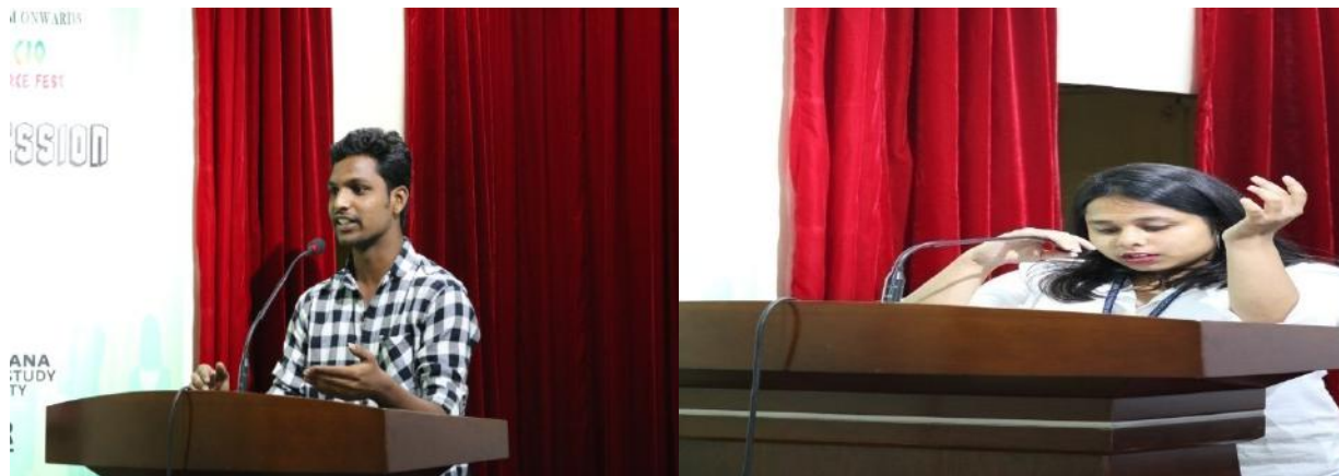
Students participating in Business Plan