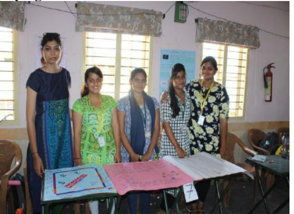
Participants displaying Models