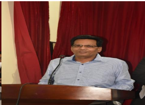
Address by Guests of Honour