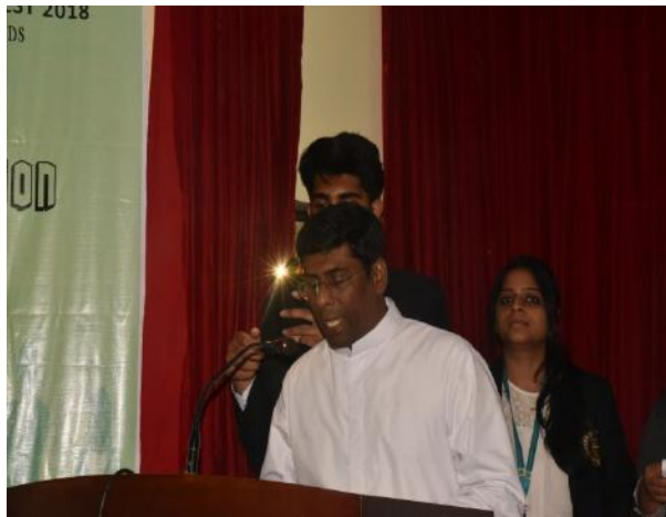
Address by Principal