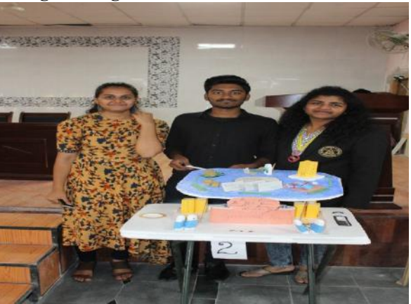
Participants displaying Models