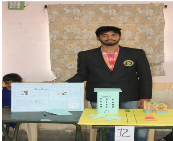
I Prize Winners