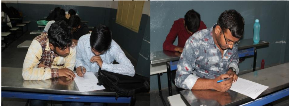
Students participating in Commerce Puzzle