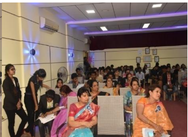
Faculty & Students