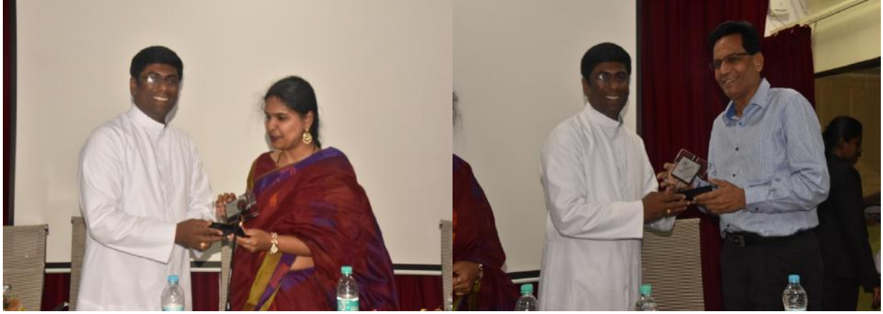
Felicitation of Chief Guest & Guest of Honour