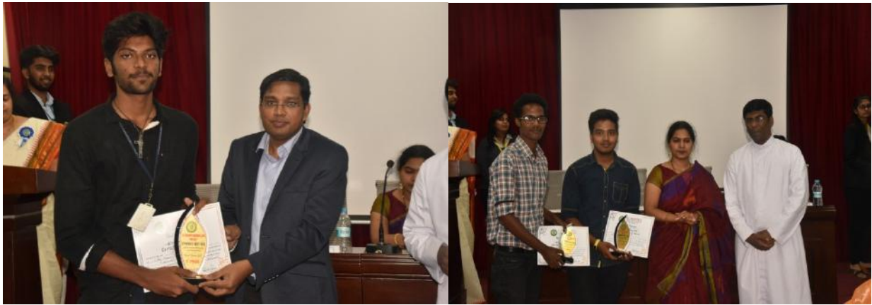
Winners awarded with Mementos and Certificates