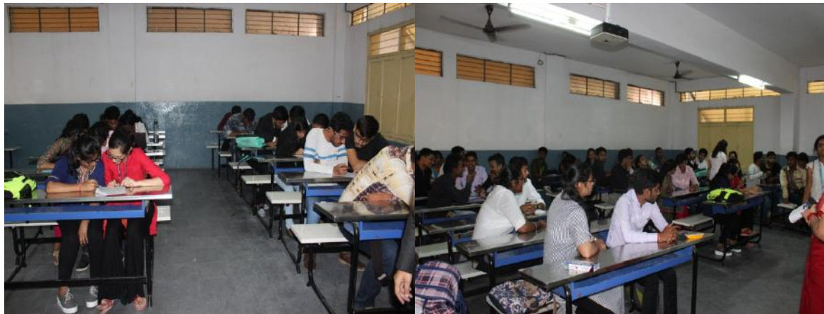
Students participating in Commerce Puzzle