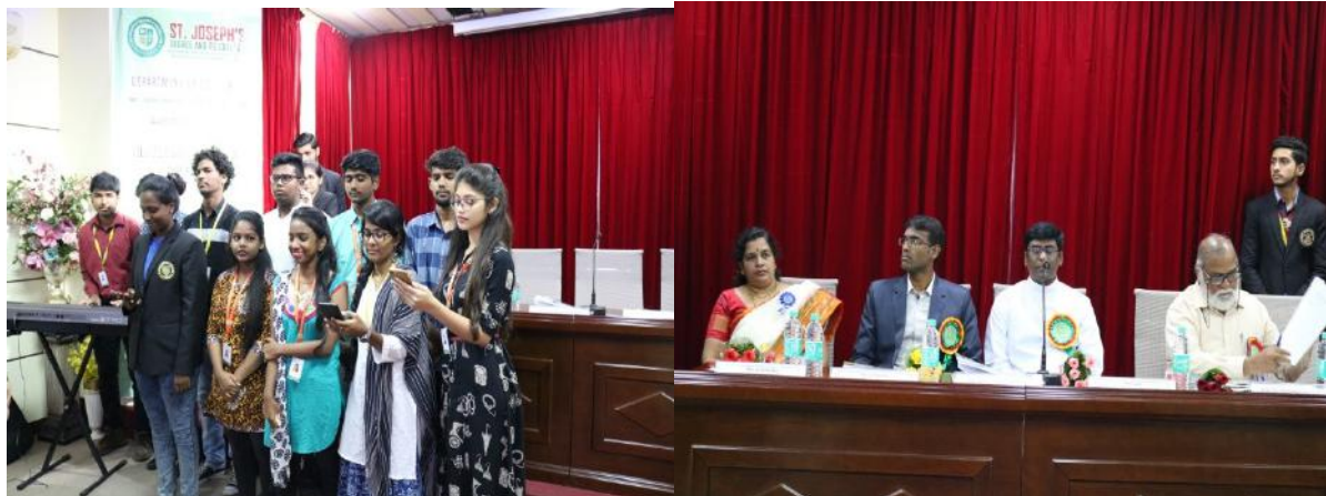
Prayer Song by College Choir “Anna Domini”