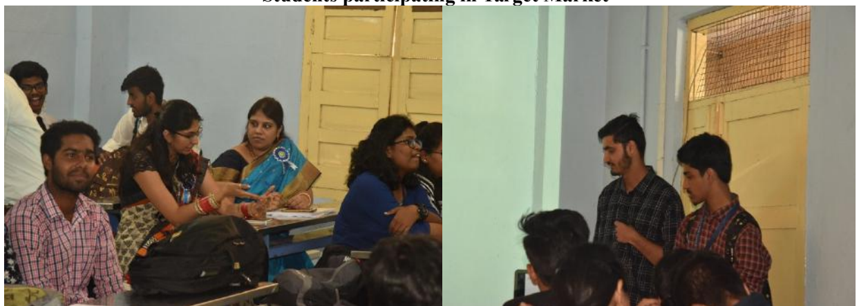
Faculty & Student Coordinators of Target Market