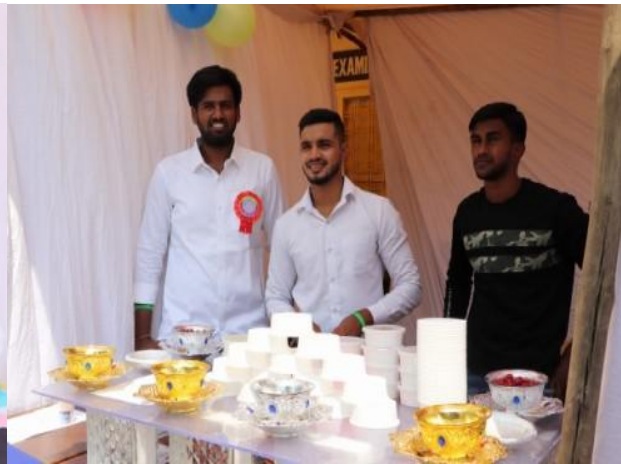
Students at Stalls