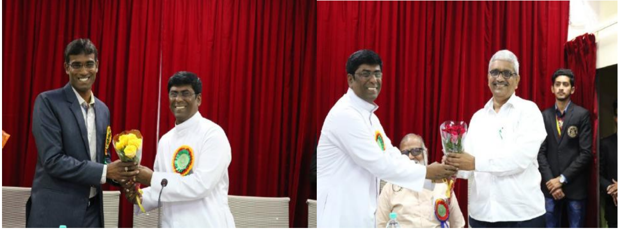
Welcoming of Chief Guest and Guest of Honour