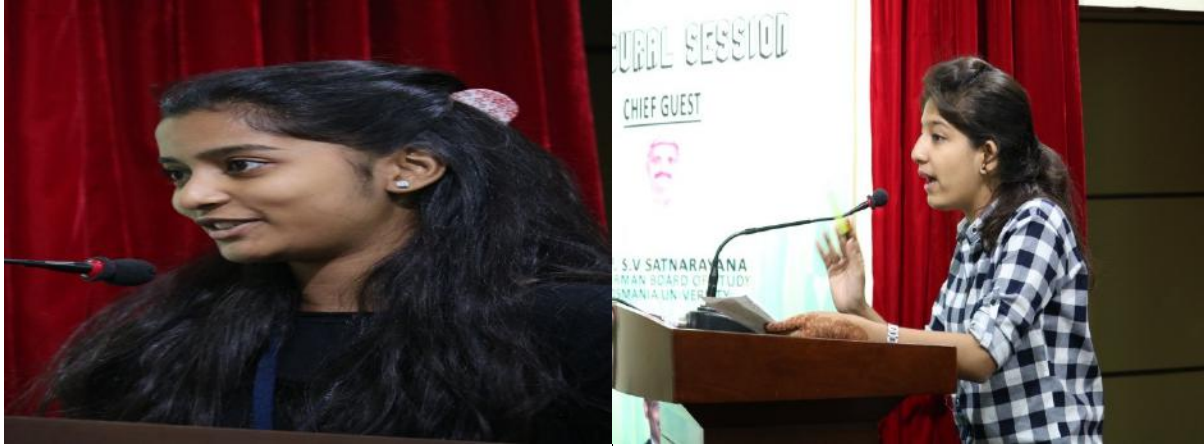
Students participating in Business Plan