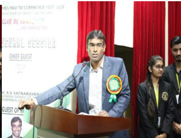
Address by Guest of Honour