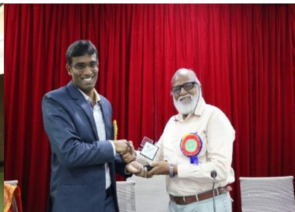
Felicitation of Chief Guest & Guest of Honour