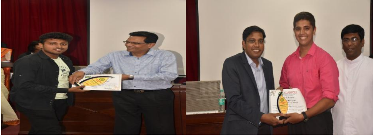
Winners awarded with Mementos and Certificates