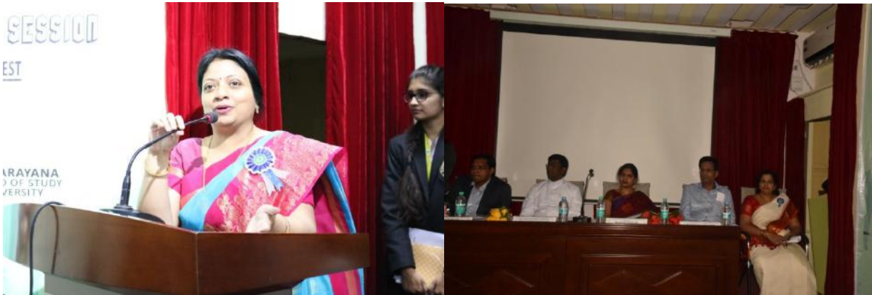
Rappoteur's report by Convenor of Fest