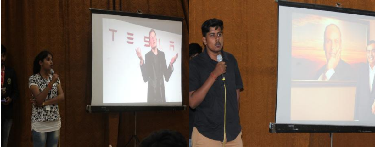
Students participating in JAM