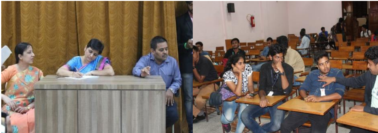
Faculty Coordinators and Judge for JAM