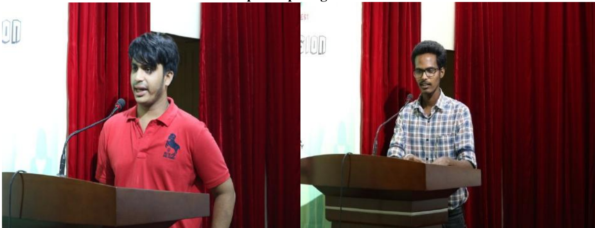
Students participating in Business Plan