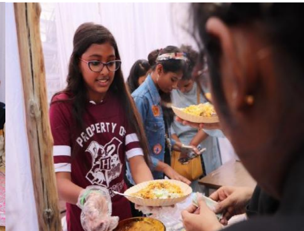
Students at Stalls