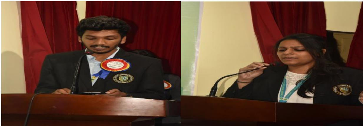
Introduction of Chief Guest and Guests of Honour