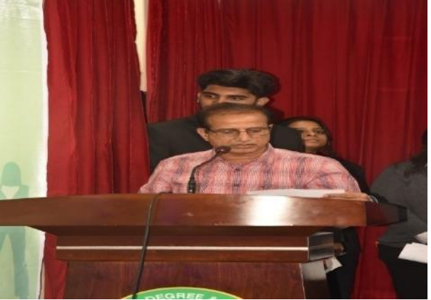
Controller of Examinations