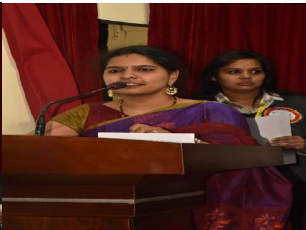
Address by Chief Guest