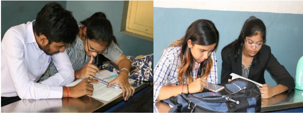
Students preparing for Case Study