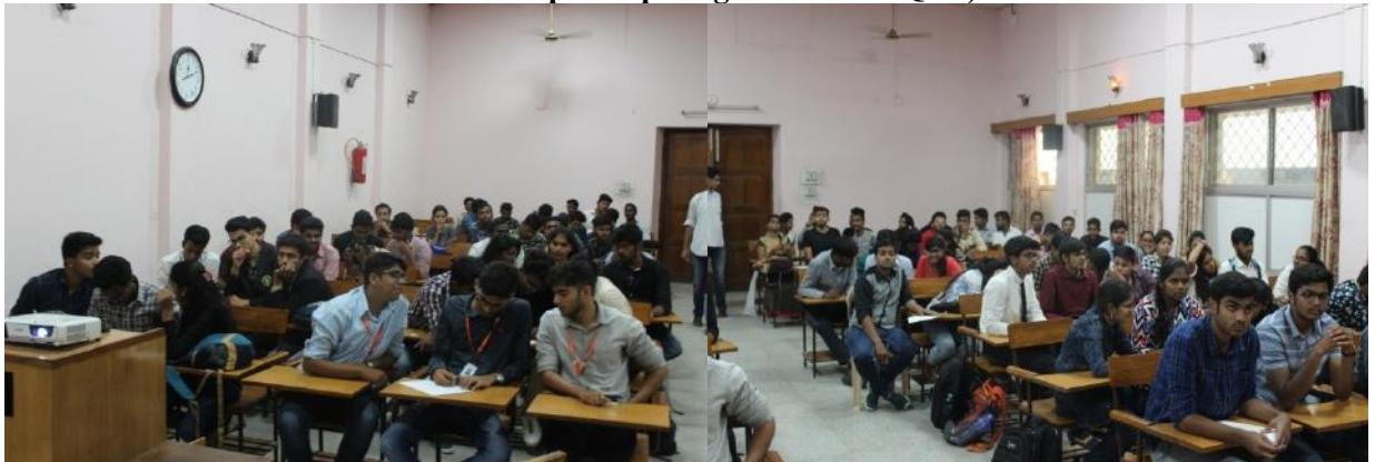
Students participating in Business Quiz)