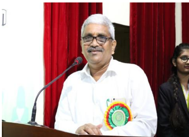
Address by Chief Guest