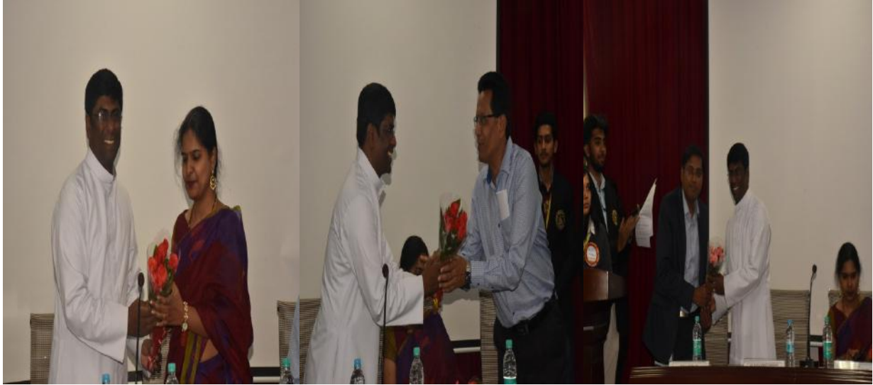
Welcoming of Chief Guest and Guests of Honor