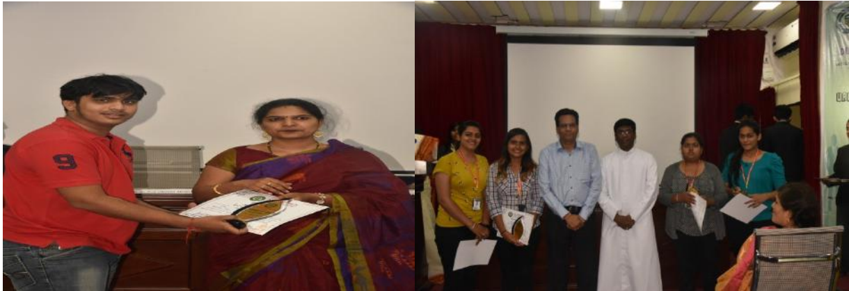
Winners awarded with Mementos and Certificates