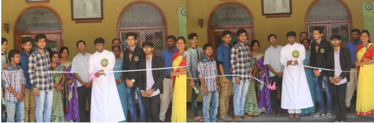
Inauguration of Food Fest