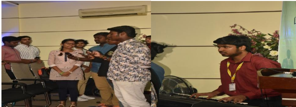
Prayer Song by College Choir “Anna Domini”