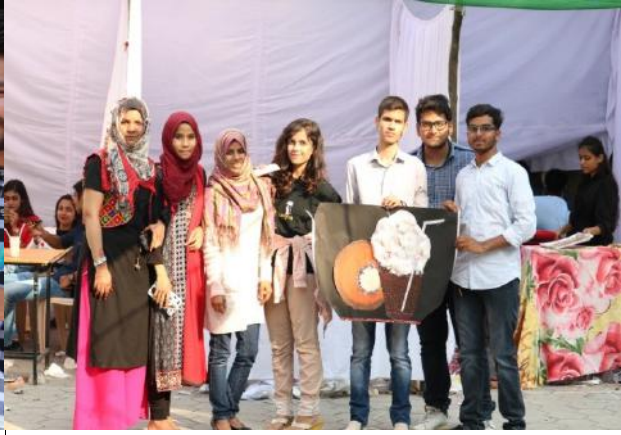
Students at Stalls