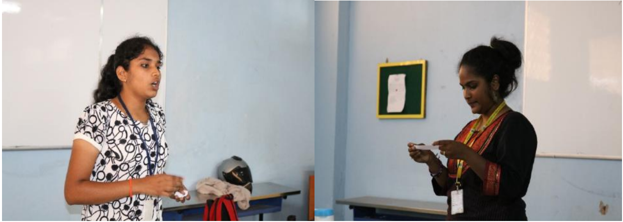
Students participating in Turncoat Debate