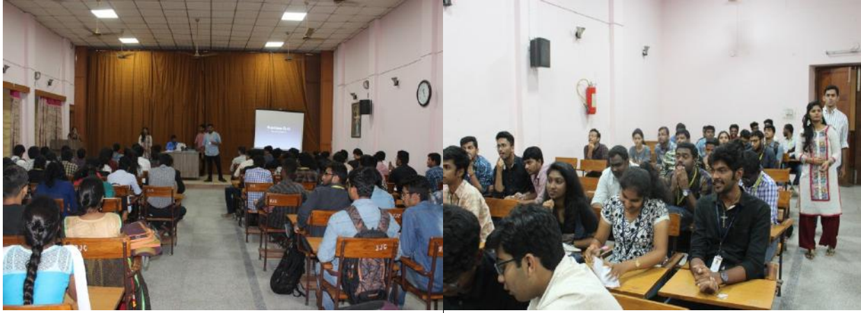
Students participating in Business Quiz)