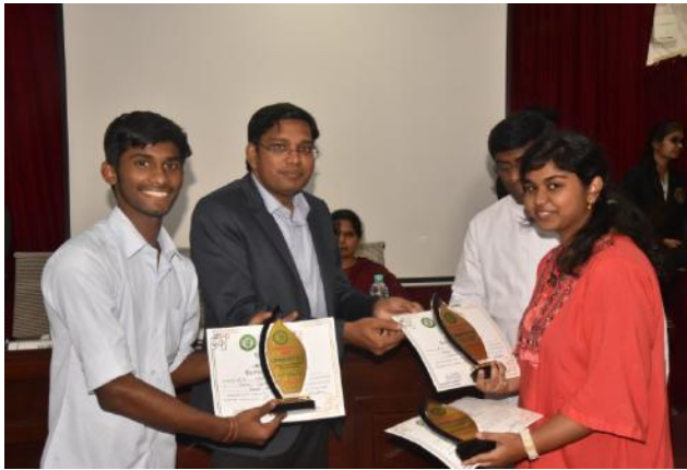
Winners awarded with Mementos and Certificates