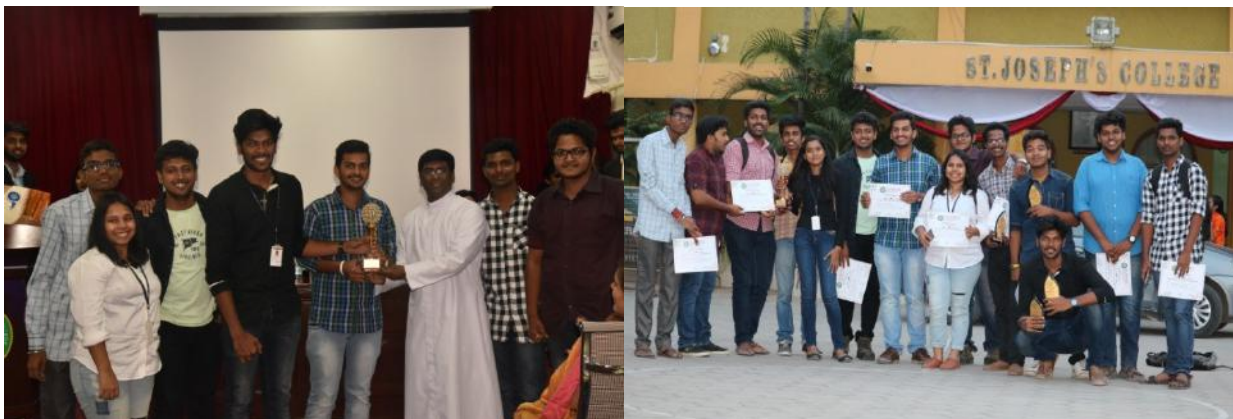
Overall Championship – Little Flower Degree College