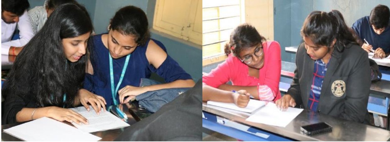
Students preparing for Case Study