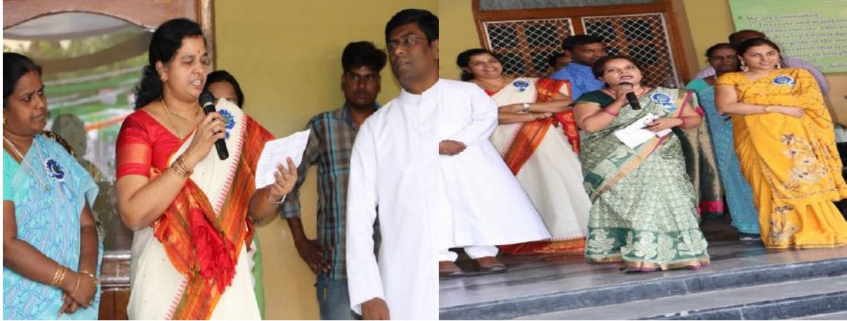
Declaration of Winners