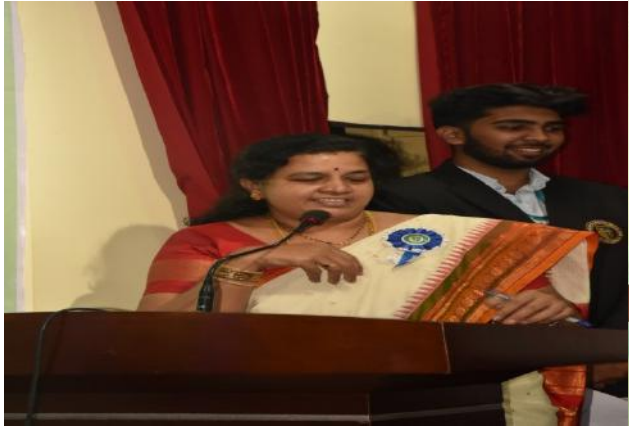
Head, Department of Commerce