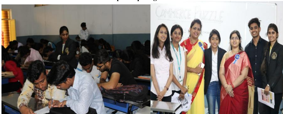
Faculty and Student Coordinators of Commerce Puzzle