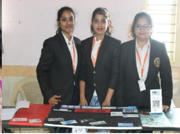
Participants explaining to Judges