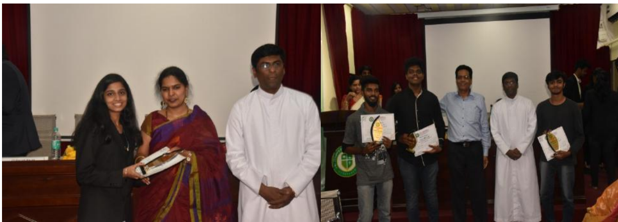
Winners awarded with Mementos and Certificates