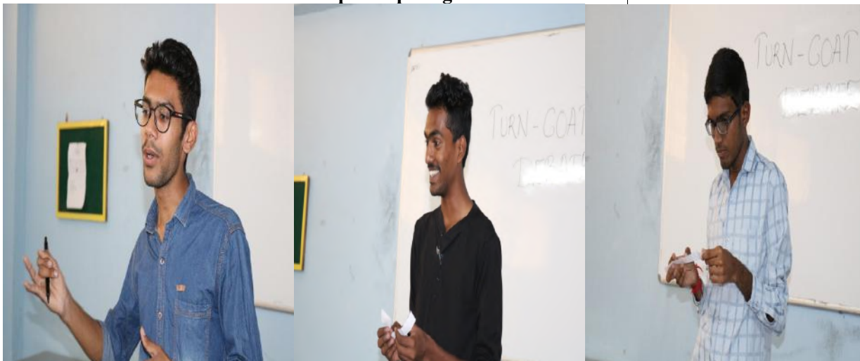
tudents participating in Turncoat Debate