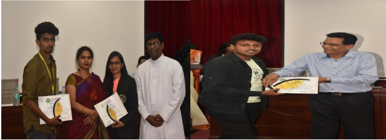
Winners awarded with Mementos and Certificates