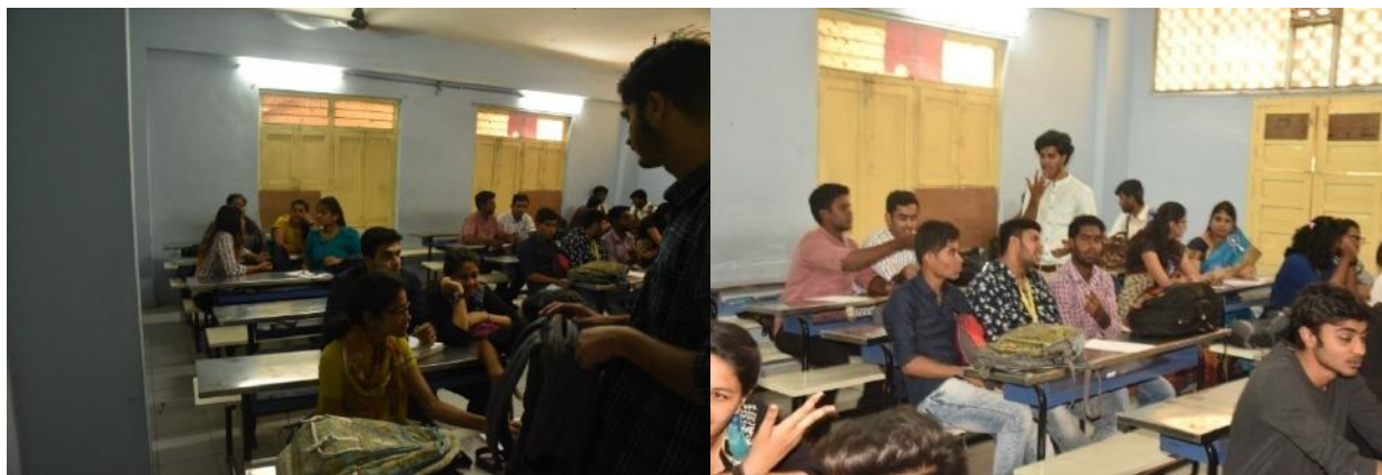
Students participating in Target Market