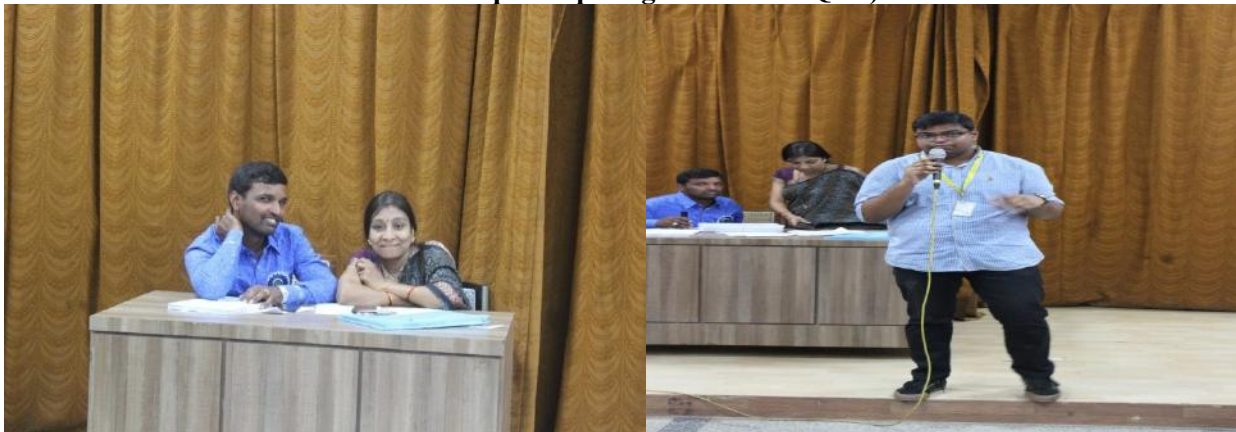
Faculty & Student Coordinators for Business Quiz