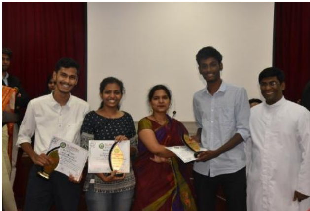
Winners awarded with Mementos and Certificates