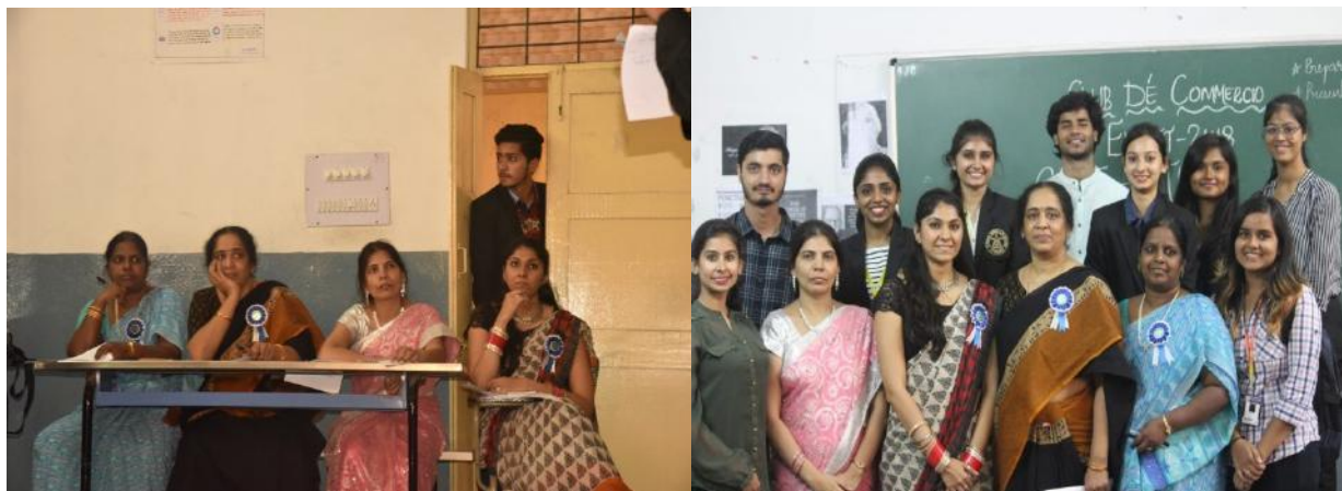
Judges and Student Coordinators of Case Study