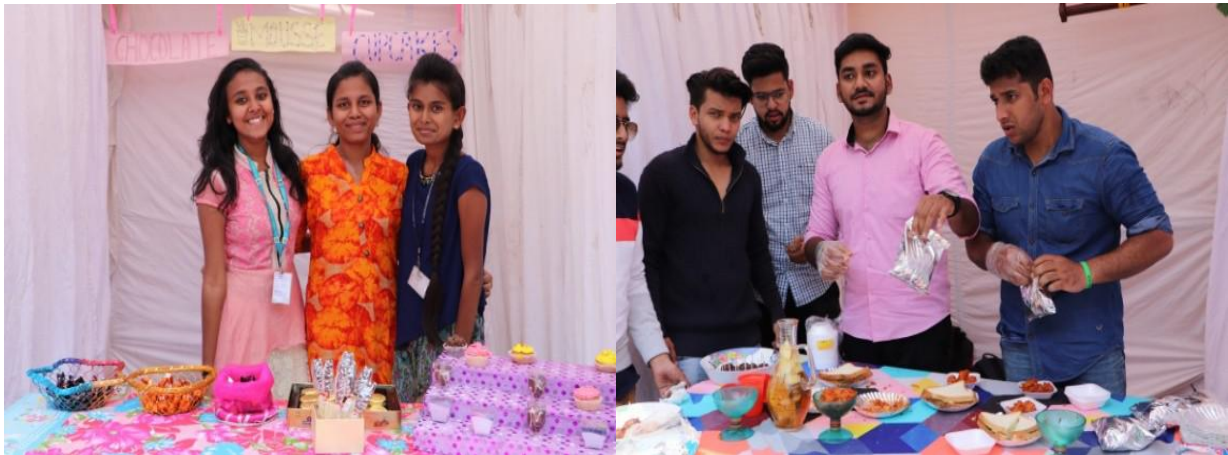
Students at Stalls