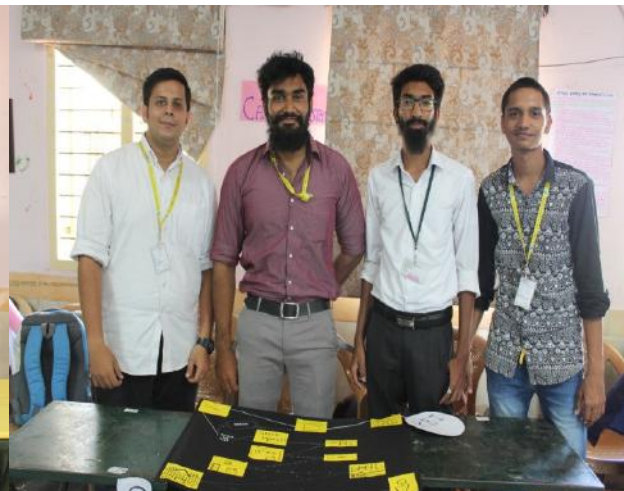
II Prize Winners