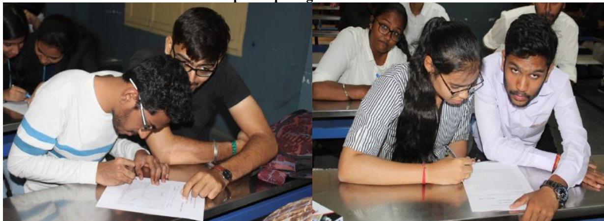
Students participating in Commerce Puzzle