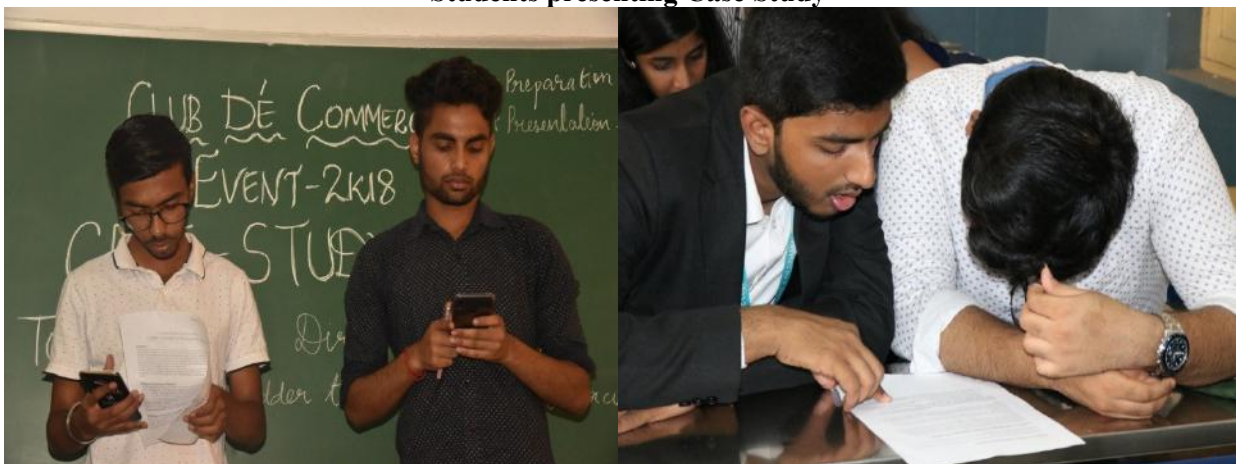
Students participating in Case Study