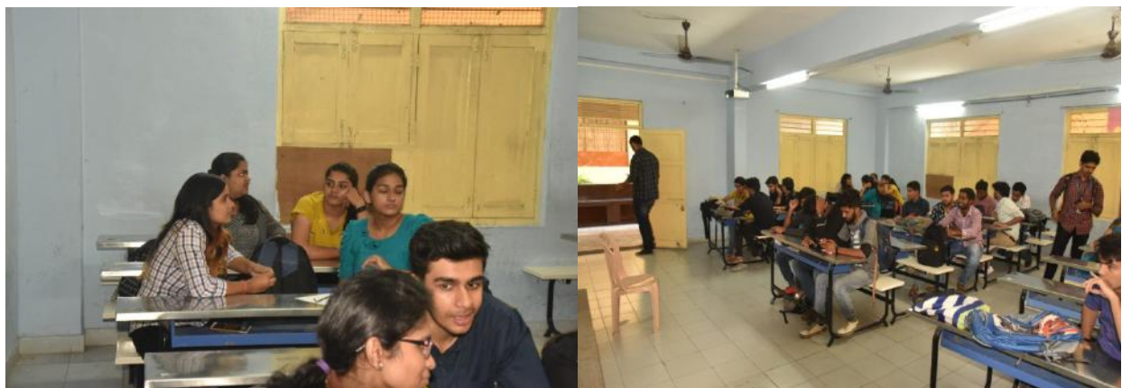
Students participating in Target Market