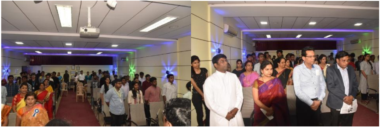
Singing of National Anthem