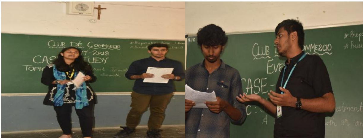
Students presenting Case Study