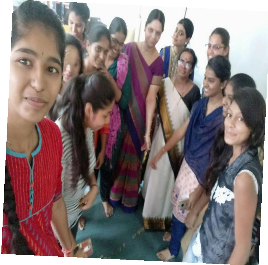
(This photo has to be placed properly)