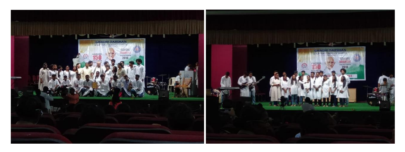
College Choir "Anna Domini" Performing at "Gandhi -150 Jayanthi Abhiyan"