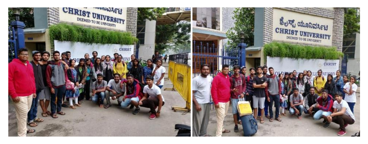
Students at JEHOSHUA – TALENT FOR CHRIST 2018