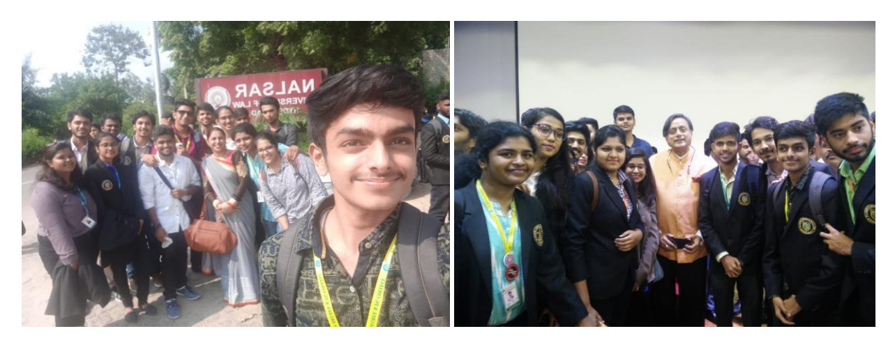
Students participating in "Straight Talk with Shashi Tharoor"