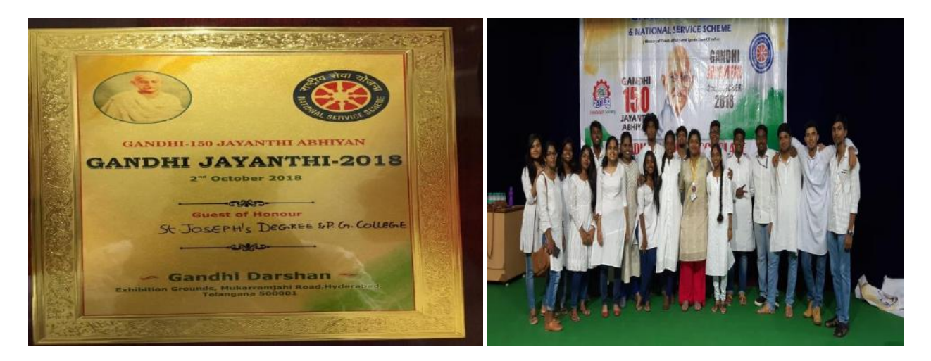
St. Josephs Degree & PG College Choir "Anna Domini" was awarded "Guest of Honour"