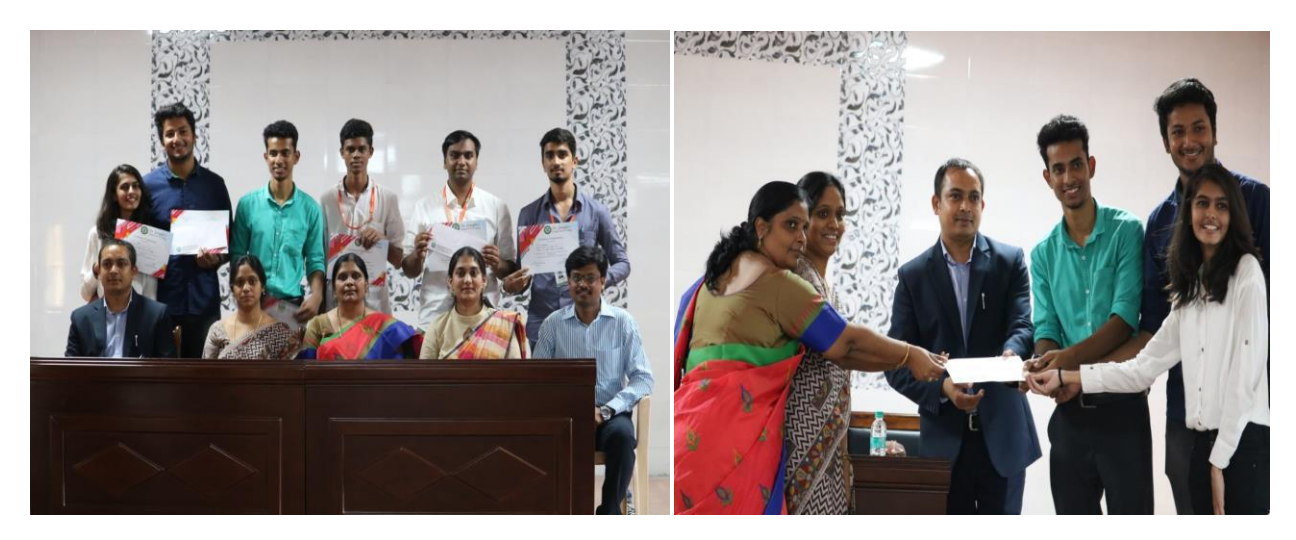
I Prize at 7<sup>th</sup> Informatique Exhib – Future Techs 2018