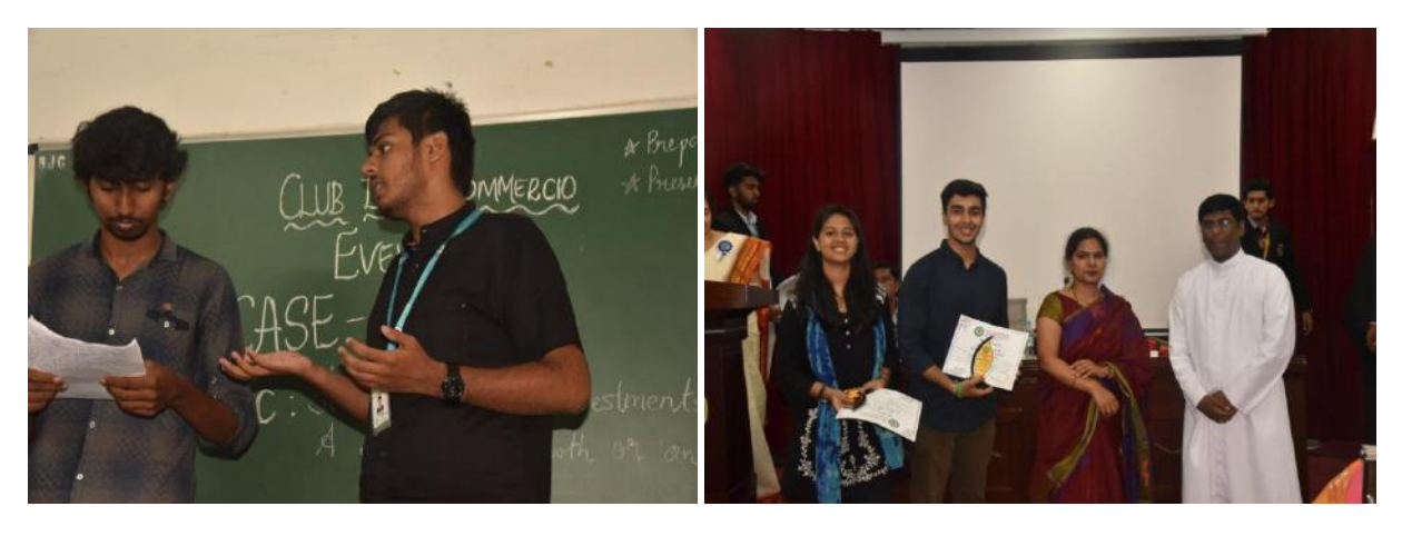
II & III Prize at "Club Di Commercio – Inter Collegiate Commerce Fest"