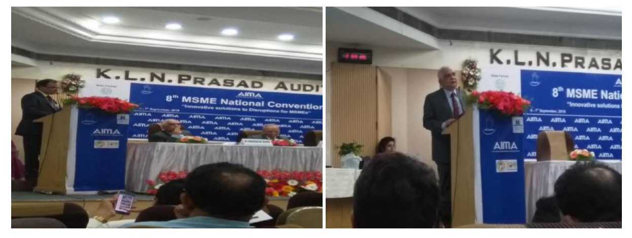
8th National MSME Convention on "Innovative Solutions to Disruptions for MSMEs"