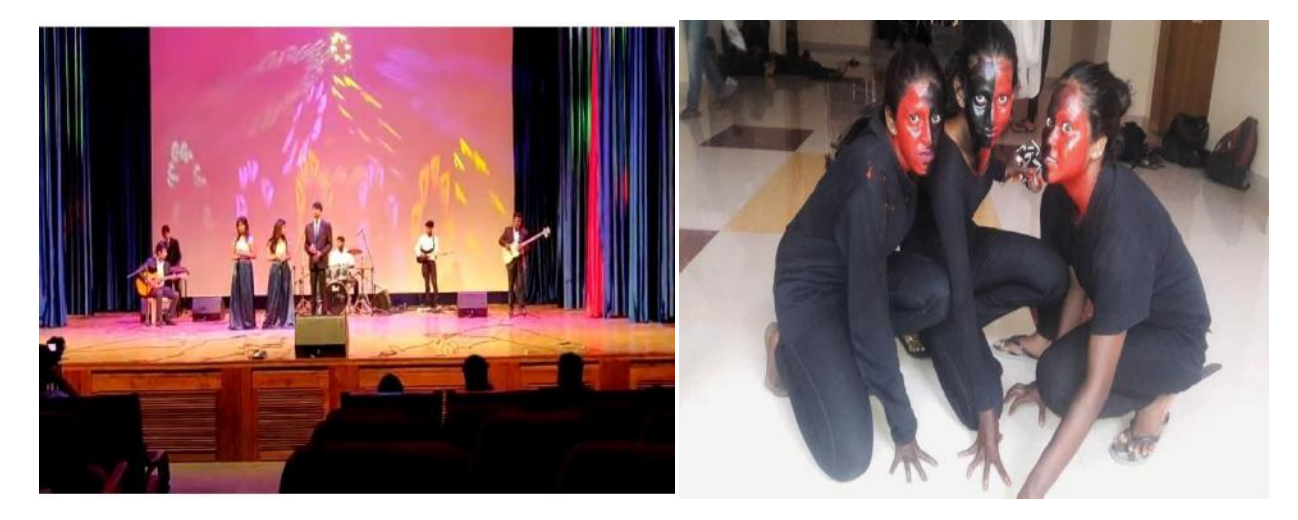
Winners at JEHOSHUA – TALENT FOR CHRIST 2018