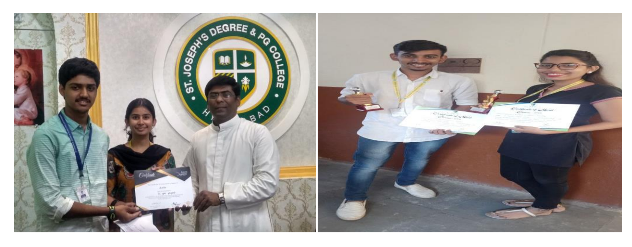
Winners at "ANUNCIO-The AD World 2K18"