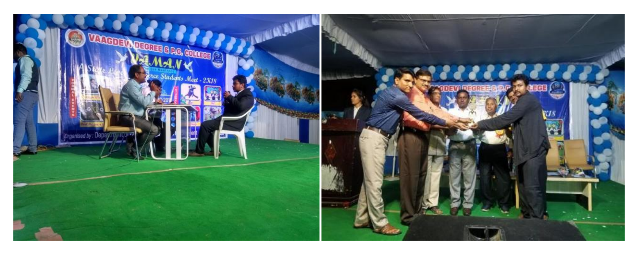
I Prize at "VAMAN", State level Commerce Students Meet 2018