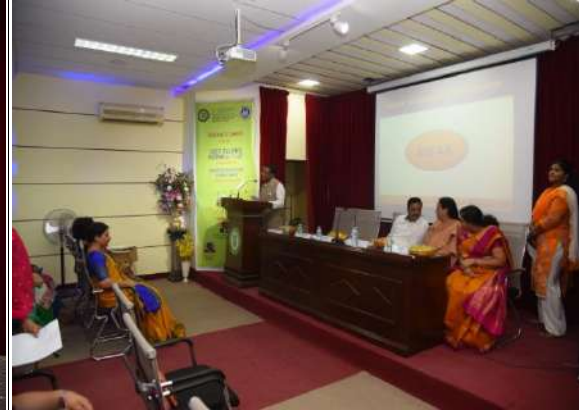
FDP on Ind As