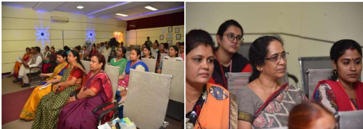
Faculty attending FDP on Ind As