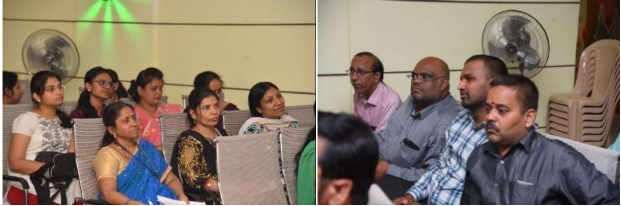
Faculty attending FDP on Ind As