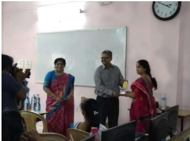
FDP on Effective Communication skills for Teachers