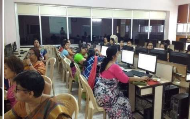
SPSS Training in Computer Lab