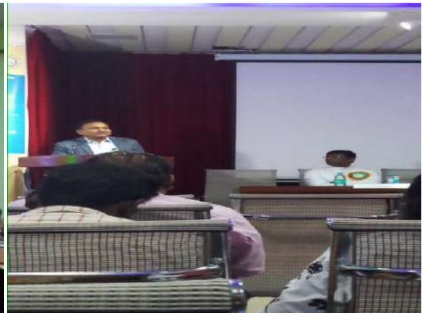
FDP on Strategic Business Reporting Faculty attending National Seminar cum Workshop on IPR