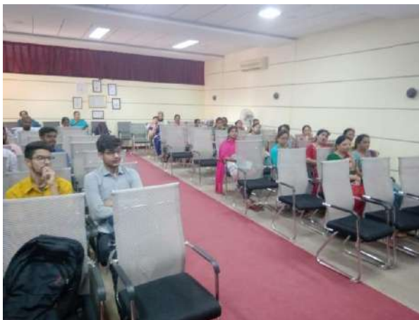
FDP on “e-Filing of IT returns”