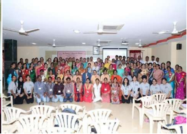
National Seminar on Library Resources for Teaching and Research – Opportunities & Challenges