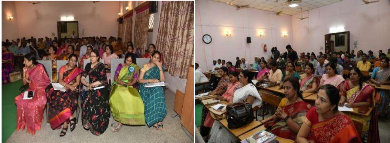
Faculty attending National Conference cum Workshop on “Outcome Based Education”