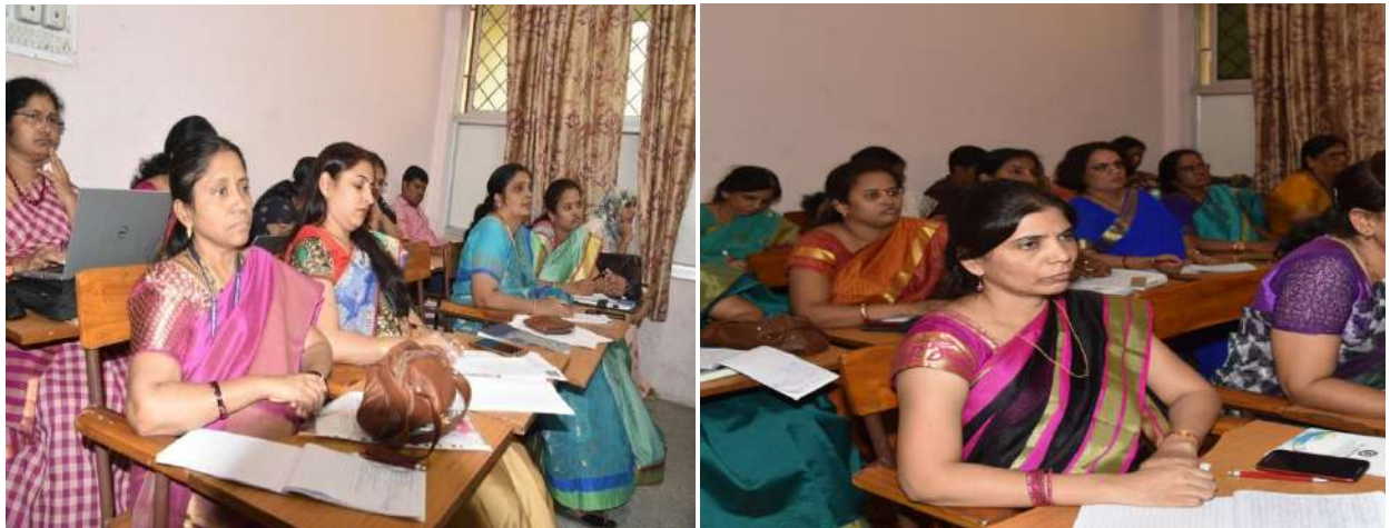
Faculty attending National Conference cum Workshop on “Outcome Based Education”