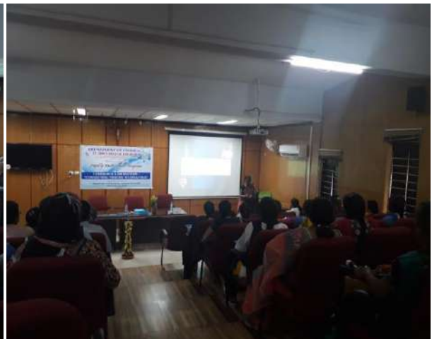
FDP on “Commerce Laboratory – Connecting Theory to to Practice”