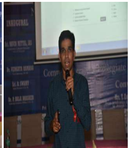
Resource Persons at National Conference cum Workshop on “Outcome Based Education”