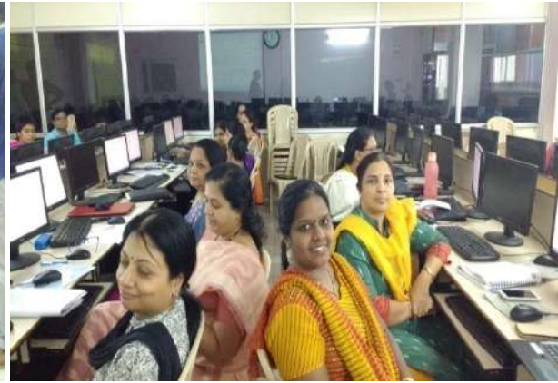
SPSS Training in Computer Lab