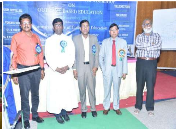
Dignitaries at National Conference cum Workshop on “Outcome Based Education”