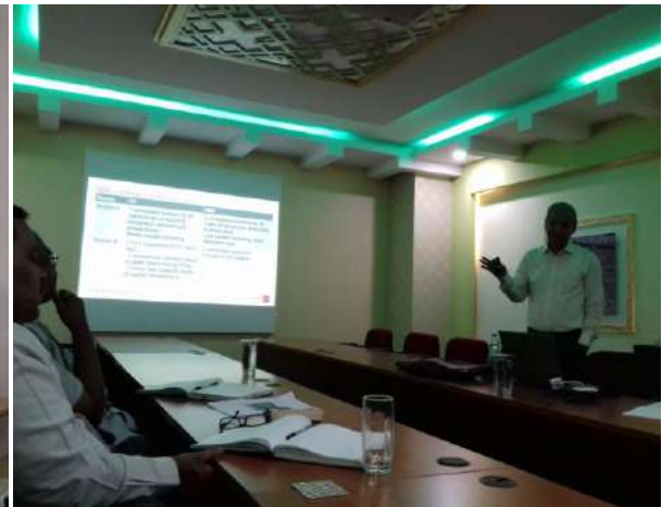
FDP on Strategic Business Leader