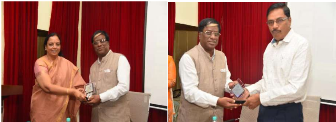
Felicitation of Dignitaries - FDP on Ind As