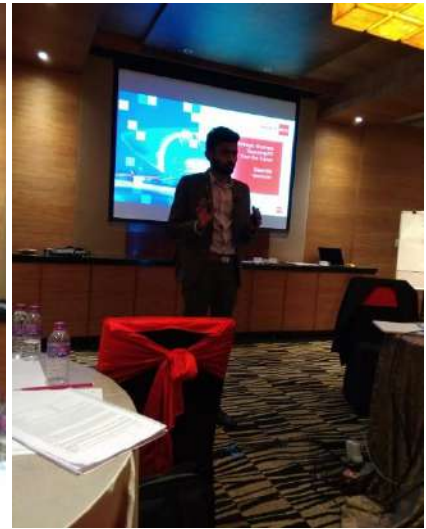
FDP “Train the Trainer” in Strategic Business Reporting & Financial Reporting