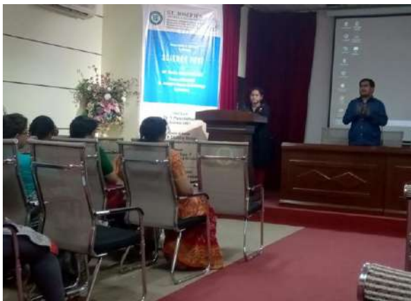
FDP on “e-Filing of IT returns”