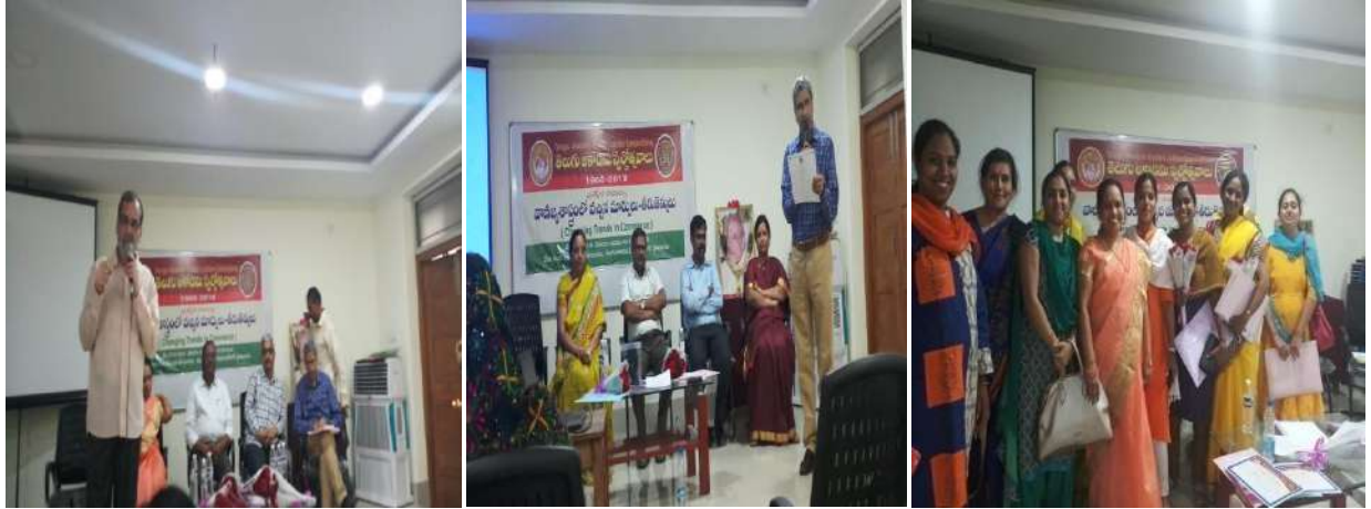
Seminar on Changes in Commerce