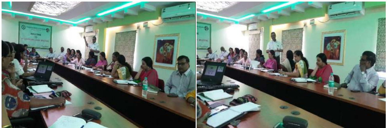
Workshop on Research Methodology (Theoretical Concepts)