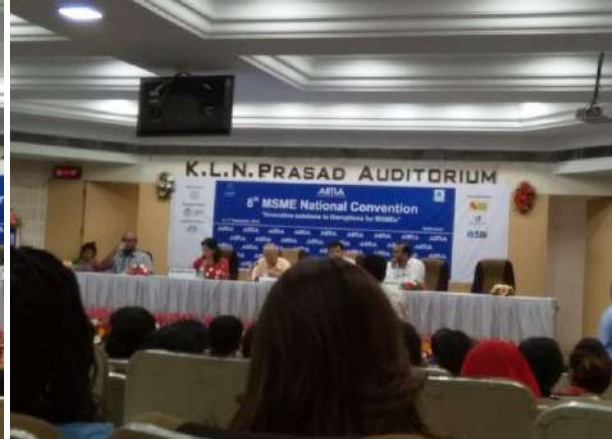
8 th National MSME Convention on “Innovative Solutions to Disruptions for MSMEs”