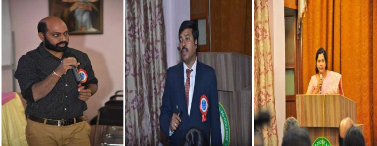
Resource Persons & HOD at National Conference cum Workshop on “Outcome Based Education”