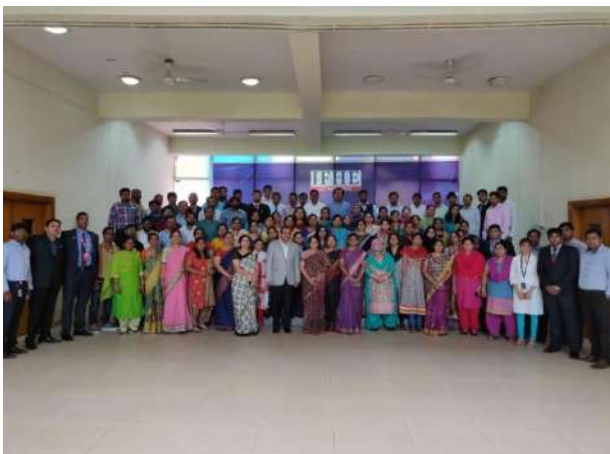
FDP on Innovative approaches for "Teaching & Evaluation