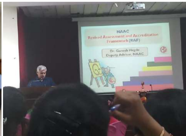
FOP on NAAC