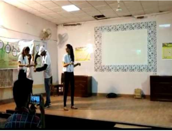
I Prize in Skit at "Saksham-2019"