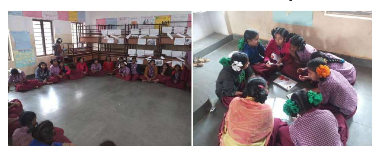
Activities conducted at Voice 4 Girls Disha Camp