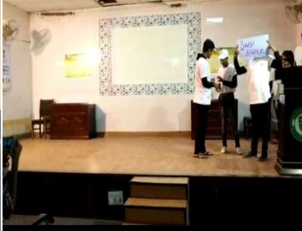
I Prize in Skit at "Saksham-2019"