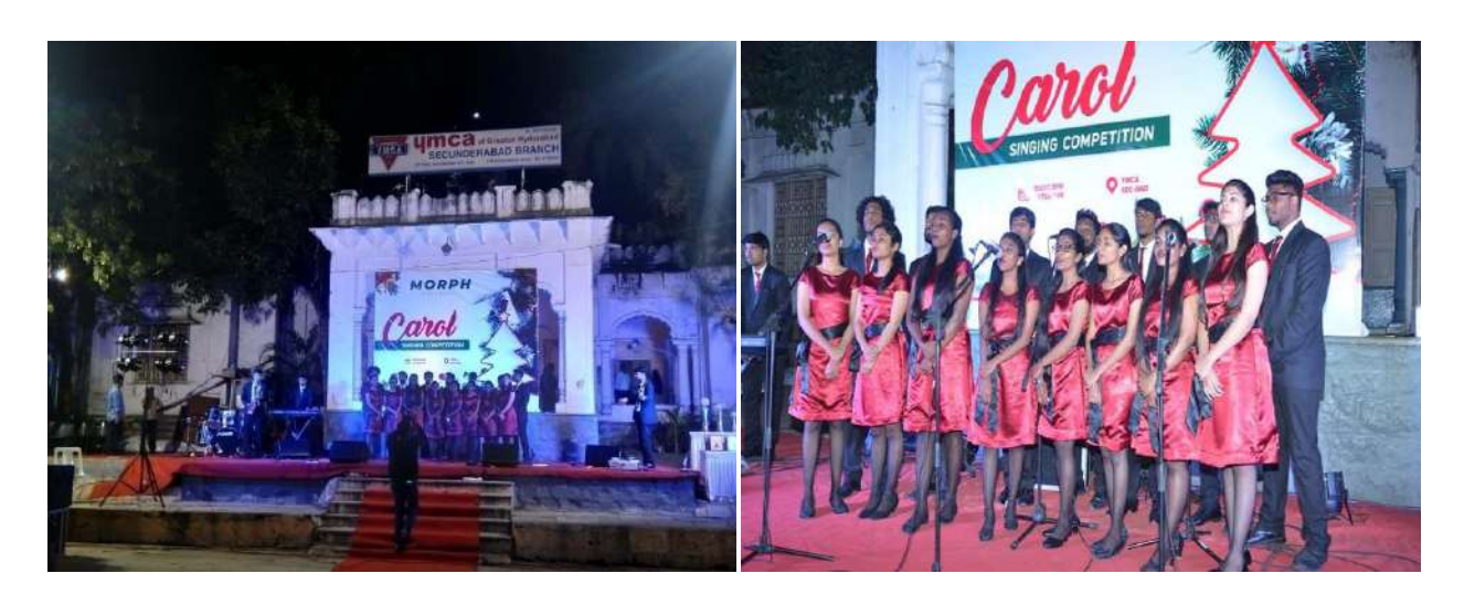
III Prize at Carol Singing, Morph