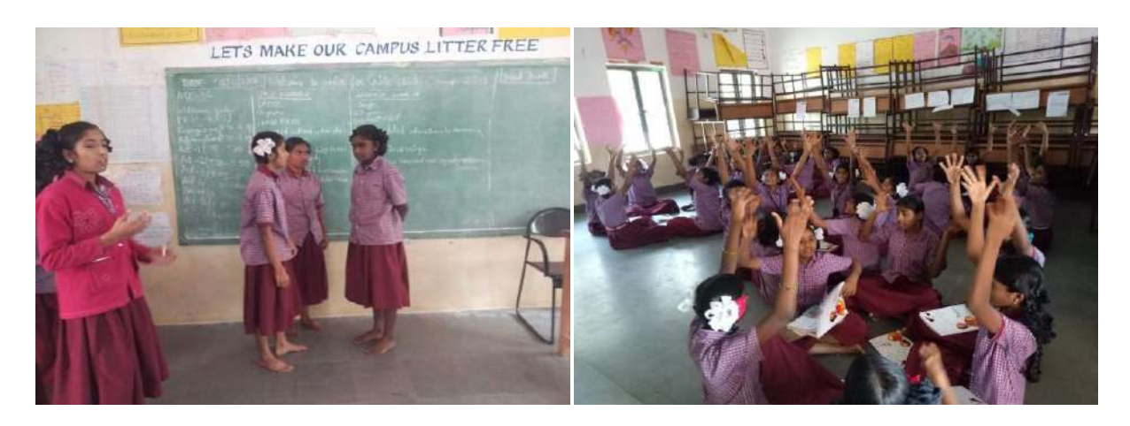
Activities conducted at Voice 4 Girls Disha Camp