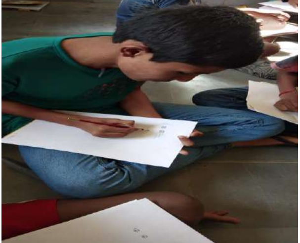
Activities conducted at Boys 4 Voice Fireflies Camp