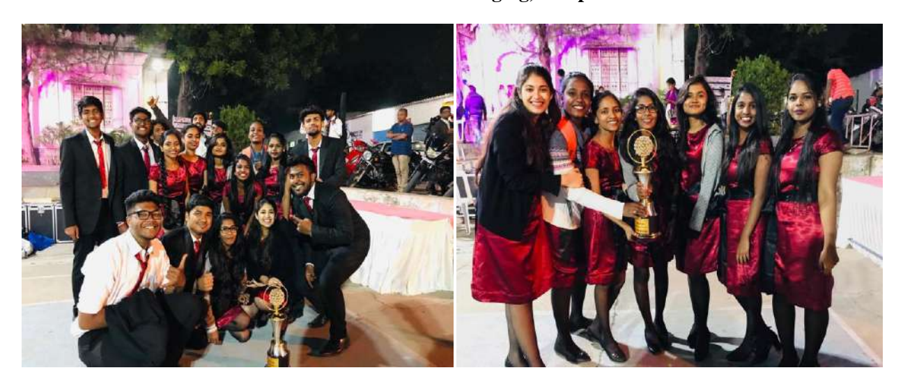
III Prize at Carol Singing, Morph