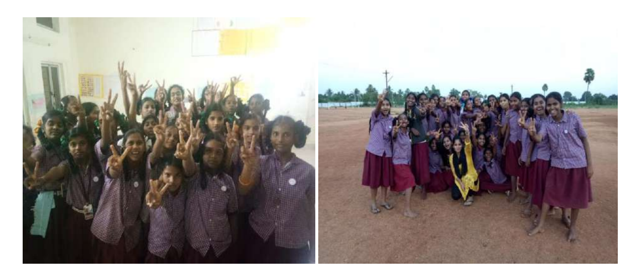
Smiling faces at Voice 4 Girls Disha Camp