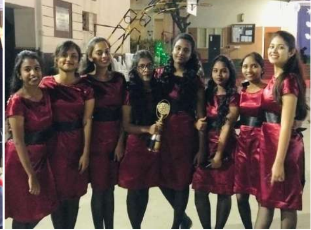
III Prize at United Carol Singing, Little Flower High School