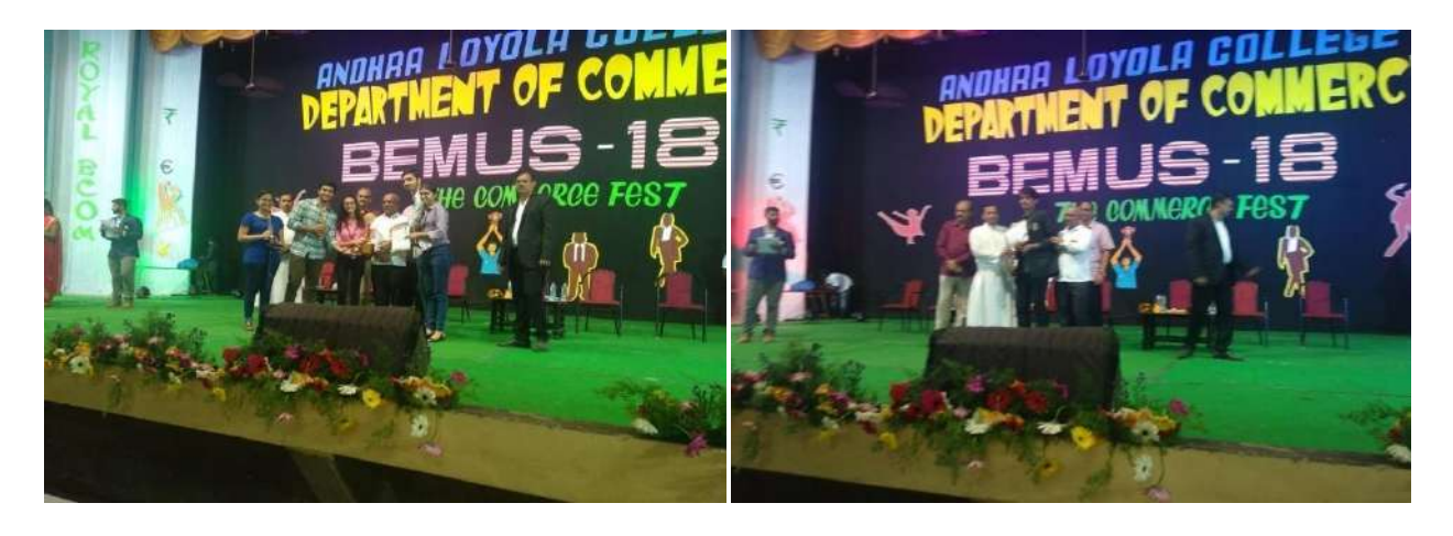
Winners at BEMUS 18