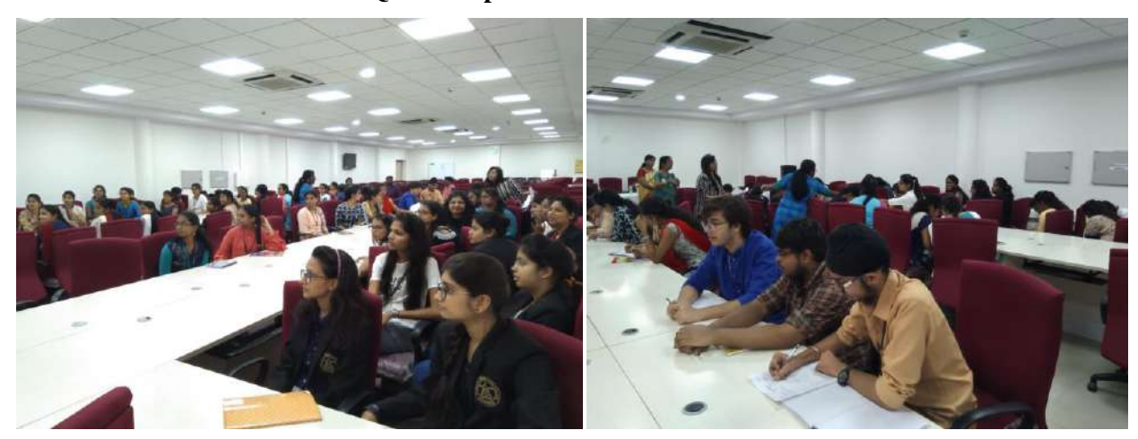
Students participating in Quiz Competition at NRSC-ISRO Outreach facility at Jeedimetla, Hyd