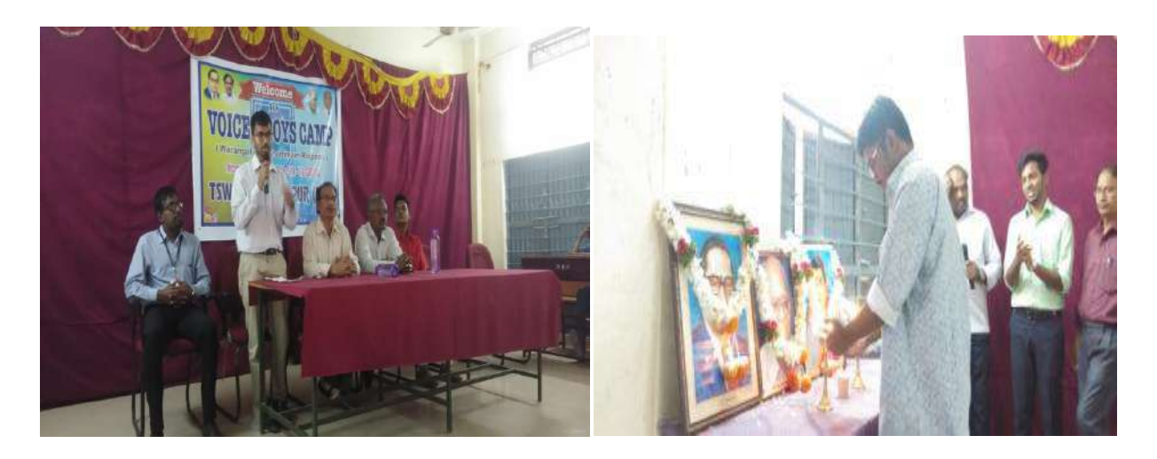
Valedictory Ceremony of Boys 4 Voice Fireflies Camp