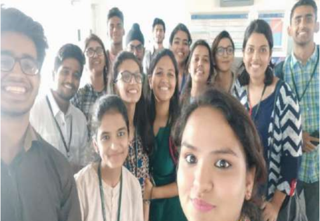
Students participating in the Drive