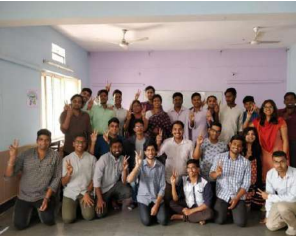
Students receiving Training