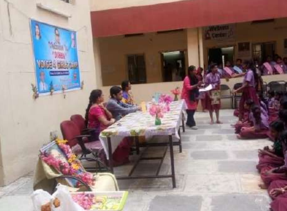
Inaugural Ceremony of Voice 4 Girls Disha Camp