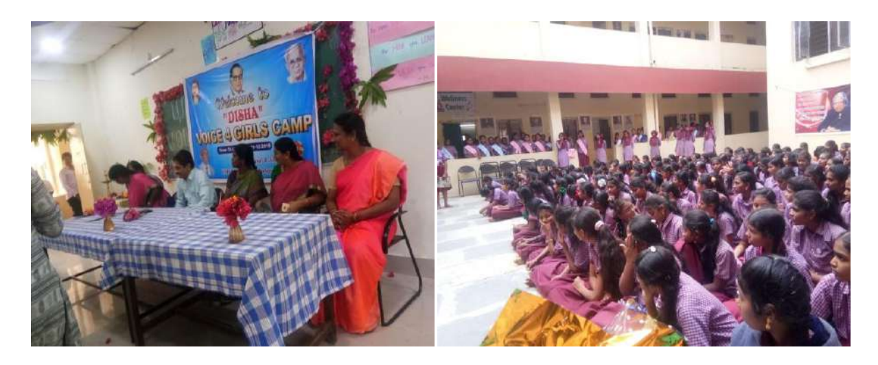
Valedictory Ceremony of Voice 4 Girls Disha Camp