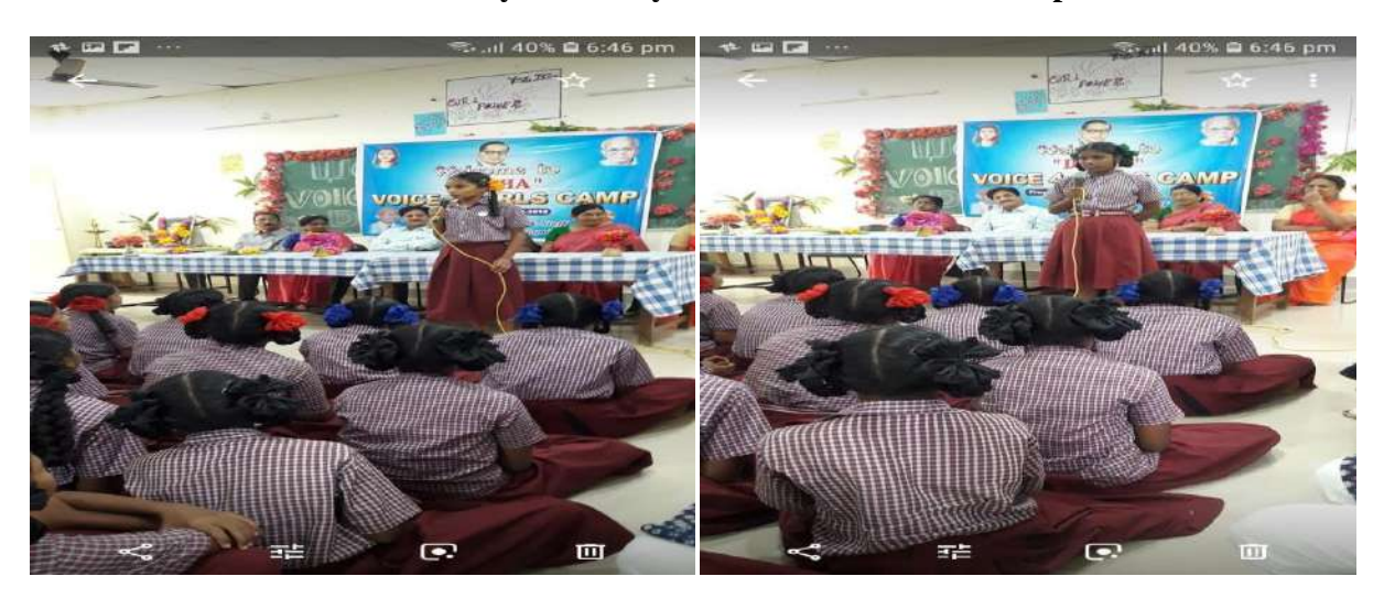
Campers sharing their experiences on Voice 4 Girls Disha Camp