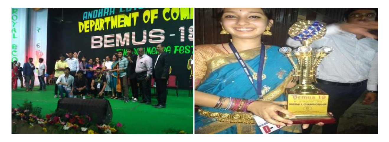
Overall Championship at BEMUS 18