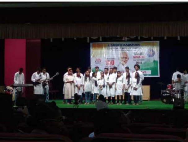
College Choir "Anna Domini" Performing at "Gandhi -150 Jayanthi Abhiyan"