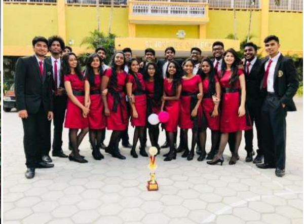
II Prize at Carols Fiesta, St.Marys Degree College