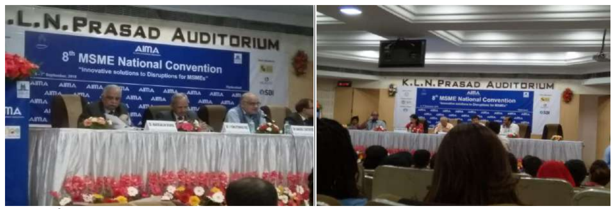
8th National MSME Convention on "Innovative Solutions to Disruptions for MSMEs"