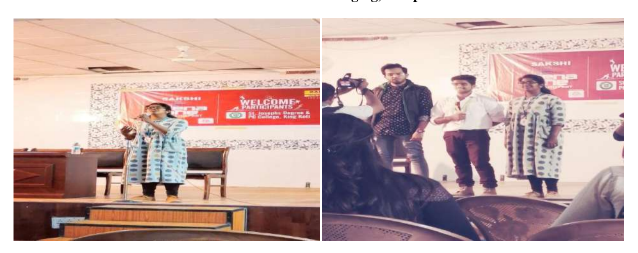
II Prize in Solo Singing at Saakshi Arena One- The Youth Fest