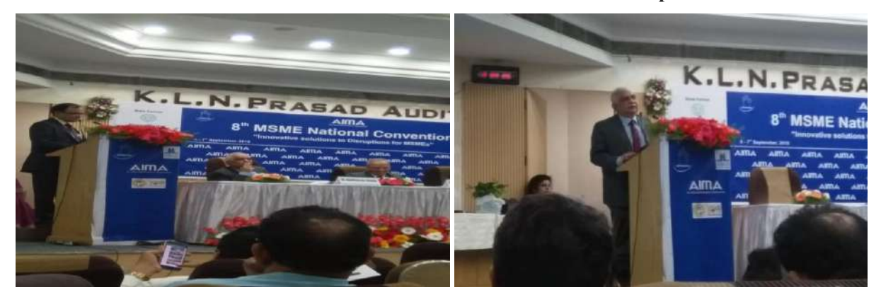
8th National MSME Convention on "Innovative Solutions to Disruptions for MSMEs"