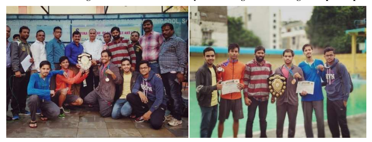
St.Josephs Degree & PG College won II Prize at Osmania University Inter College Swimming Championship for men