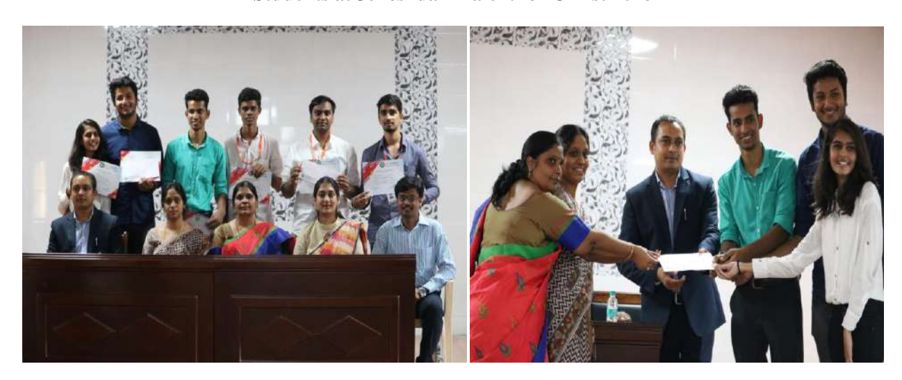
I Prize at 7^{th} Informatique Exhib – Future Techs 2018