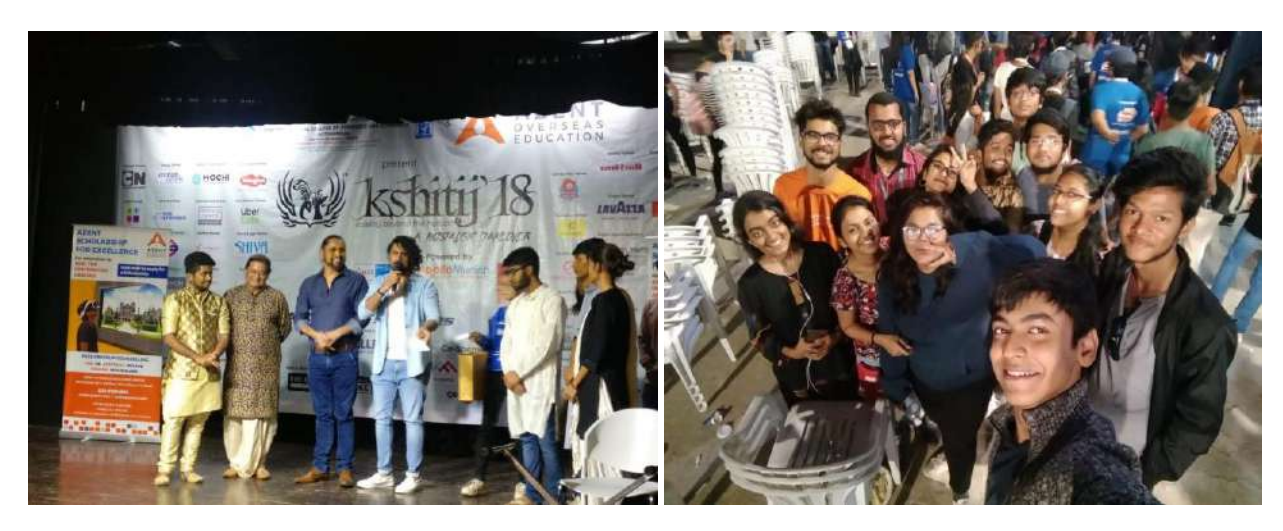
Students at "Kshtij 18", Mithibai College Mumbai