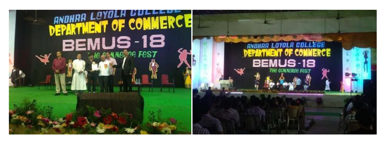
Winners at BEMUS 18