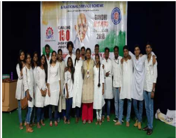
St. Josephs Degree & PG College Choir "Anna Domini" was awarded "Guest of Honour"