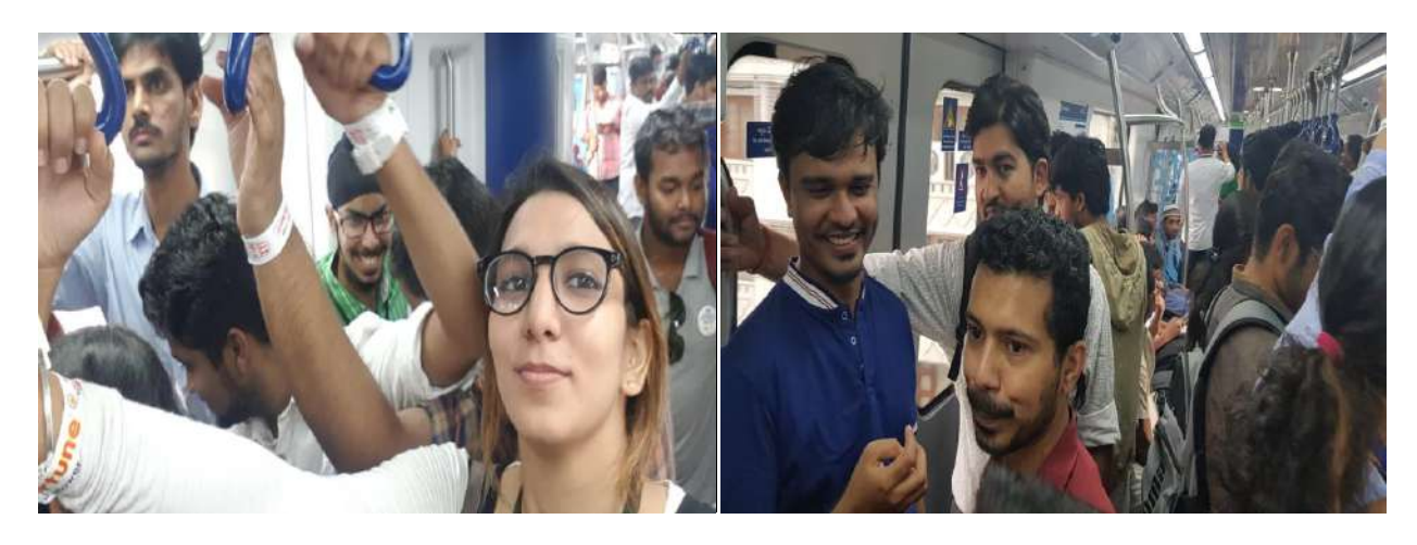
Students with co-passengers on a metro ride