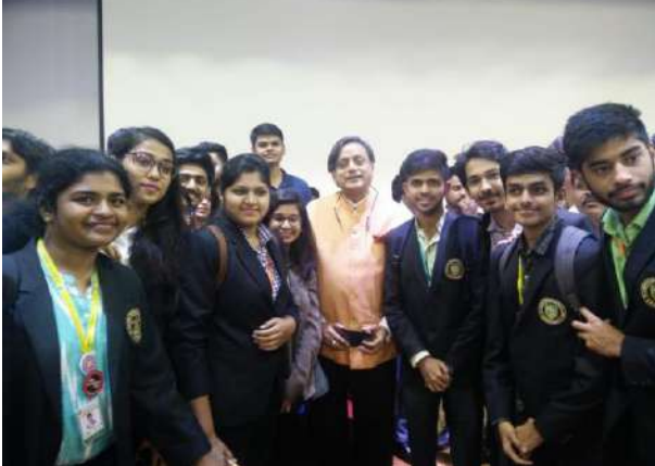
Students participating in "Straight Talk with Shashi Tharoor"