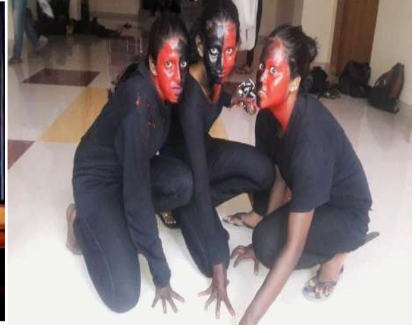
Winners at Jehoshua – Talent for Christ 2018