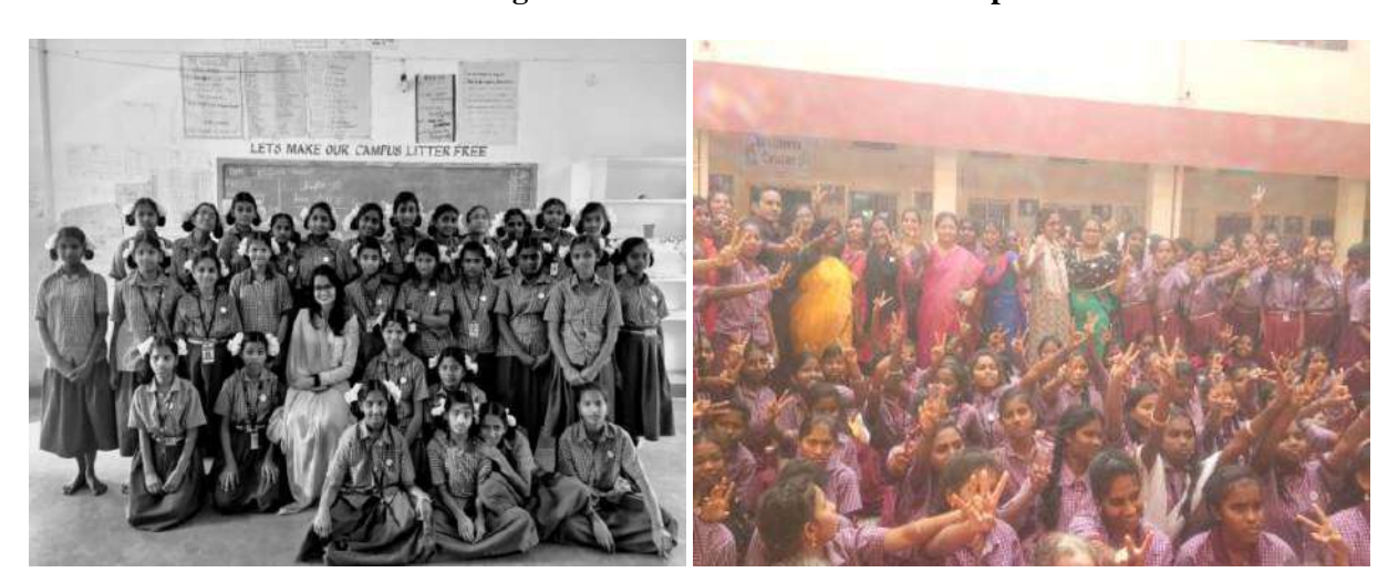
Teachers and Campers at Voice 4 Girls Disha Camp