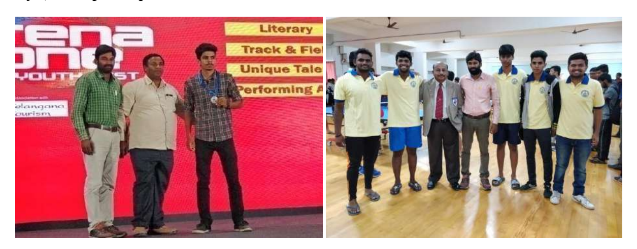
St.Josephs Degree & PG College won I Prize at Osmania University Inter College Table Tennis Tournament for men