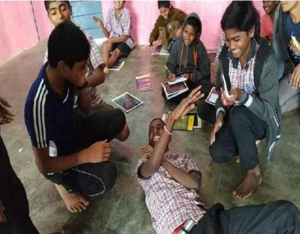
Activities conducted at Boys 4 Voice Fireflies Camp