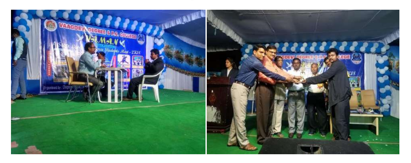
I Prize at "VAMAN", State level Commerce Students Meet 2018