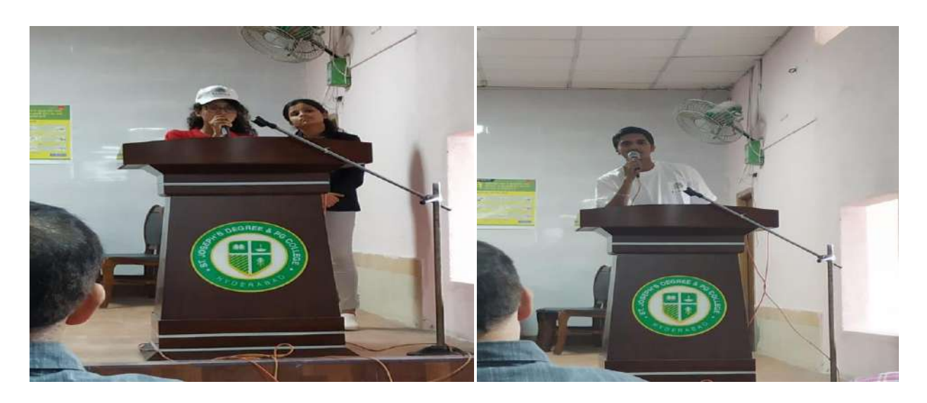
II &III Prize in Debate at "Saksham-2019"