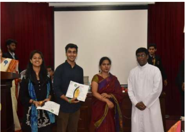
II & III Prize at "Club Di Commercio – Inter Collegiate Commerce Fest"