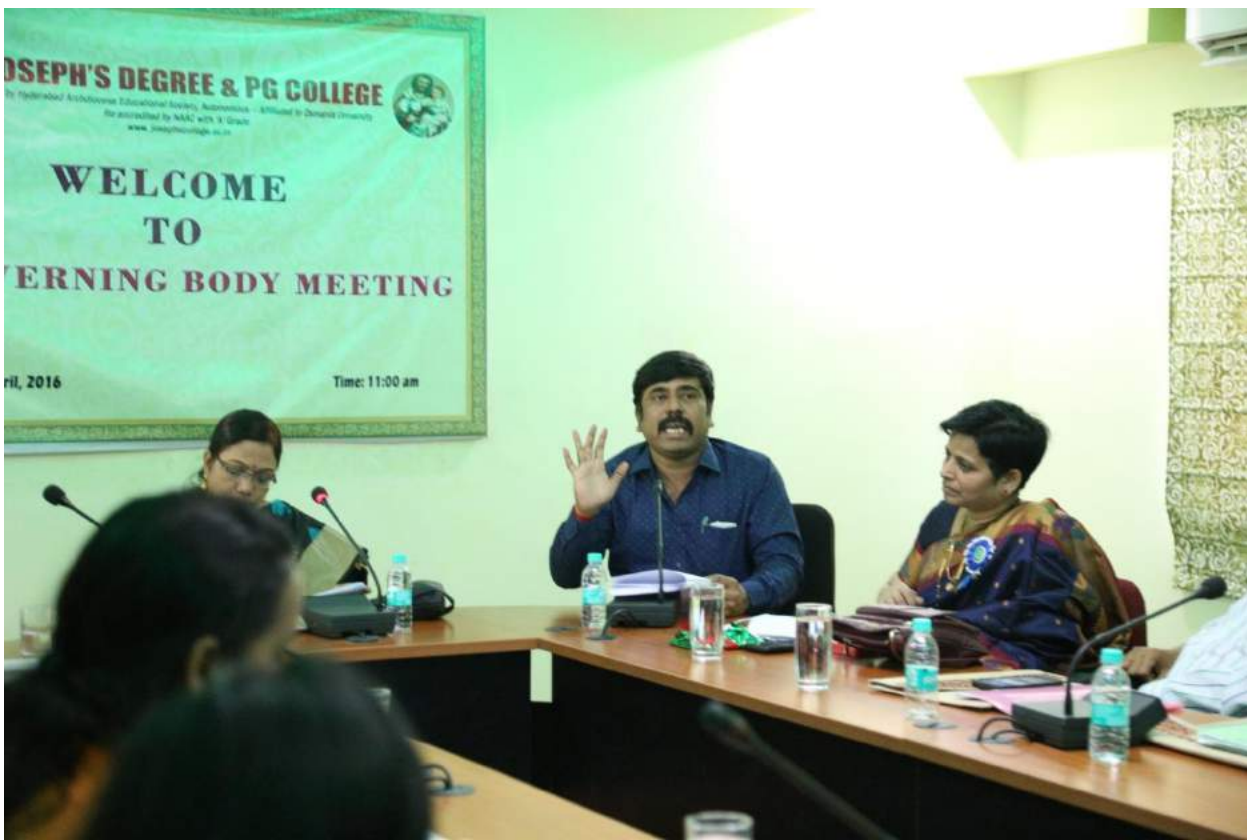
Technical Session – English & Mass Communication