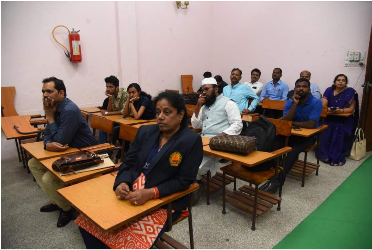
Technical Session – Indian Languages