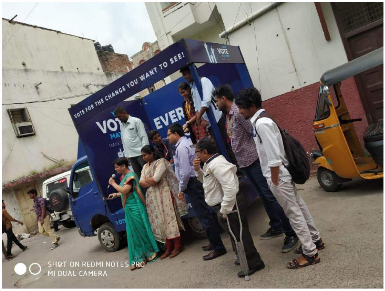
SHOT ON REDMI NOTES PRO MI DUAL CAMERA