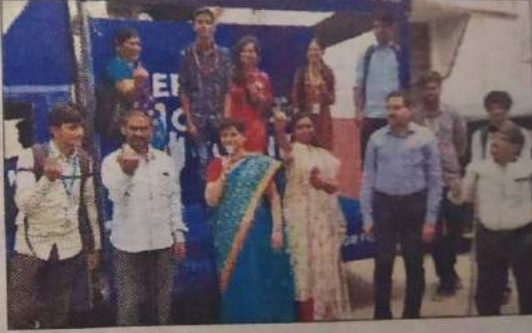
ఓటరు నమోదుపై అవగాహన కల్పిస్తున్న ఎన్టీసీలు