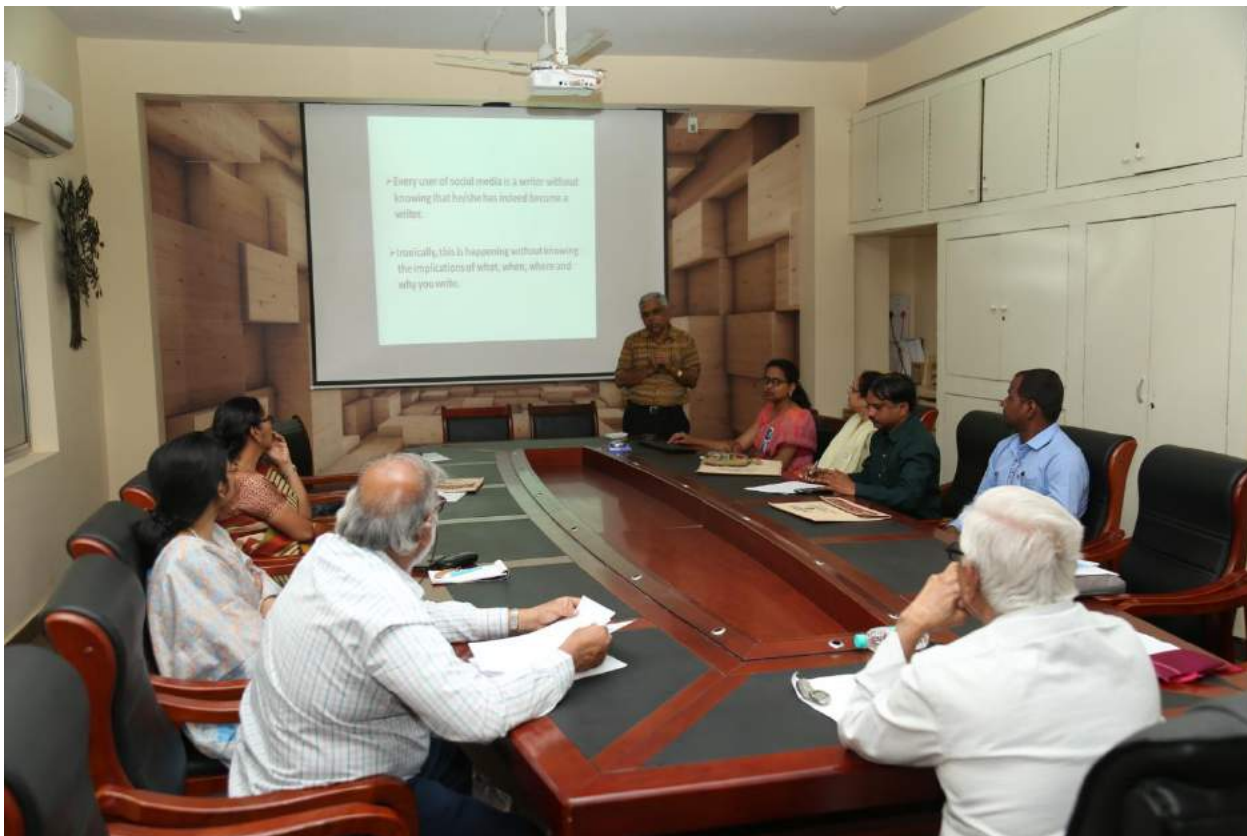
Technical Session – Foreign Languages – Arabic & French