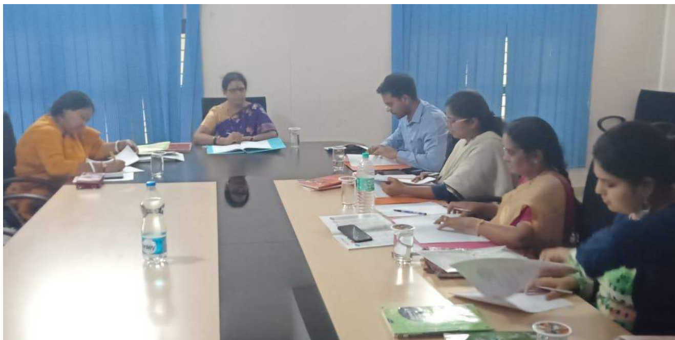
French Board of Studies Meeting at Bhavan's Vivekananda College on 20 April 2019