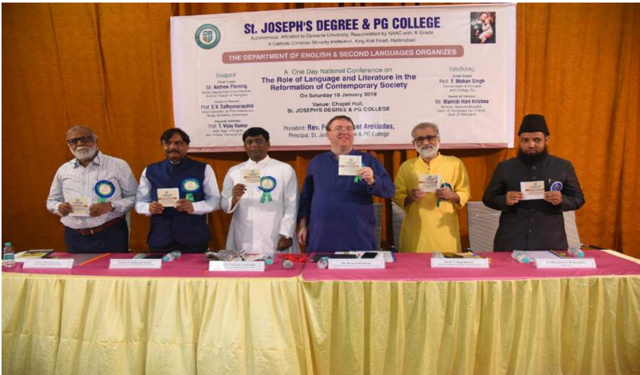
Releasing the CD of One Day National Conference Papers