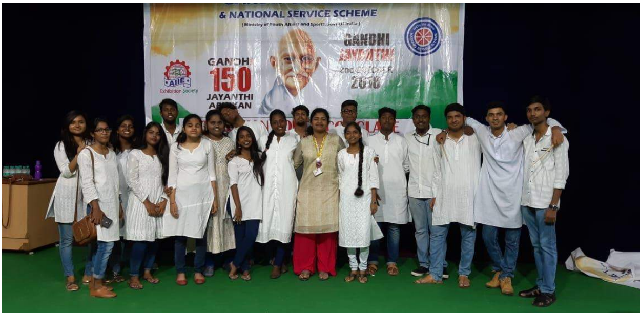
Clean Your Campus Drive Venue-St Joseph's degree and PG College