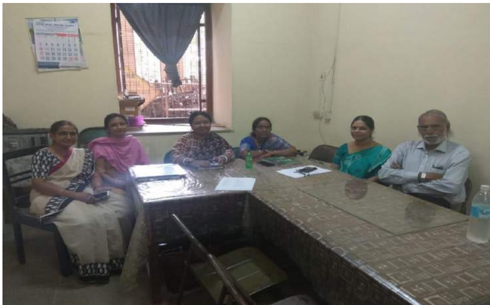
French UG Board of Studies on 29 August 2018, Arts College, Hyderabad