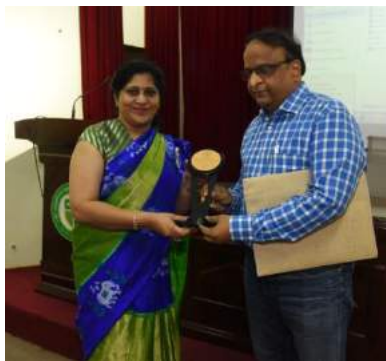
Technical Session – English & Mass Communication