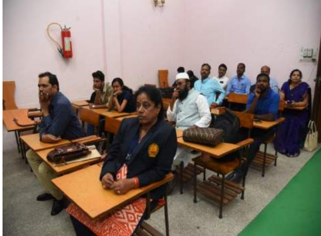
Technical Session – Indian Languages