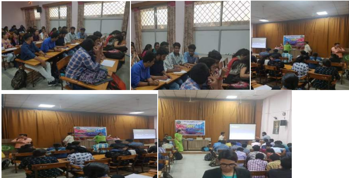
Drama Club in Collaboration with BOSCH performed a Street Play on at INNOX to promote Theater Arts among common people.