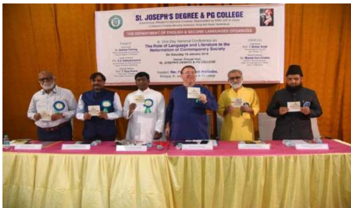
Releasing the CD of One Day National Conference Papers