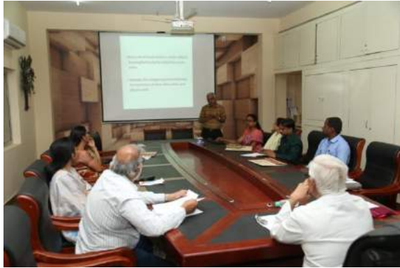
Technical Session – Foreign Languages – Arabic & French