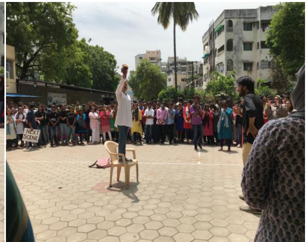
Skit on Anti- Ragging