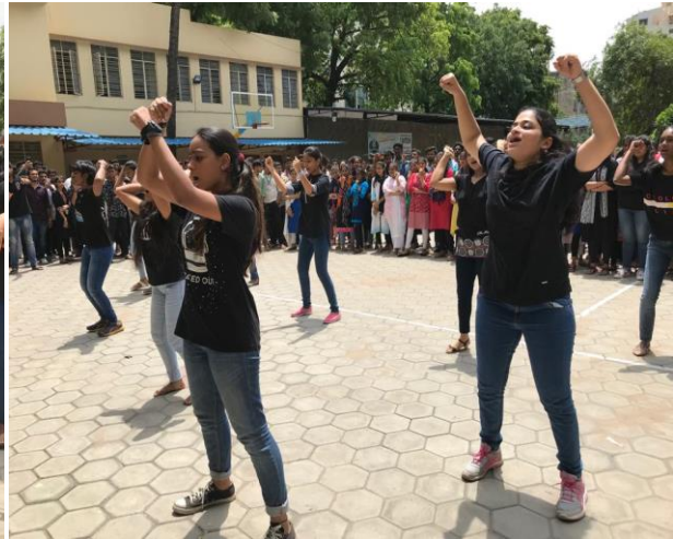
Students Performing Flash Mob