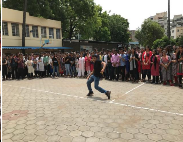
Students Performing Flash Mob