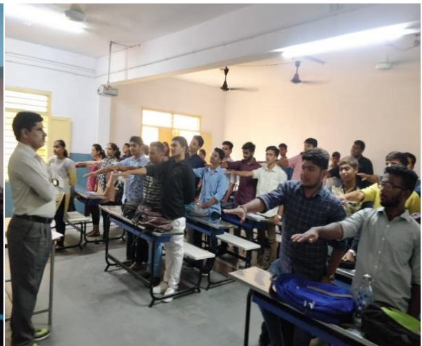
Students taking Pledge