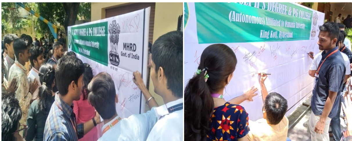
Students signing on Sign up Board