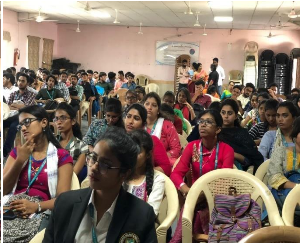
Students attending Guest Lecture on “Ragging”