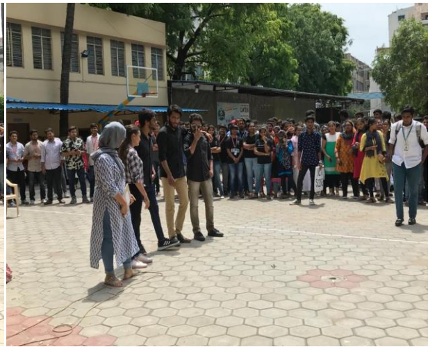
Skit on Anti- Ragging