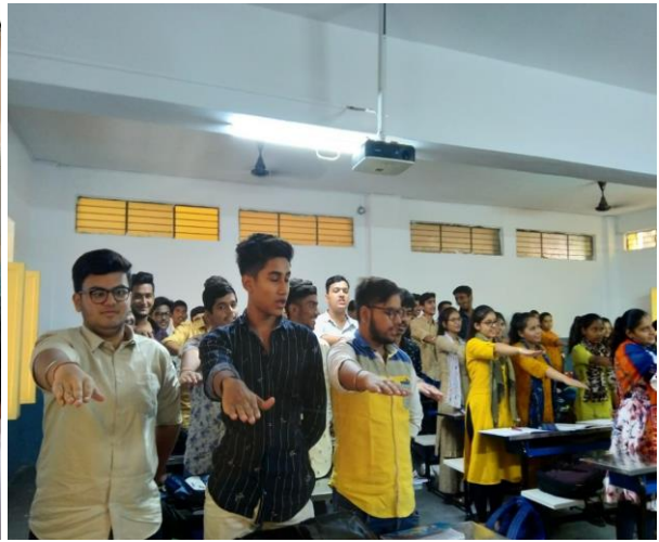
Administering the Pledge on College Radio