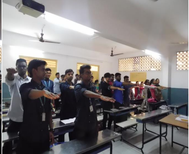
Students taking Pledge