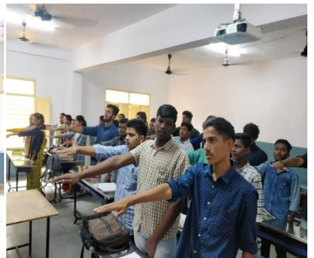
Students taking Pledge