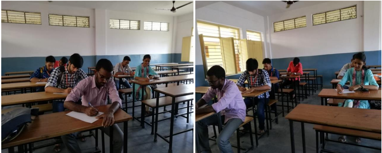
“Slogan Writing” Competition