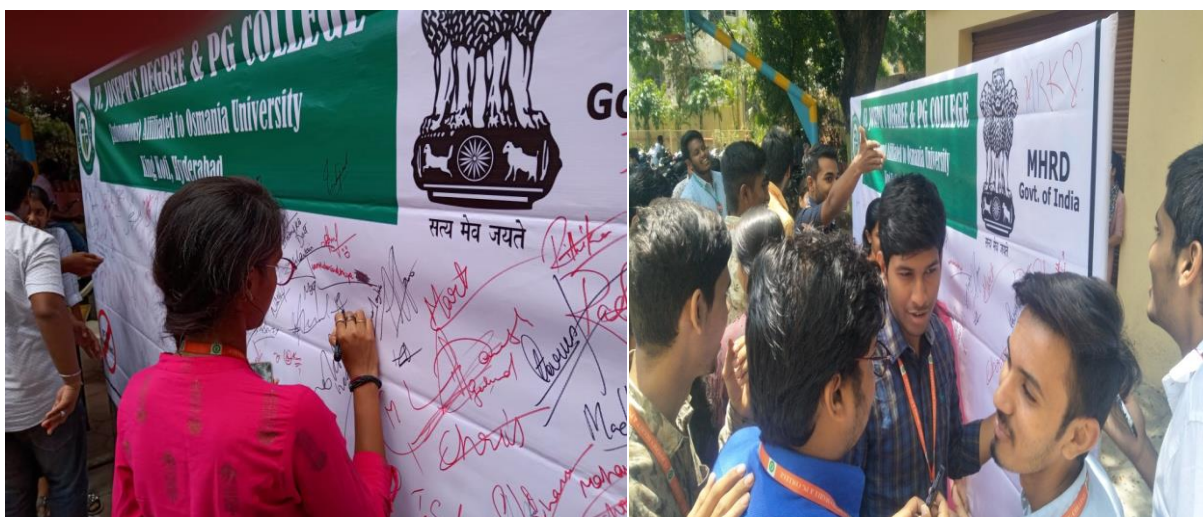
Students signing on Sign up Board