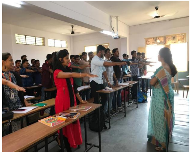
Students taking Pledge