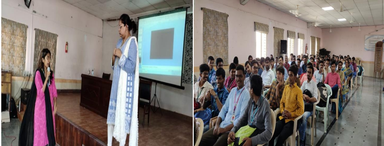
Queries by Students