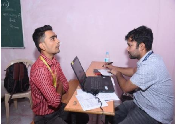
Students attending Interviews