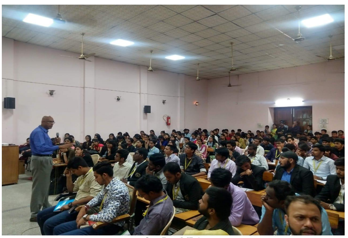
One Day MBA