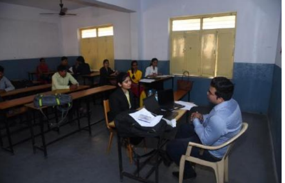
Students attending Interviews