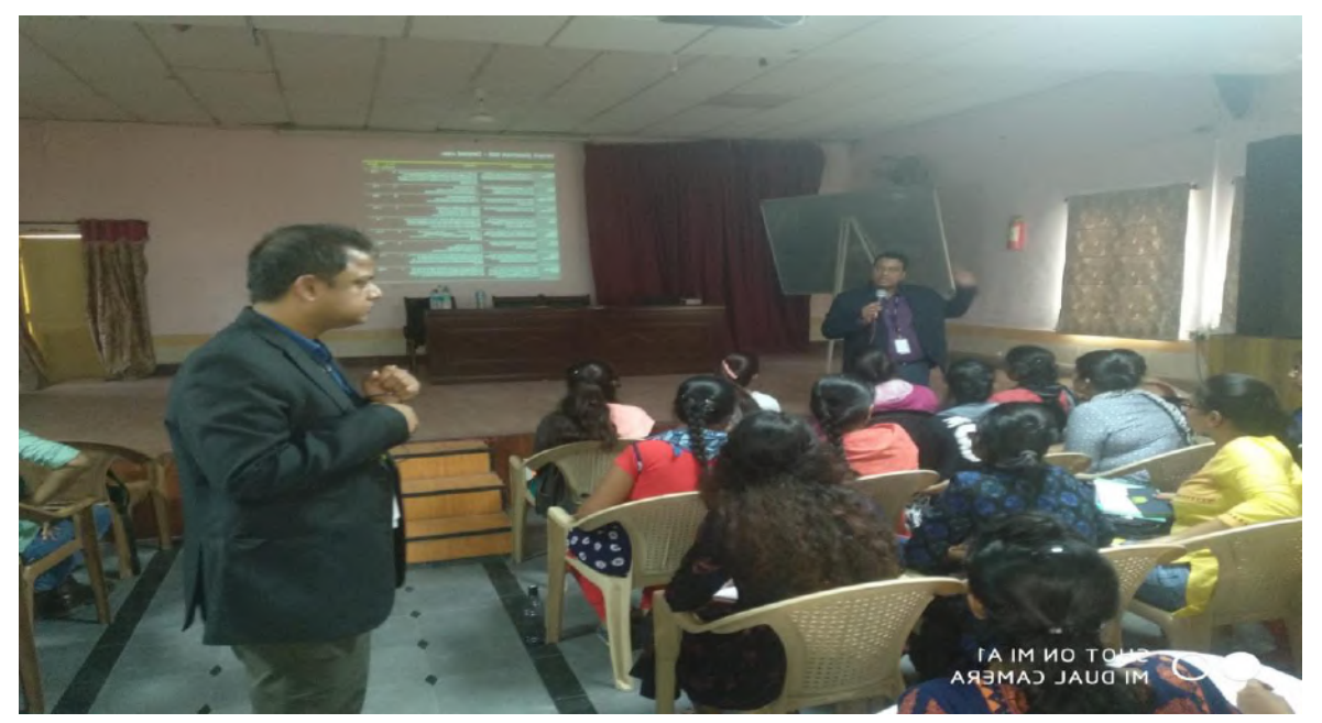
Deloitte Branding Session