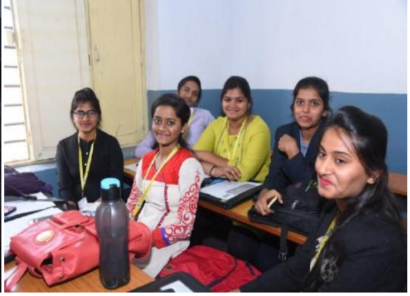
Students attending Interviews