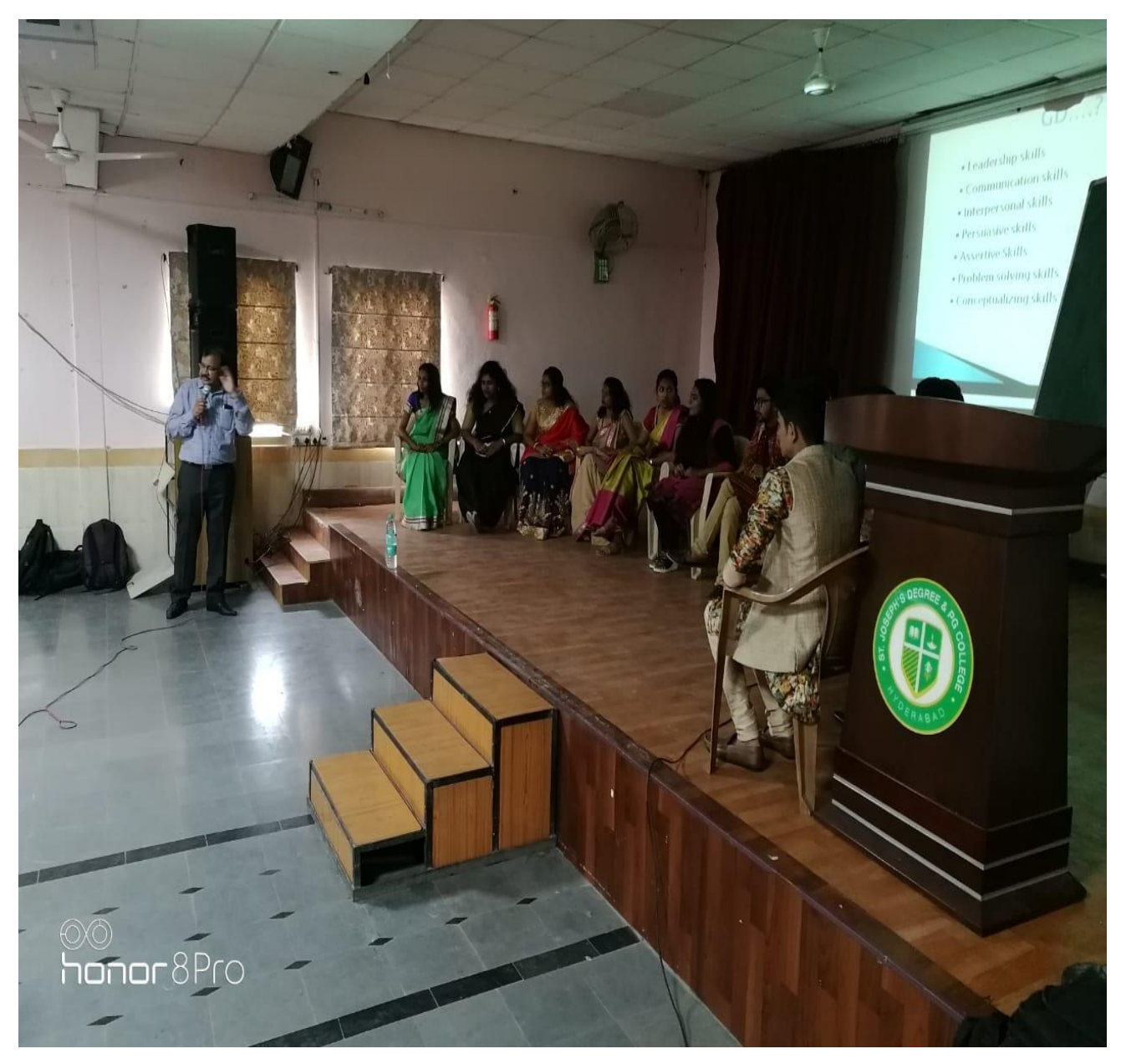
Mock GD Session - Campus to Corporate workshop