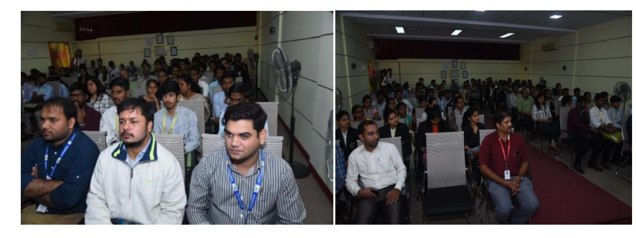
HR Managers interacting with Audience