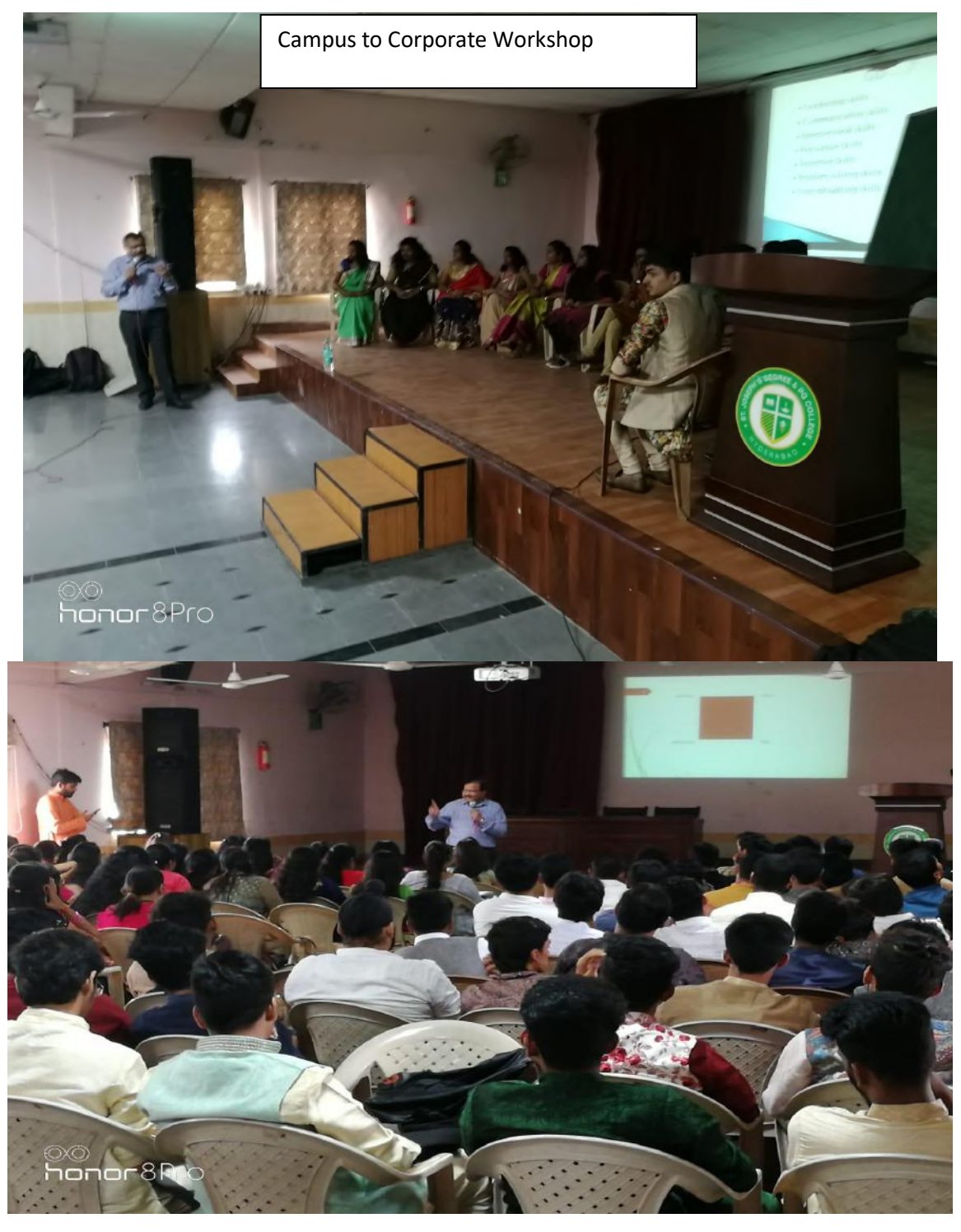
Campus to Corporate Workshop