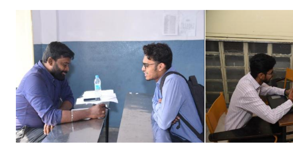
Students attending Interviews