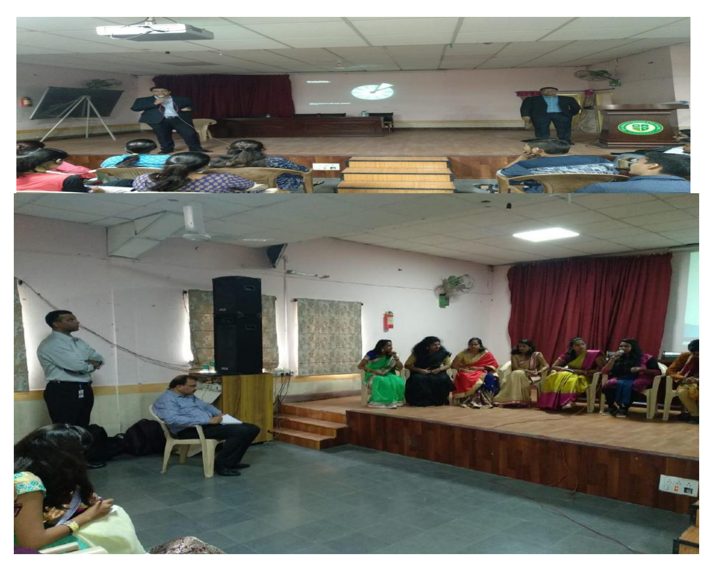
Deloitte Audit Pre Placement Talk