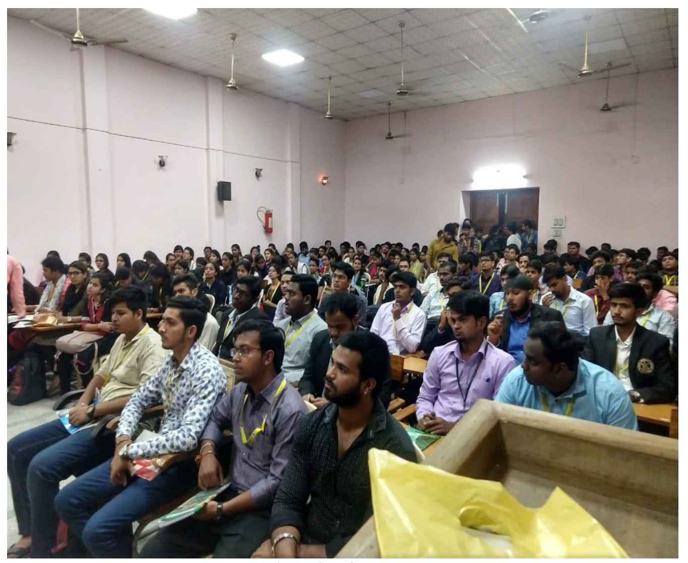
Orientation for NMAT