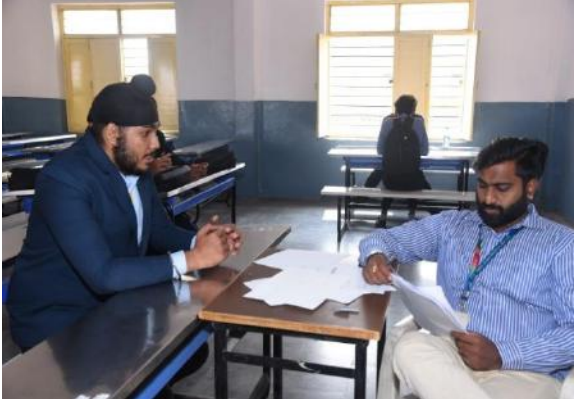
Students attending Interviews