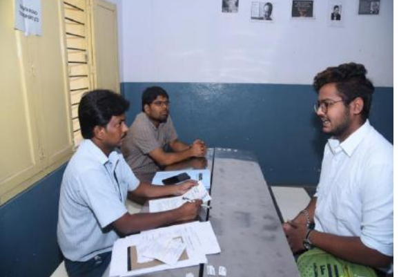
Students attending Interviews