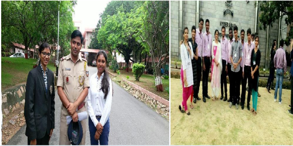
BBA STUDENTS WITH IPS OFFICER AT NATIONAL POLICE ACADEMY

College in order to bring awareness regarding IPS services and contribution in the society, conducted visit to Sardar Vallabh Bhai Patel National Police academy on September 26, where BBA students also participated and interacted with the top brass of our Country.