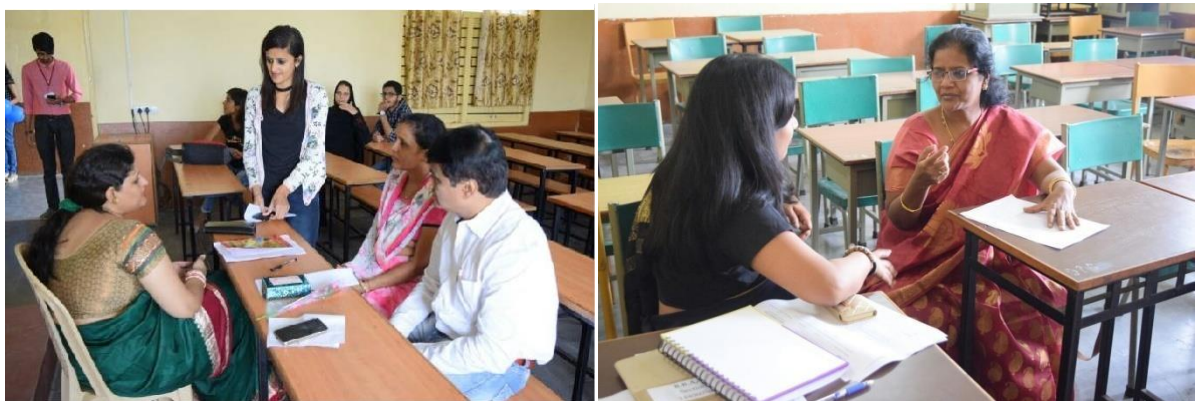
BBA III A & B class teachers interacting with the parents