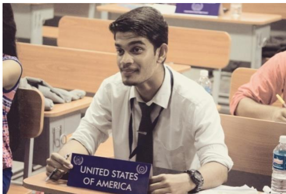
UoH MUN- As Delegate of USA at UOH