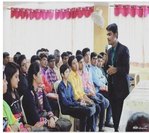
Orientation for BBA (IT) I Yrs