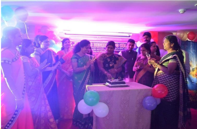
Teachers celebrating the day

Target Group: - Faculty Members, Students of BBA, BBA IT, MBA