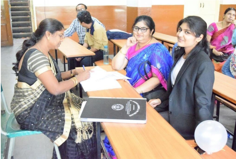
BBA (IT) II YR