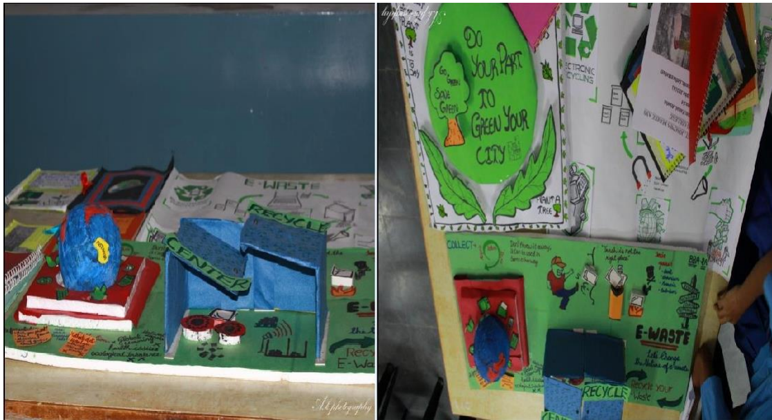
E-WASTE MODEL(BBA II A )