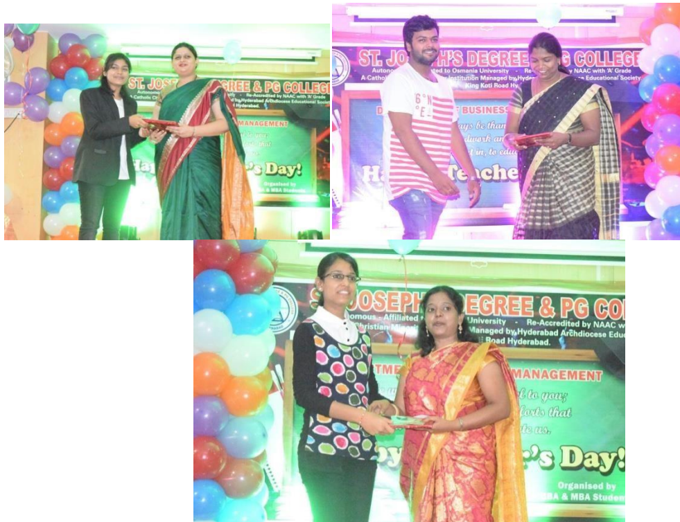
TEACHERS FELICITATION AT THE EVENT