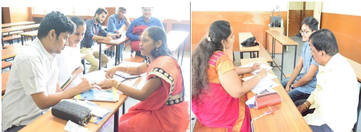
BBA II A & B class teachers interacting with the parents