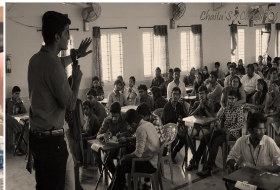
Quiz Master-IT Quiz at main campus