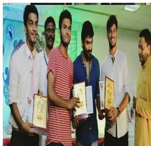
TREASURE HUNT 1 st PRIZE WITH WINNER JAM (Literary)