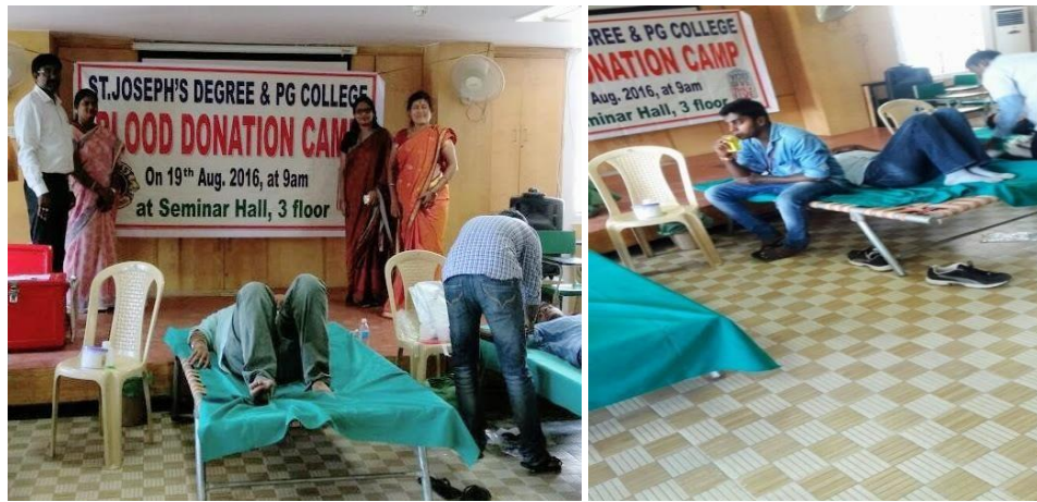
BBA & BBA IT students donating blood at the blood donation camp