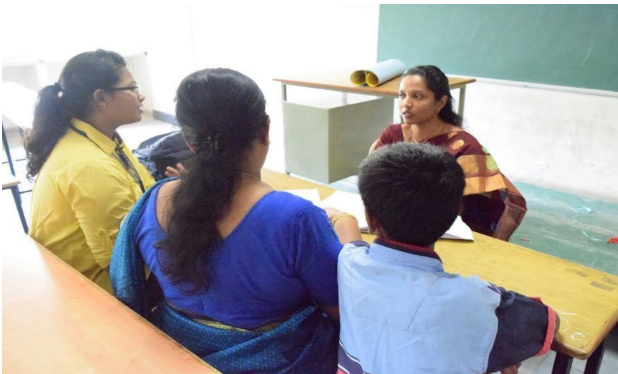
BBA (IT) I YR