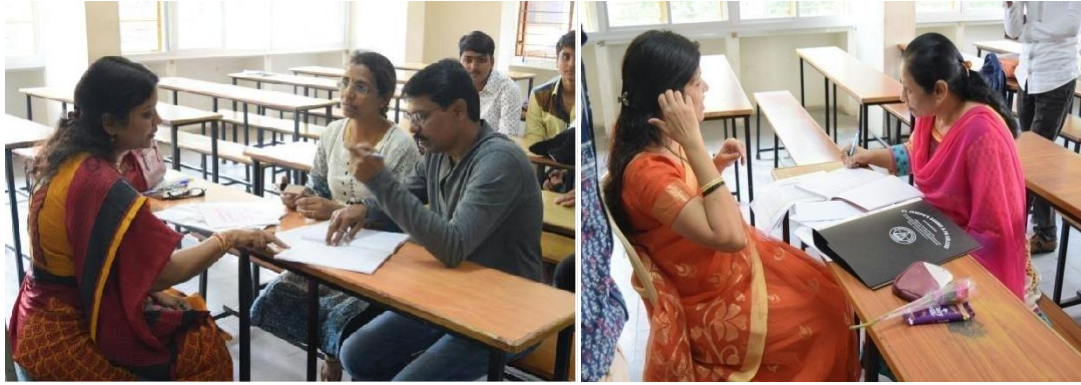
BBA I A & B Class teachers interacting with the Parents