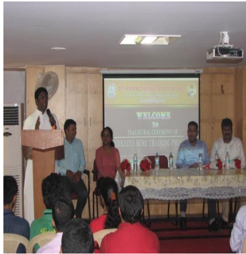
FATHER ADDRESSING THE STUDENTS