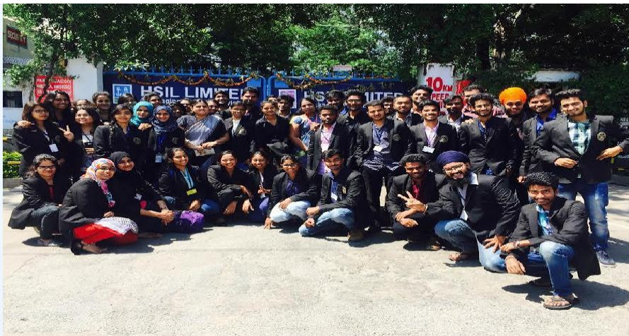
BBA III YEAR SEM V, SECTION “A” STUDENTS AT THE INDUSTRY

Our customer base comprises host of Multinational companies, large Indian companies, as well as customers in North America, Europe, Africa as well as APAC regions.