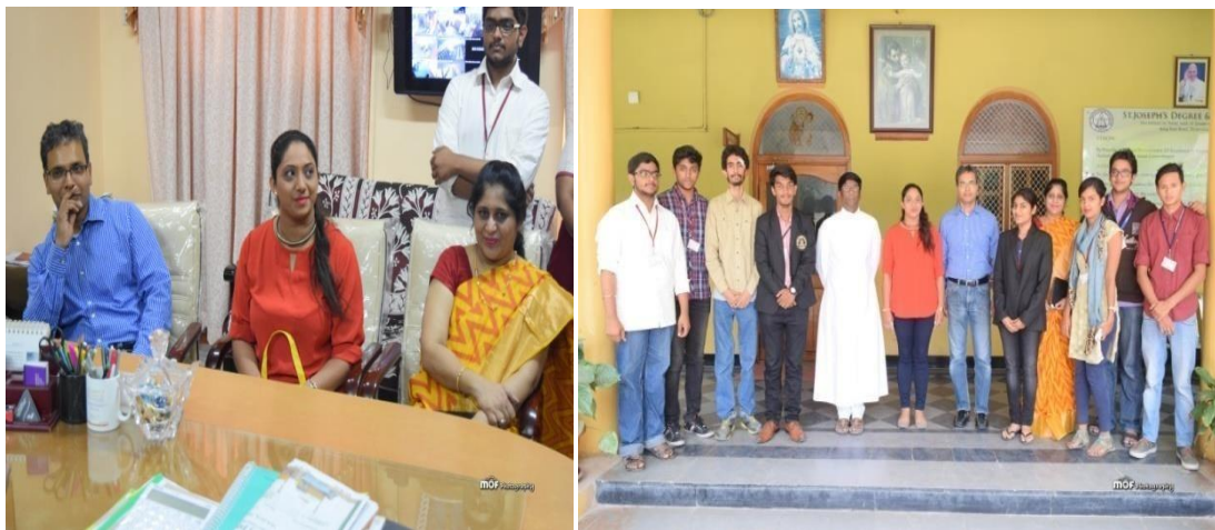
Students achieved cash prizes -INDIANFOLK – ONLINE ARTICLE WRITING COMPETITION