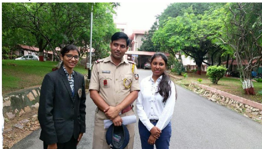
BBA Students with IPS officer at National Police Academy

September 26, where BBA students also participated and interacted with the top brass of our Country.