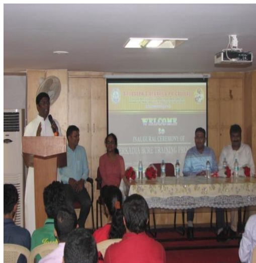
FATHER ADDRESSING THE STUDENTS