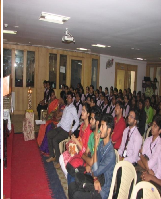
UG & PG STUDENTS