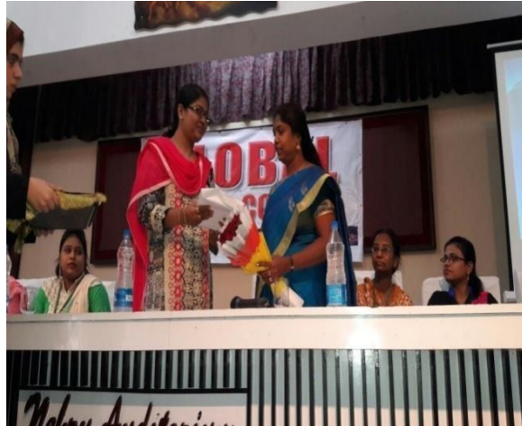
FELICITATION BY THE PRINCIPAL OF GLOBAL JUNIOR