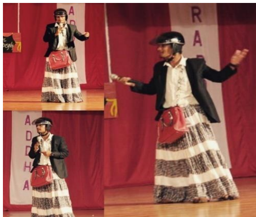
Stress Interview Final Round- Best Manager, Recroi, St. Francis College, Begumpet, Hyd.