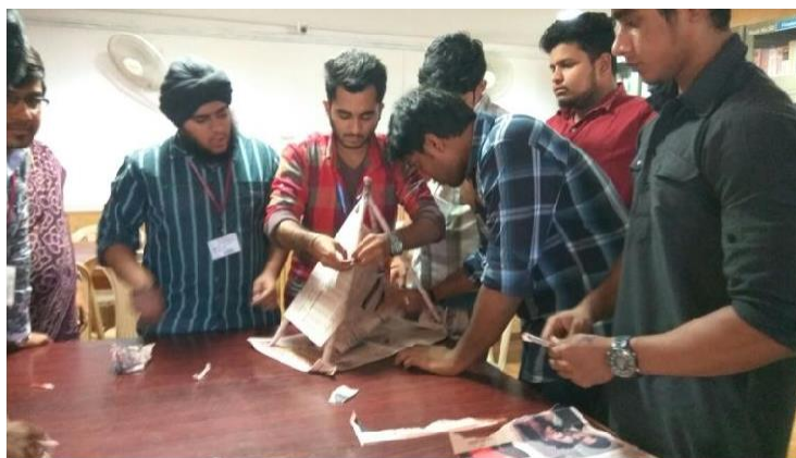
BBA STUDENTS TAKING PART IN MANAGEMENT CLUB ACTIVITY.