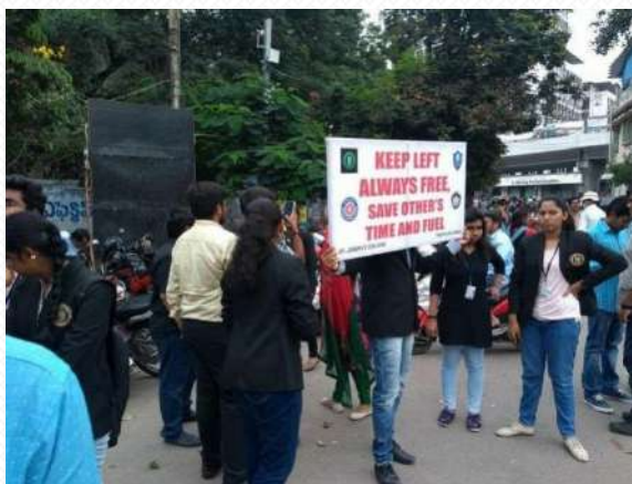
BBA Students in NSS Rally

BBA & BBA IT students were part of the NSS conducted by the St,Joseph's Degree & PG College and made people aware of the traffic rules and regulations at Basheerbagh