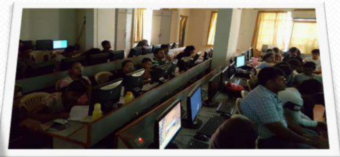
LAB SESSIONS CONDUCTED BY THE RESOURCE PERSON – MR.YOGENDER