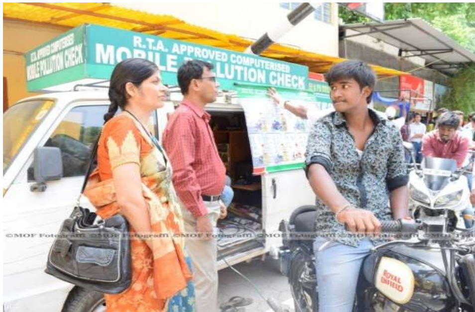
FACULTY MEMBERS & STUDENTS GETTING A POLLUTION CHECK DONE FOR THEIR VEHICLES