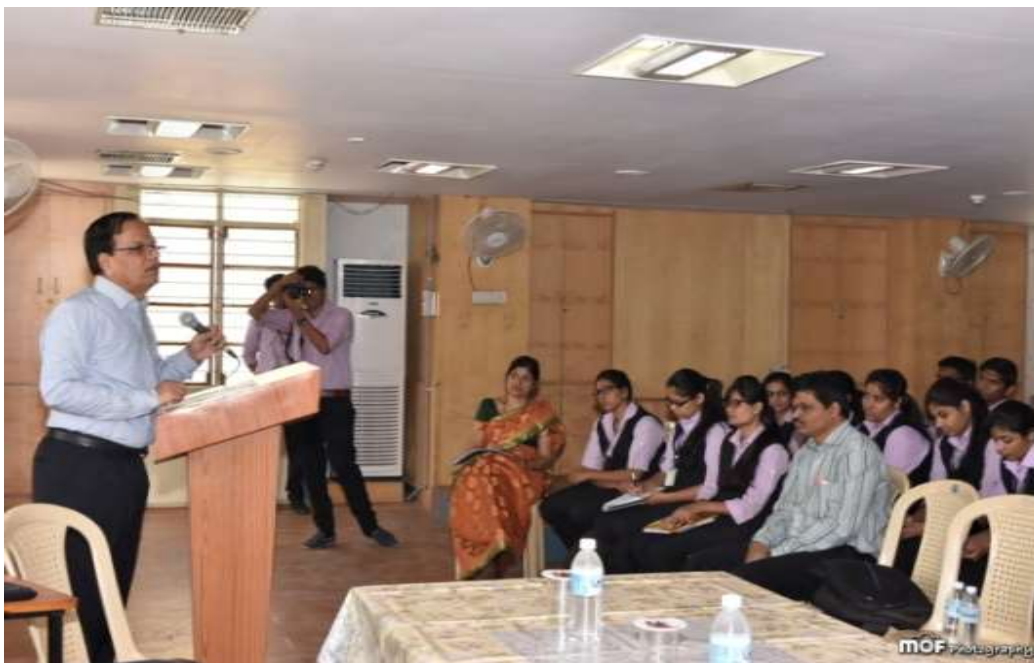
THE GUEST SPEAKER GIVING A GUEST LECTURE ON "ENVIRONMENTAL AWARENESS"