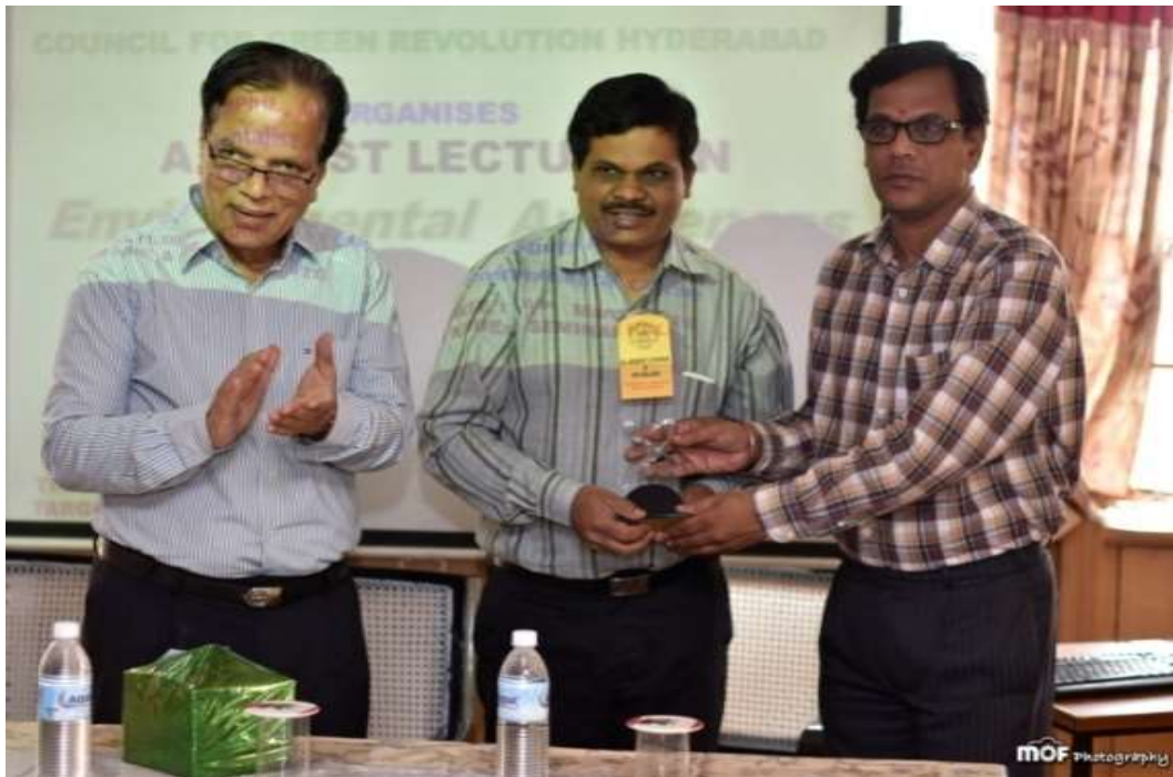
FELICITATION OF THE GUEST SPEAKER