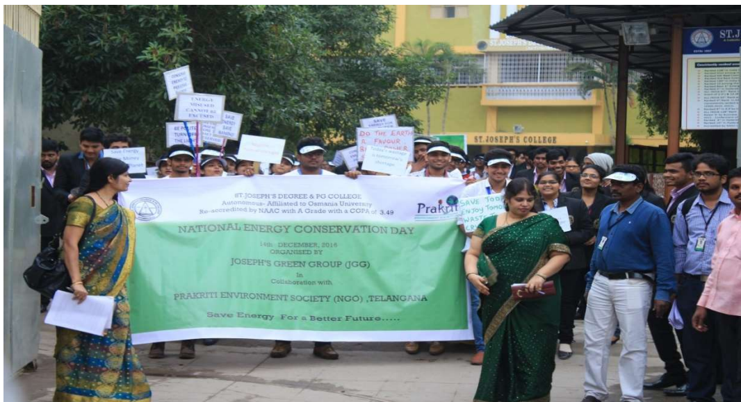
JGG FACULTY COORDINATORS AND STUDENTS PARTICIPATE IN THE ENERGY CONSERVATION DAY RALLY