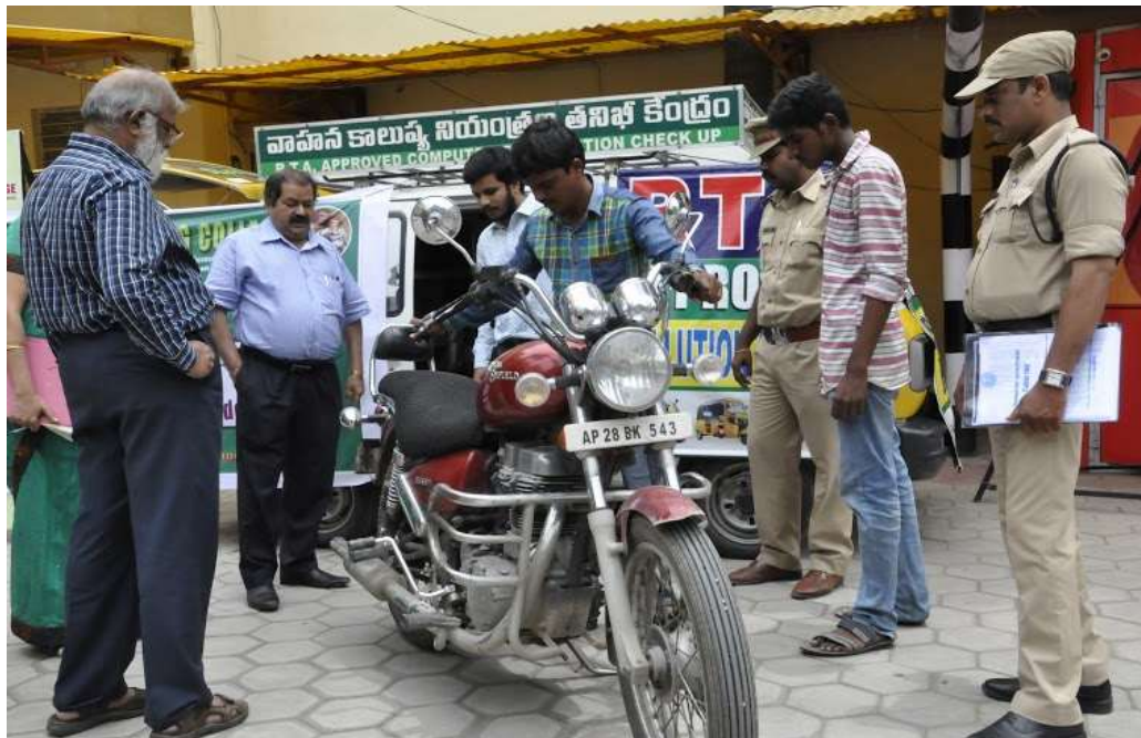
POLLUTION CHECK FOR VEHICLES