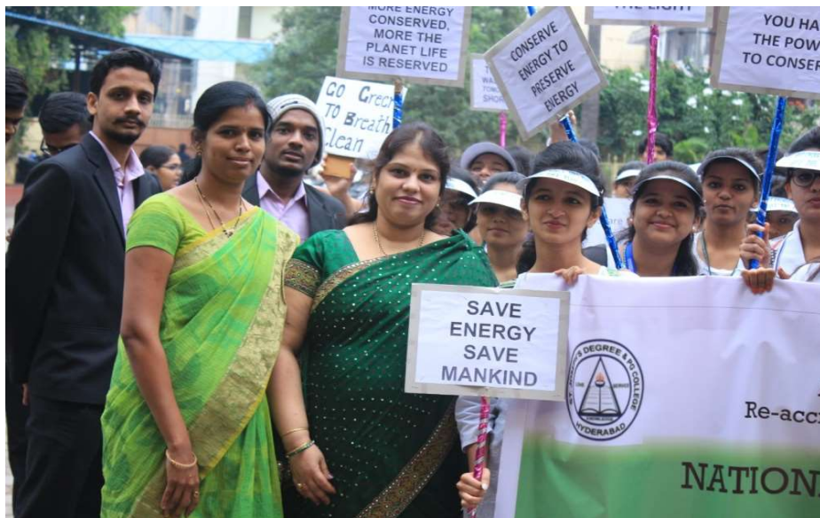
JGG FACULTY COORDINATORS AND STUDENTS WITH PLACARDS IN THEIR HANDS PARTICIPATE IN THE ENERGY CONSERVATION DAY RALLY