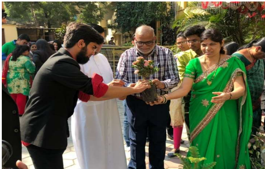
FACULTY MEMBERS PLANT THE SAPLINGS ON THE INTERNATIONAL PLANTATION DAY