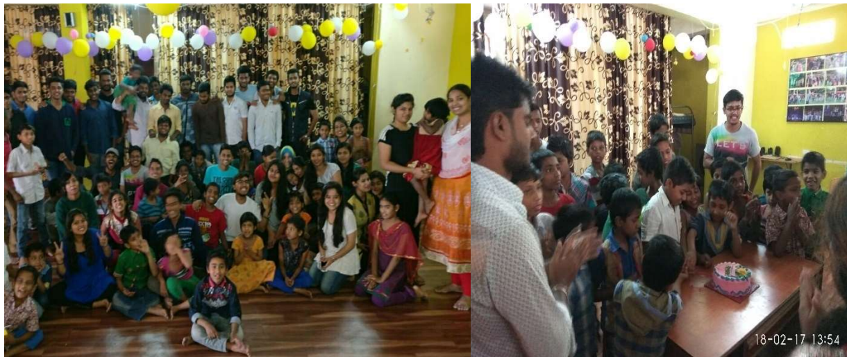
BBA-II 'B' STUDENTS WITH INMATES OF CELEBRATING AMA ODI ORPHANAGE