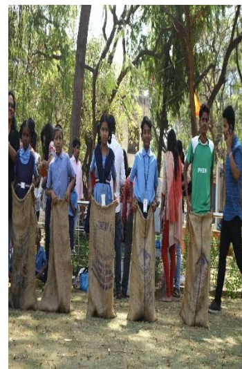
CHILDREN INTERACTING WITH BBA II(A) STUDENTS AND ENJOYING SACK RACE COMPETITION