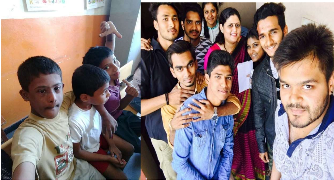
BBA III B STUDENTS AT SADHANA INSTITUTE ,NACHARAM