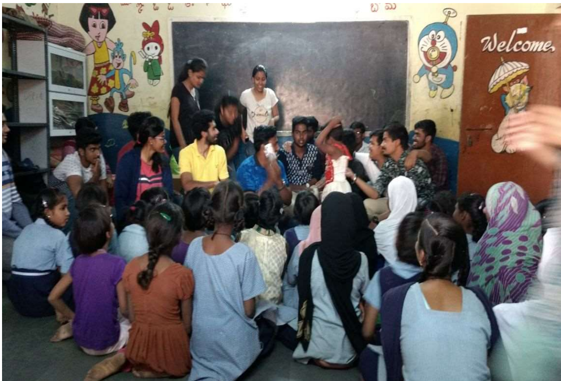
Rainbow home, orphanage for girls

There were 40 Orphans to whom our students donated rice, toor dal, udad dhal, sugar, idli rawa, tooth paste along with brushes, oil boxes, coconut oil, soaps, scrubbers, powder etc and a cash of Rs.6,000/-which are recommended by them. We spent most memorable time from 8.30 am to 12.30 pm with them.