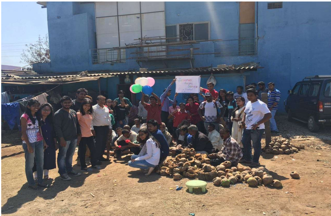
The Friends of the birds of the air