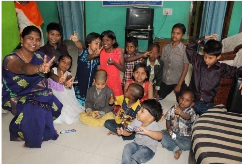
THEY WERE HAPPY TO RECEIVE CHOCOLATES