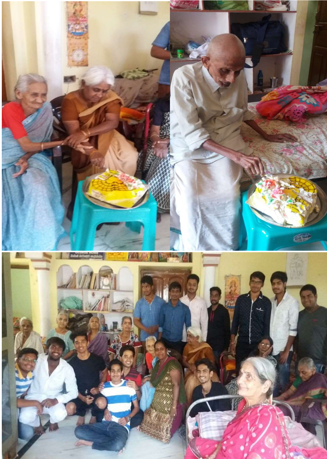
Mamta Old Age Home visited by B.Com II A