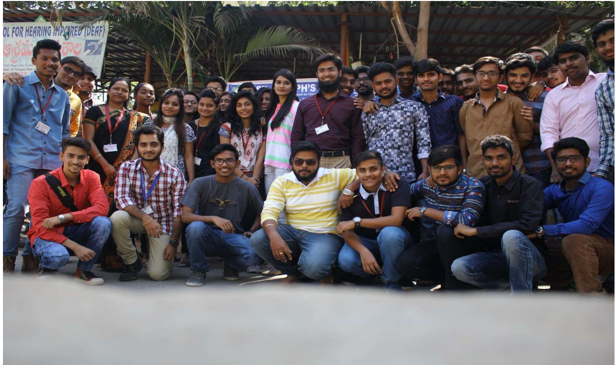
BBA II (A) CLASS