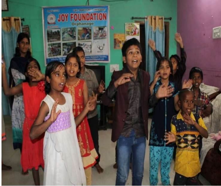
THE ORPHANAGE CHILDREN ALSO SHARED THEIR JOY BY SINGING ACTION SONGS