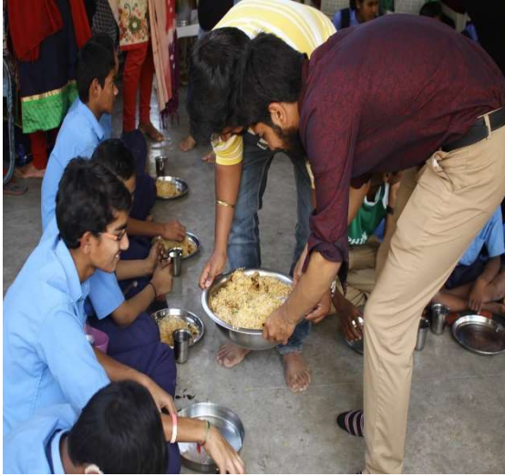
CHILDREN ENJOYING VEGETABLE BIRYANI AND ICE GOLA