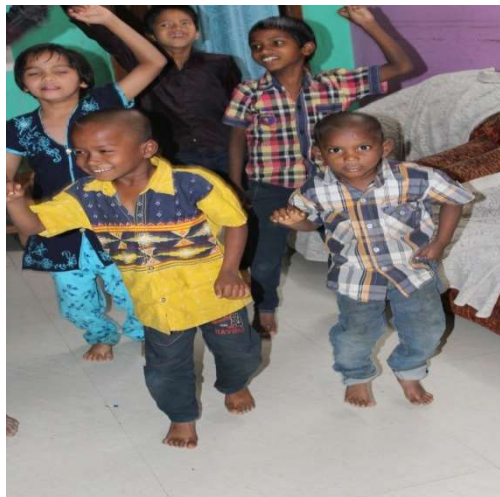
PRAYER SONG BY STUDENTS