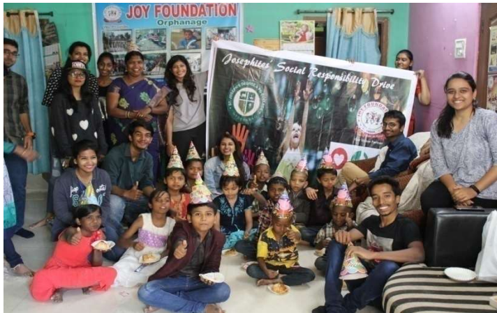
BBA (IT) II YRS