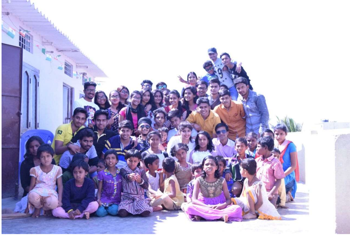
Arunodaya Trust Yapral.