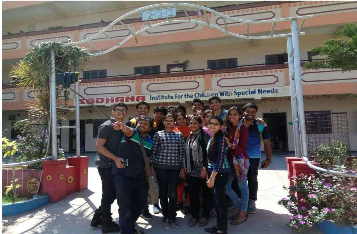
Sadhana Institute for children with special needs, Nacharam, Hyderabad.