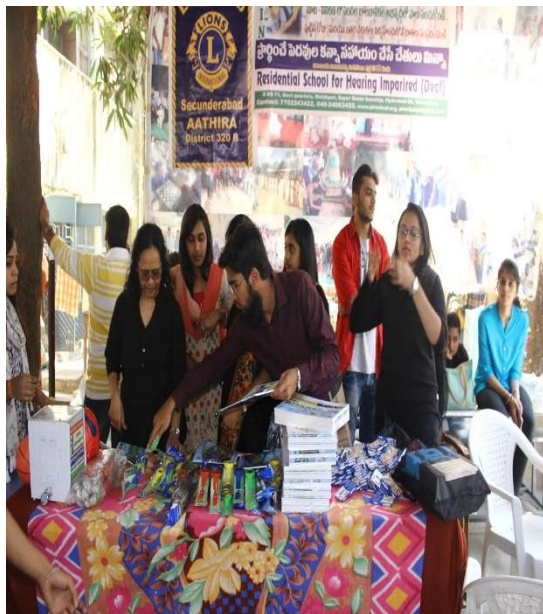
DISRTIBUTION OF ARTICLES