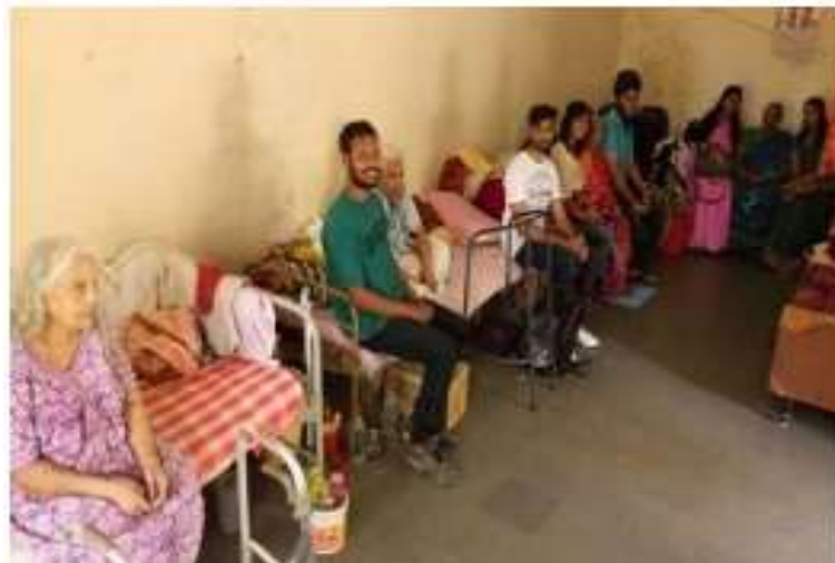
Students with Old people

Feedback from the Students about the visit- There was a very positive feedback from the students who have participated enthusiastically in the above programme. The opinion that the elderly citizens should be given due respect because they contributed to the society/country in their prime youth by working at various government and non-government entities be it private firms or own business entities. Some of the students are of the opinion that the inmates should have saved money for retirement so that the life would have been better. Many expressed the view that elderly citizens should be regularly visited by their children and keep the emotional perspective in good. Overall a very satisfying feedback from the students.