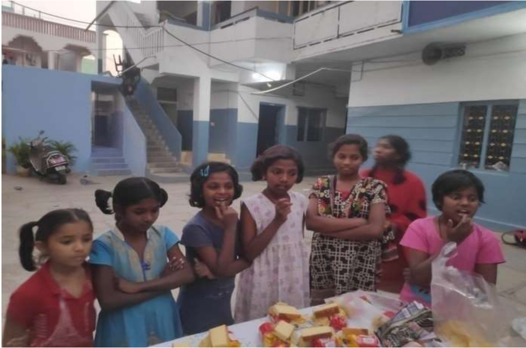
The Girls of the Orphanage happy for the time spent