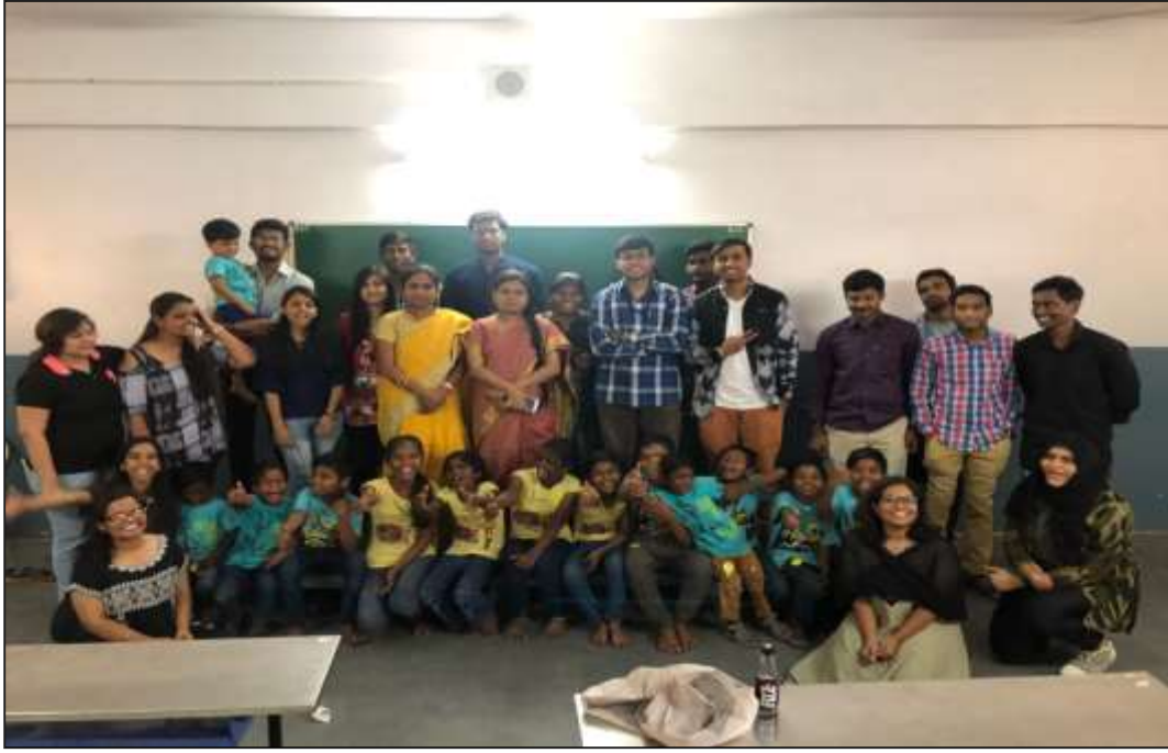
MBA II B students with the orphanage children