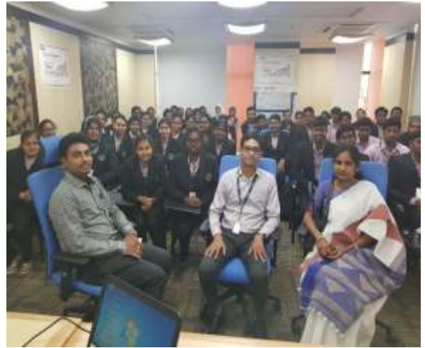
Students and Faculty picture with the guest speaker