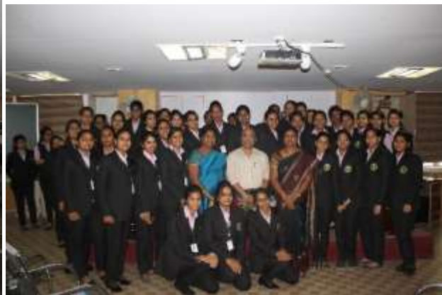
STUDENTS OF MBA I YR WITH THE GUEST