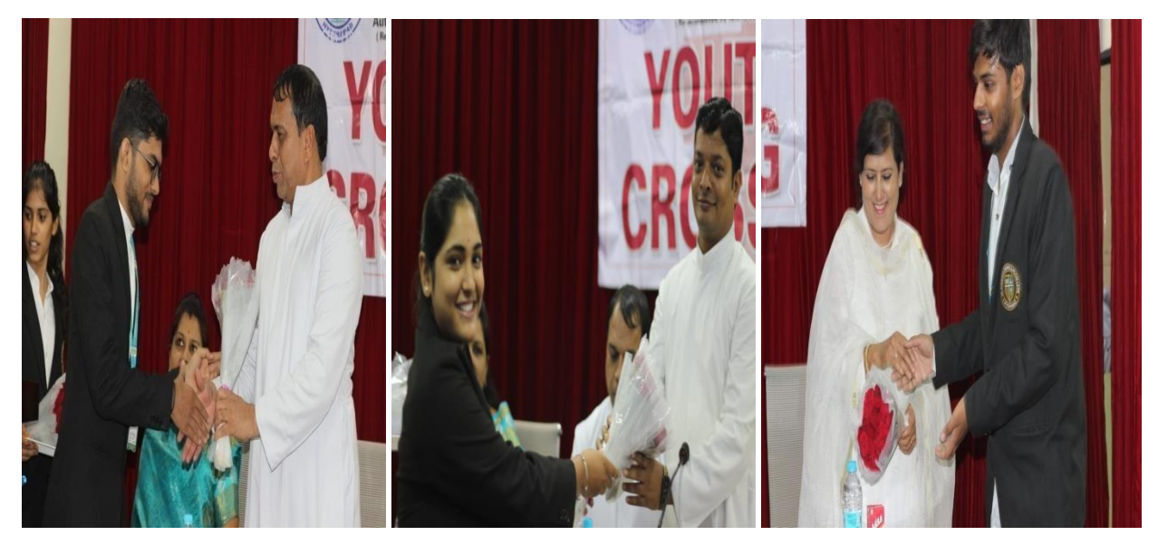
Welcoming of Dignitaries