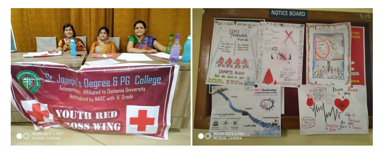
Faculty Coordinators and Judge of Poster Making Competition