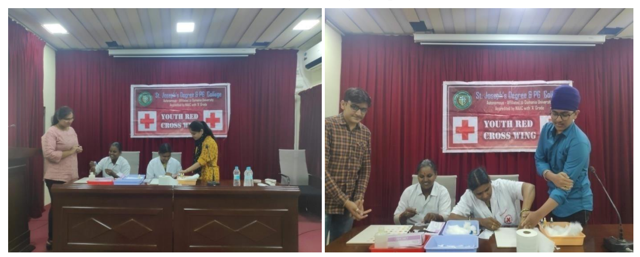
Blood Screening Camp