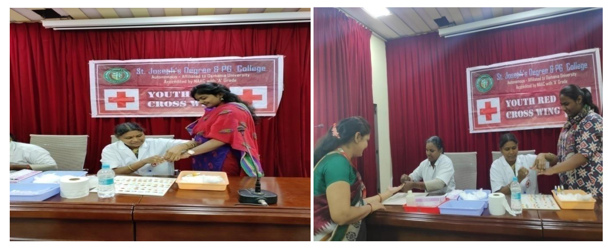
Faculty participating in Blood Screening Camp