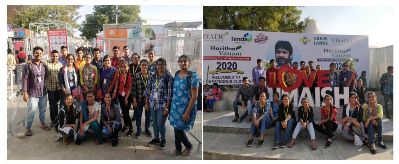
Students at Swach Numaish Program