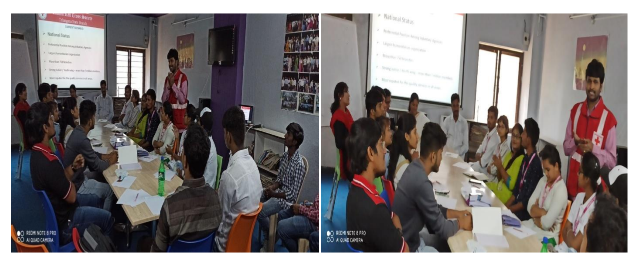
First aid Training Program