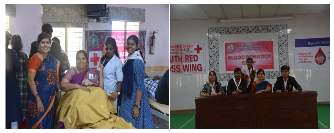
Faculty donating Blood