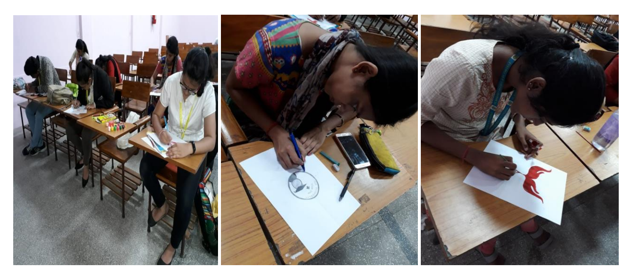
Logo Making Competition