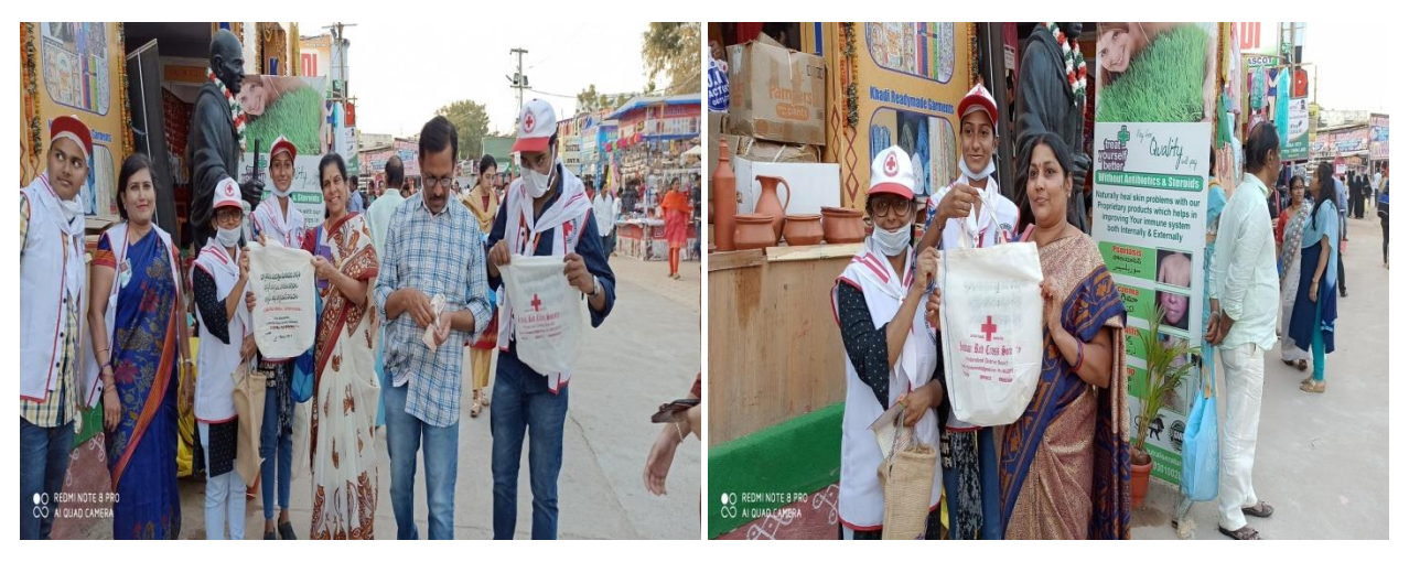
Students promoting use of Cotton & Jute Bags