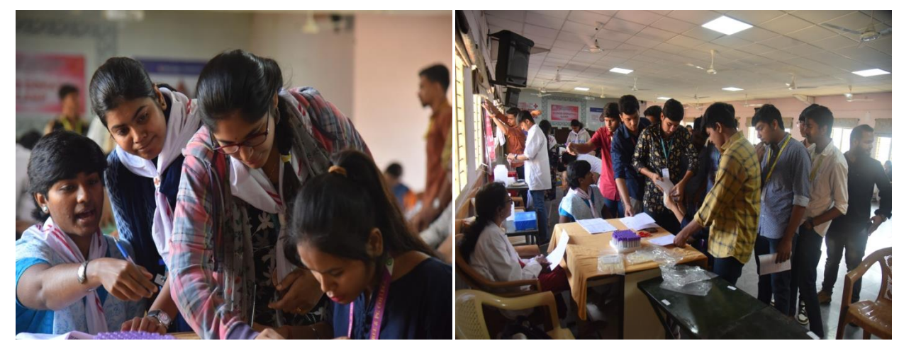
Students registering for Blood Donation Camp