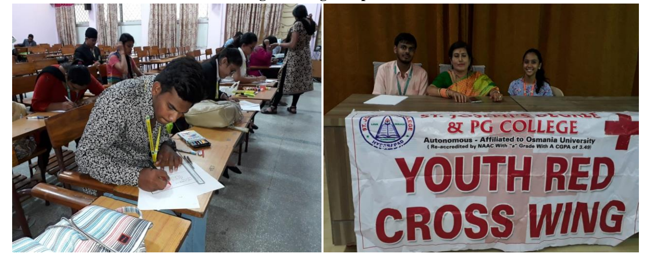
Logo Making Competition