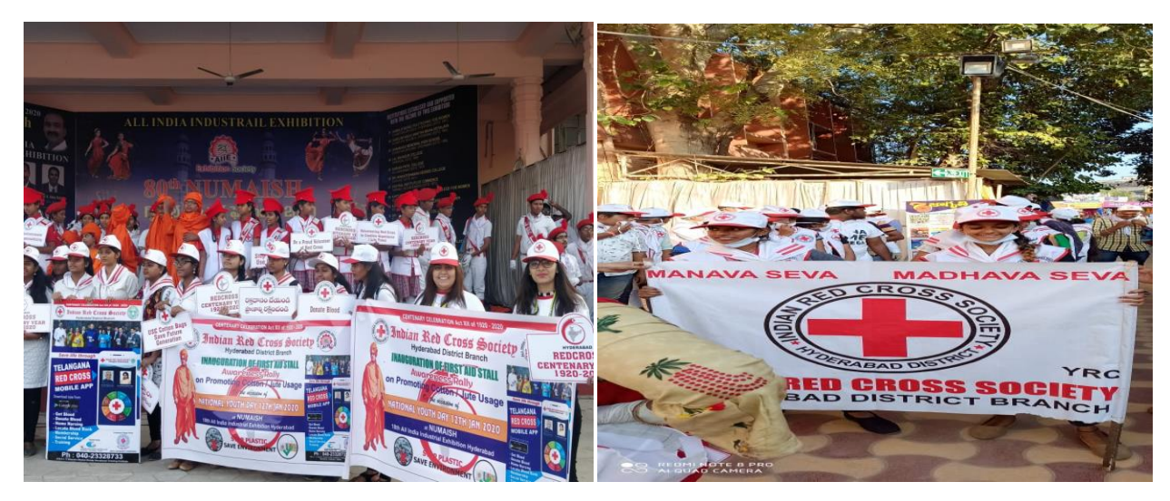
Students participating in Awareness Rally