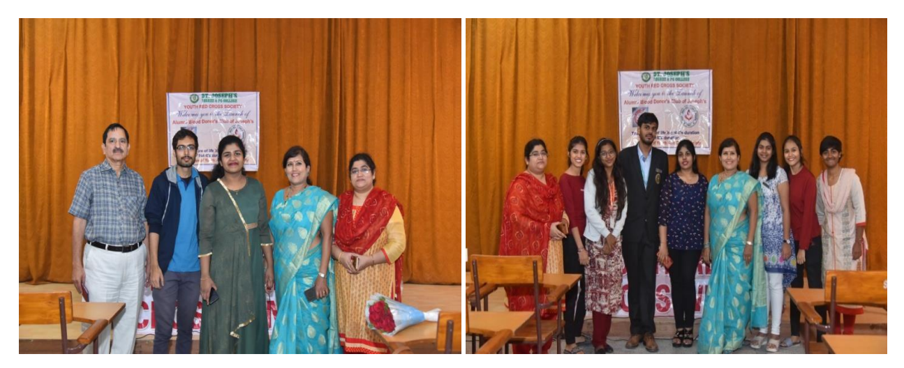
Chief Guest with Alumni