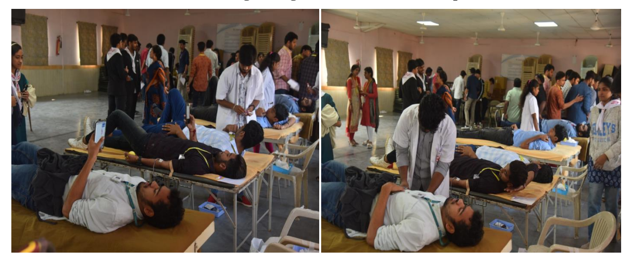
Students donating Blood