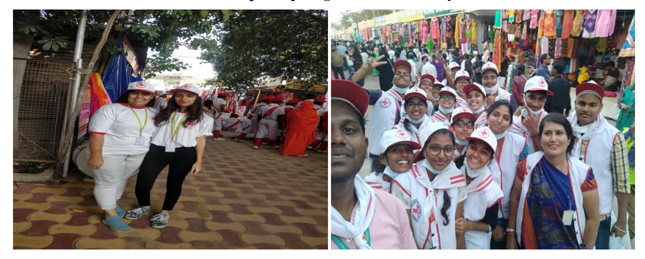
Students participating in Awareness Rally