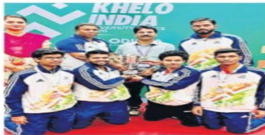
SECOND BEST: Osmania University TT team receiving the runners-up trophy on Sunday.