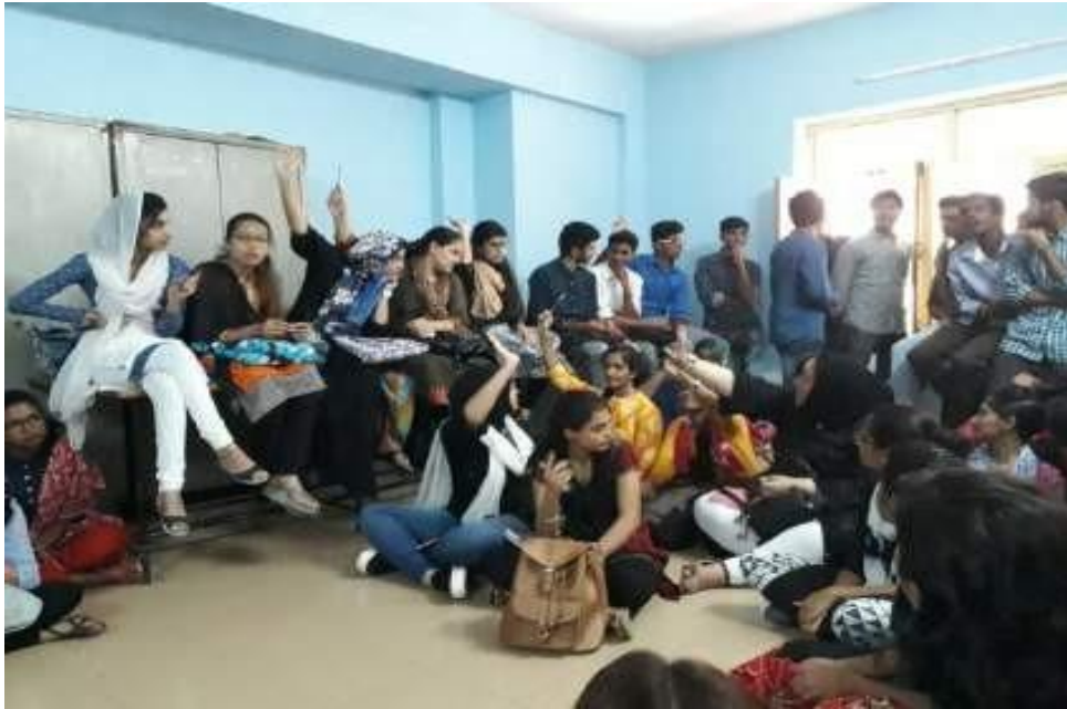
Psyched Club Elections, 4 th July 2017.