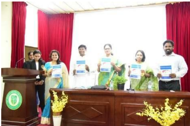
PSYCHED Club Investiture, 25 th , July 2017