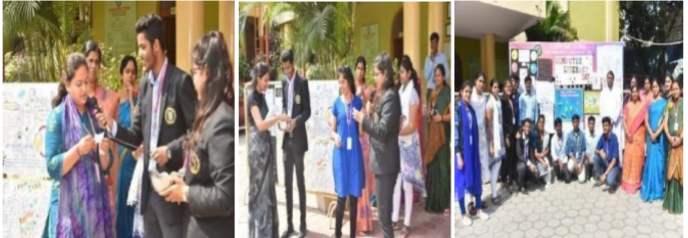
Students participating in the session and faculty giving guidance to students