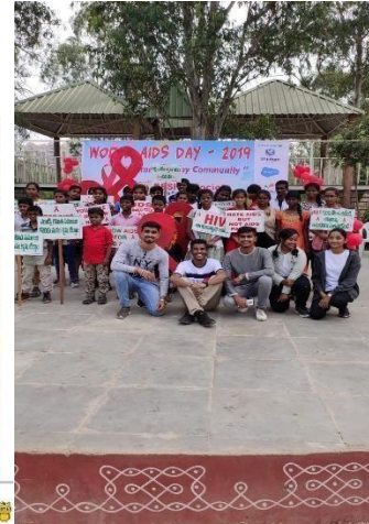
AIDS awareness programme – Josephites expressing solidarity