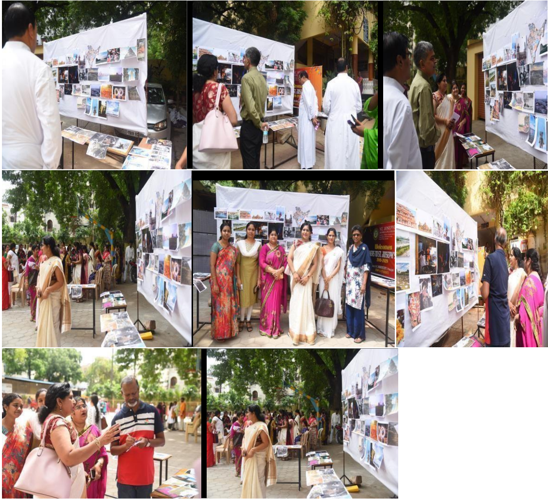
Exhibition - Photography Contest