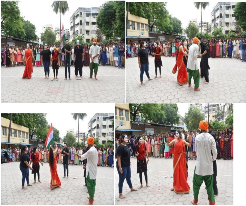
Mime on the theme of National Integration - DRAMA CLUB