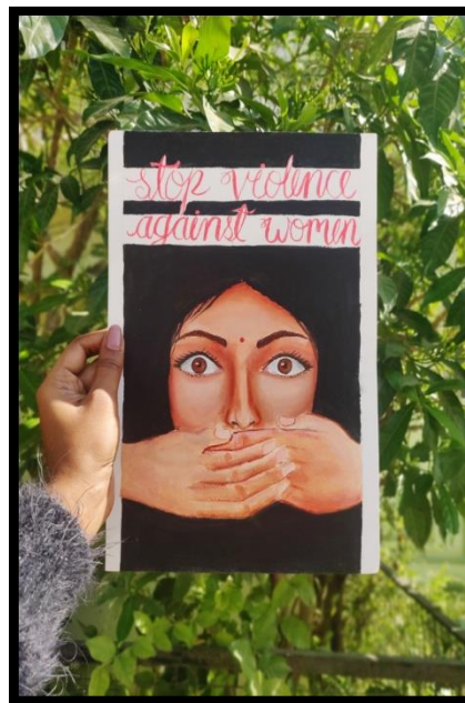
3 rd prize