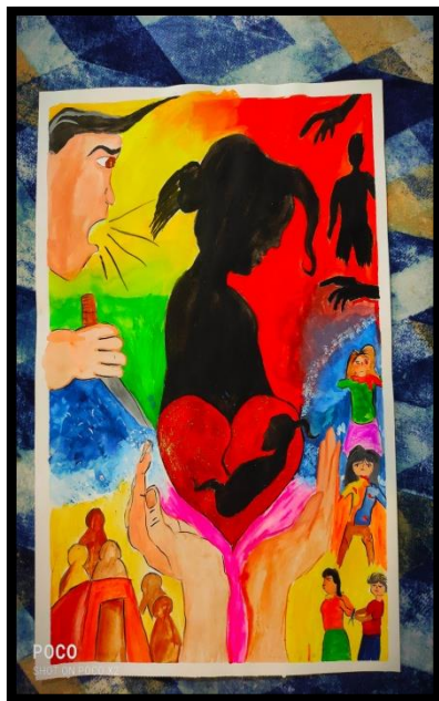
1 st prize