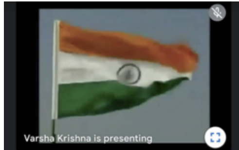
NATIONAL ANTHEM BEING PLAYED