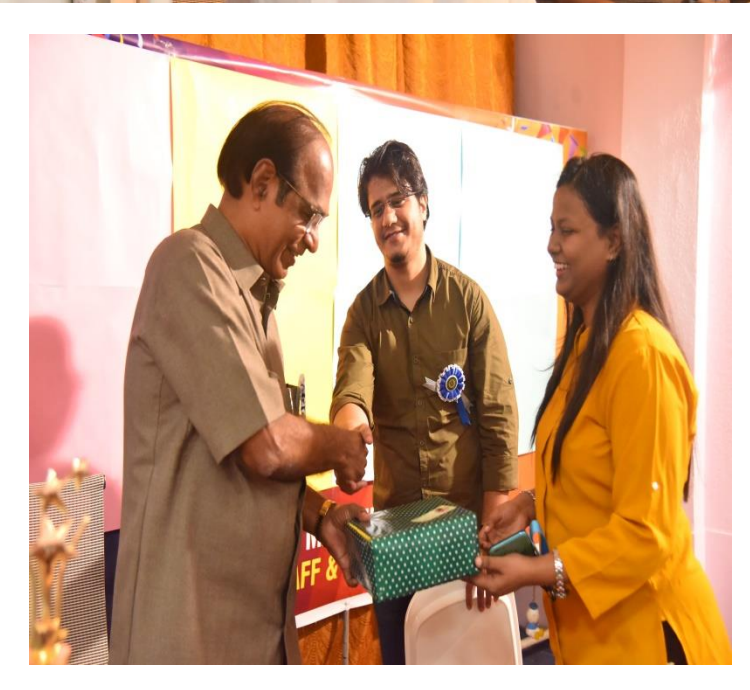
FELICITATION OF THE GUEST OF HONOUR