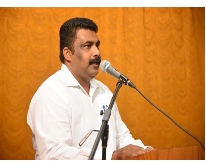
Address by the President