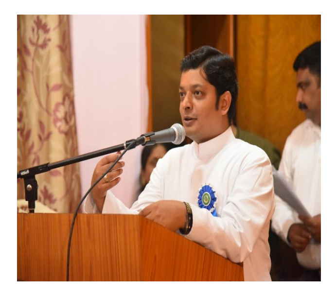
Address by Dean Academics