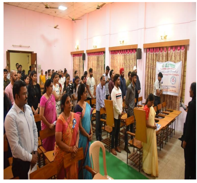
Prayer Song by College Choir, "Anna Domini".