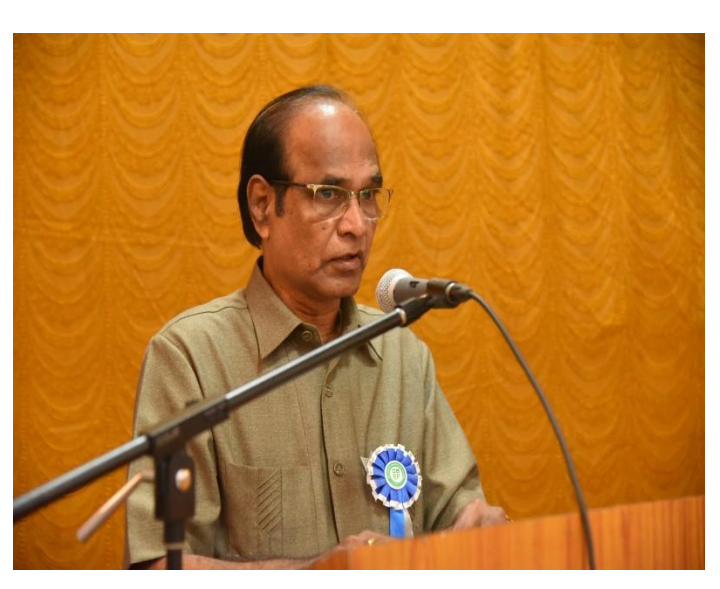
Address by Guest of Honour