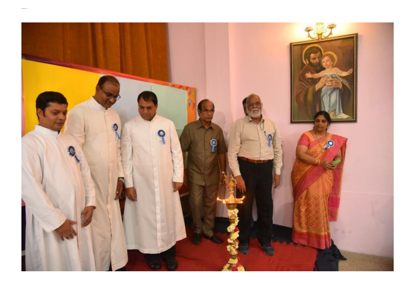
Lighting of the Lamp to Inaugurate the Alumni Meet – Milan 2019