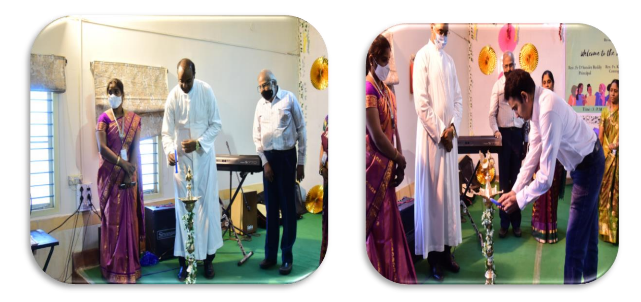
Lighting of the Lamp to Inaugurate the 12<sup>th</sup> Alumni Meet – Milan 2021