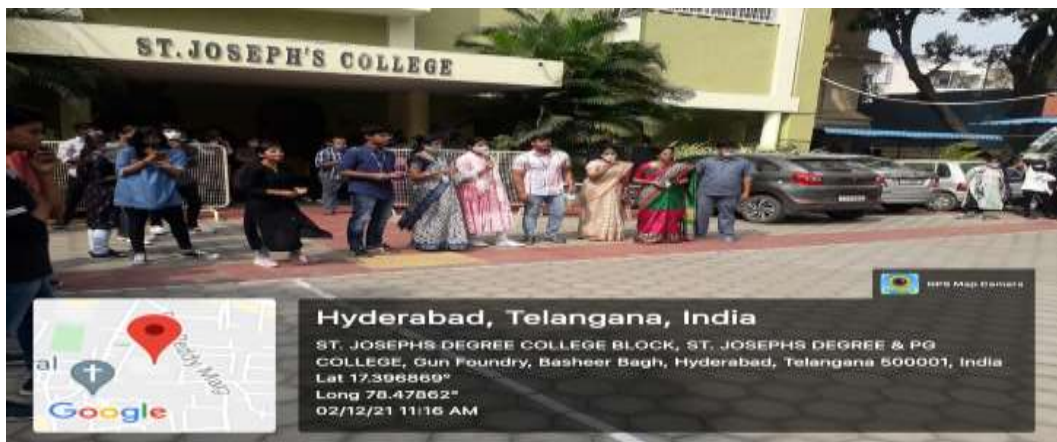
Computer Word Anthakshari – Open interactive Session in ground on 2/12/2021