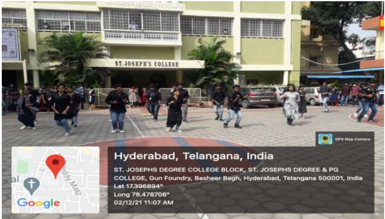
Flash Mob on 2 nd Dec, 2021