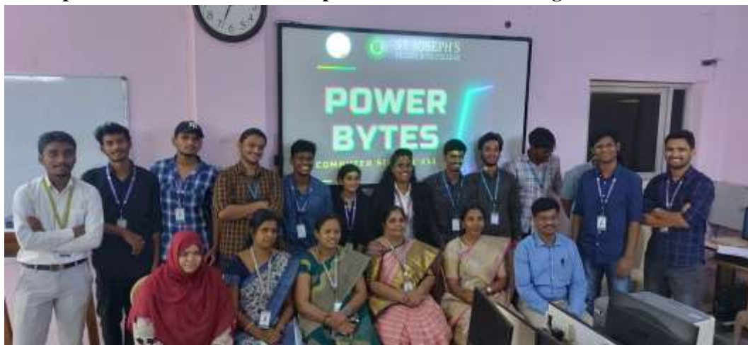
Faculty and Students on the event of Computer Literacy Day on 2/12/2021