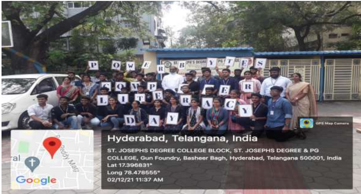
Power Bytes Club Coordinators and Flash Mob Participants with Principal and Faculty