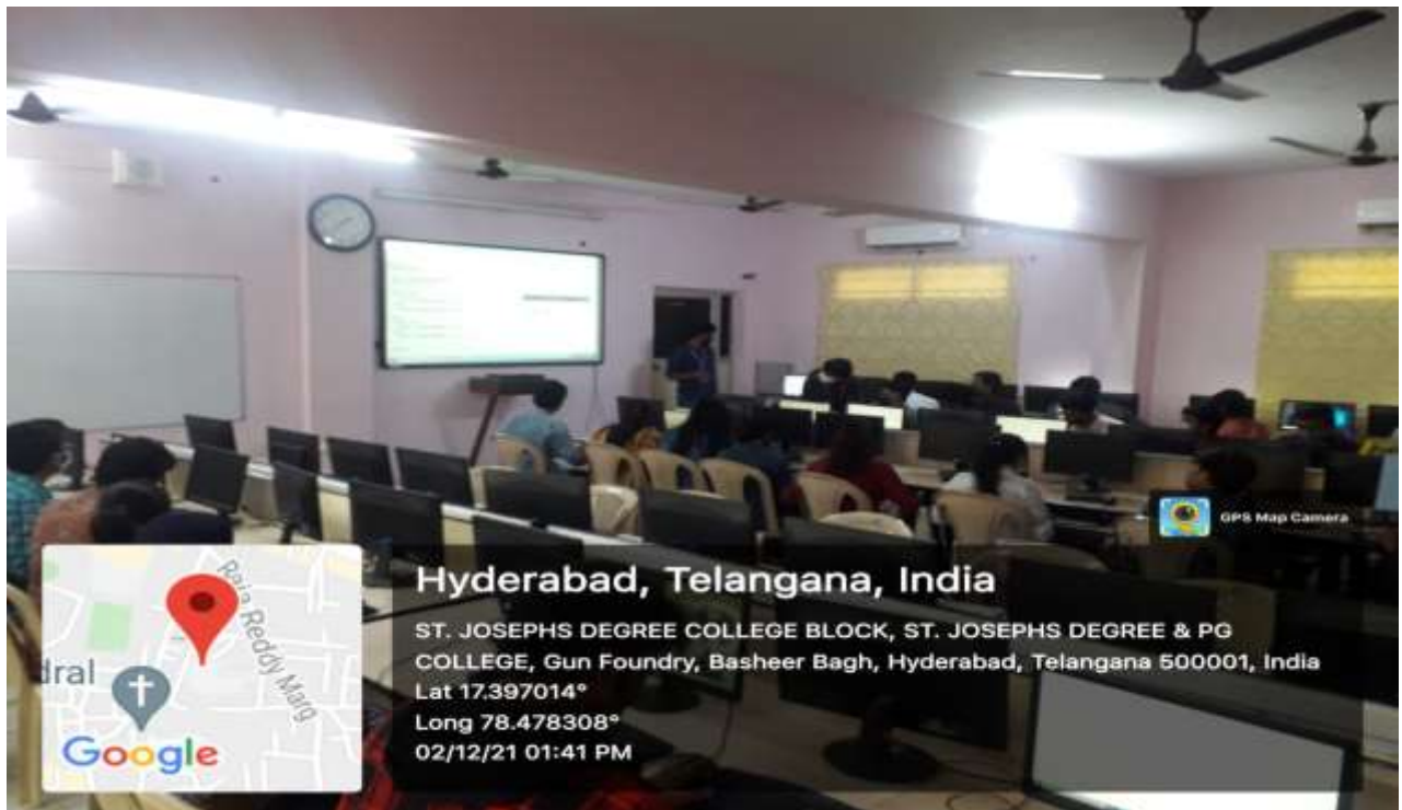
Students participating in Find the Bug Competition on 2 nd Dec,2021