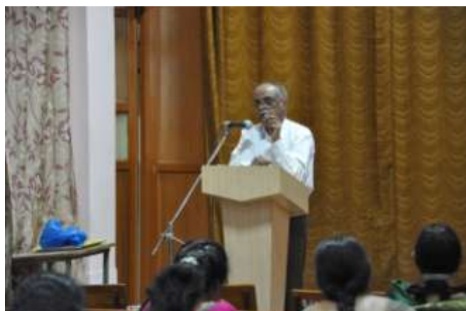
Workshop on Investment Planning for Executives: 11- 18 Dec 2014

Outcomes were faculty were able to understand the advantages of financial education, basics of saving and investments, choosing the right investment options, diversification of savings, tax planning and retirement planning and borrowing related products.