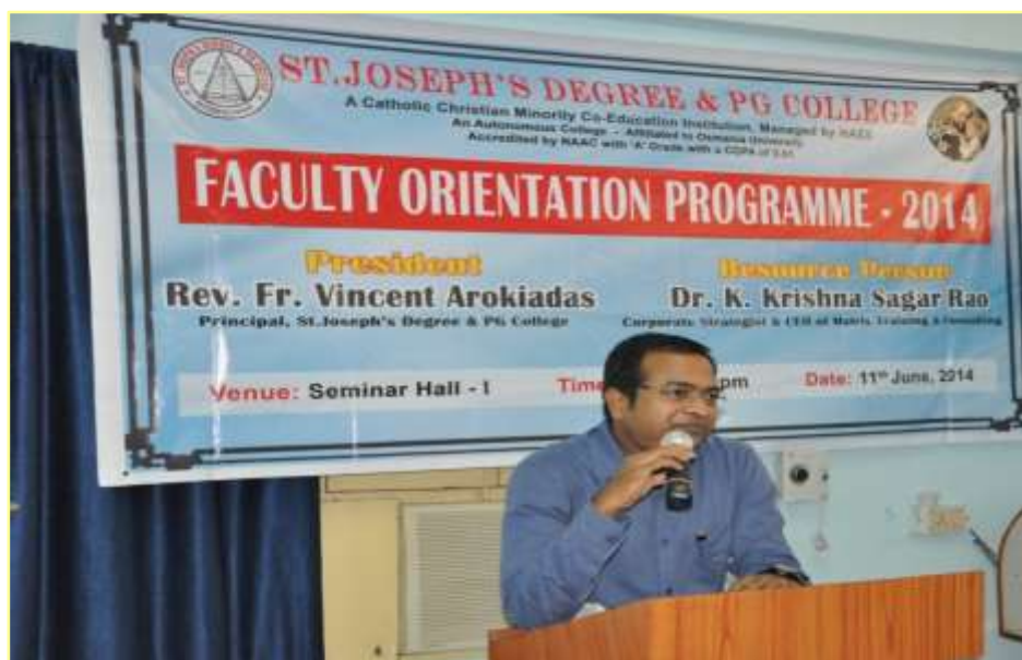
Faculty Orientation Programme - 11 th June 2014