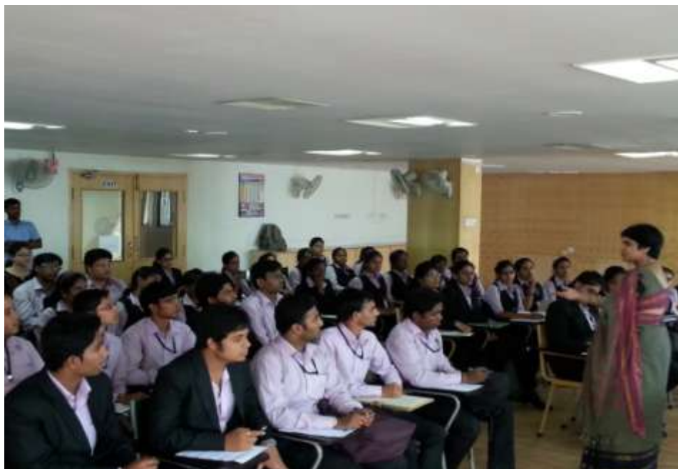
Orientation Programme - August 11, 2014.

Students become familiar with both physical locations and the workings of the environment during orientation.