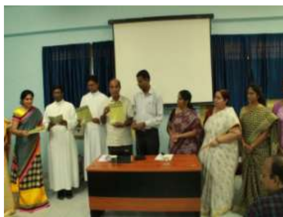
General Staff Meetings