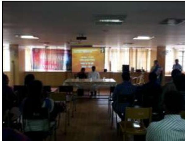
PRINCIPAL ADDRESSING THE FIRST AUTONOMOUS BATCH OF MBA