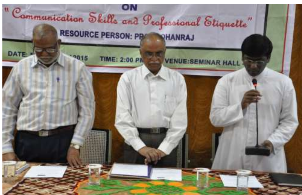
FDP on Communication Skills & Professional Etiquette: 19 - 25 Jan 2015

Faculty were able to understand the Accuracy, Fluency, Tone and Pitch to make communication skills effective; also emphasised more professional communication and presentation skills.