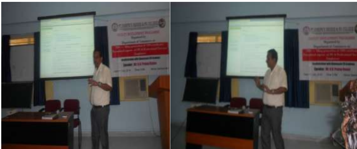
FDP on Tax Deducted at Source: 16- 23 July 2014