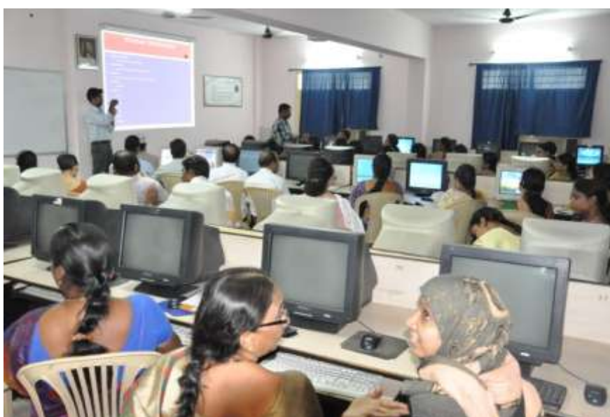
FDP on Smart IT Skills: 23- 30 June 2014