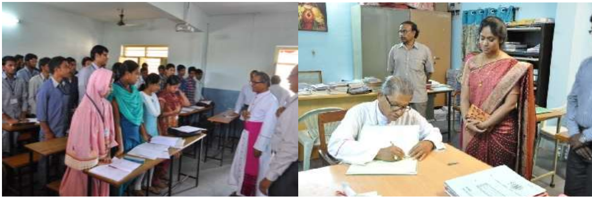
Chairman's Visit to College - 20Feb2015