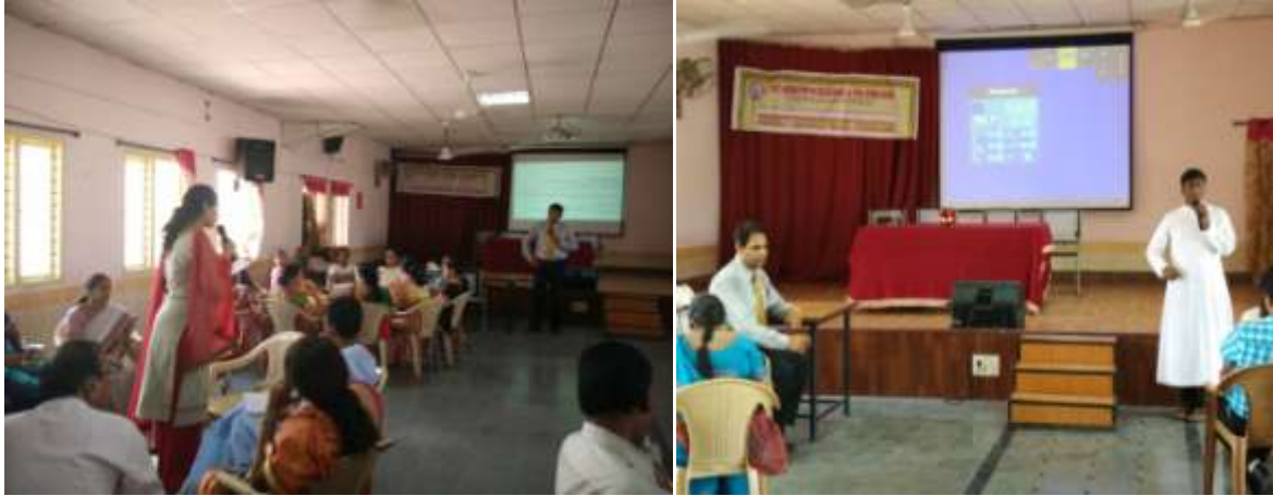
Faculty Orientation Programme – 11 June 2014