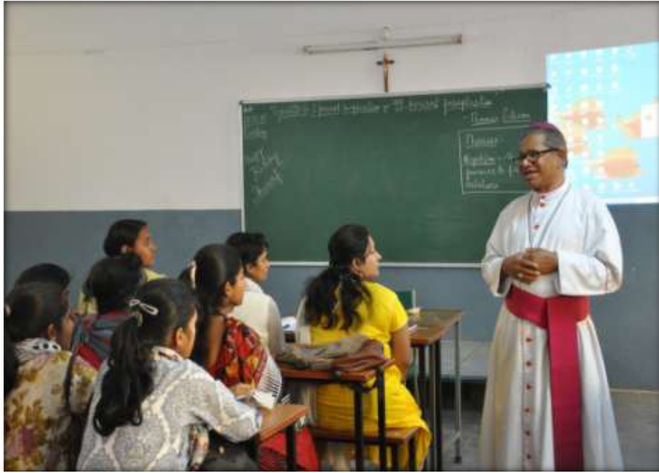
Chairman Visit - 11 December 2015