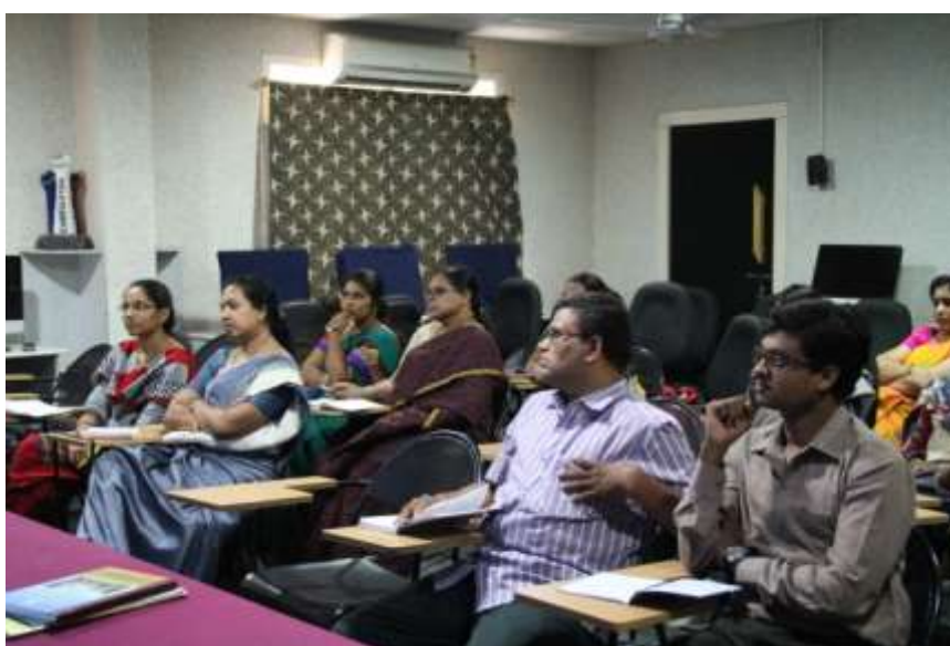
FDP on Administrative Training Programme: 5- 12 June, 2015

The objective was to orient them on the college culture, teaching & learning methodologies, examination system, cells & committees and few guidelines given by the Management and the senior staff members to familiarize them to the environment of the college.