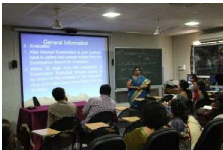
FDP on Administrative Training Programme: 5- 12 June, 2015