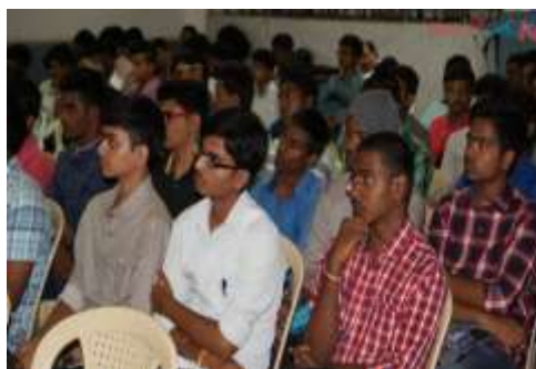
Orientation Programme for First Year Students:30Jun 2016