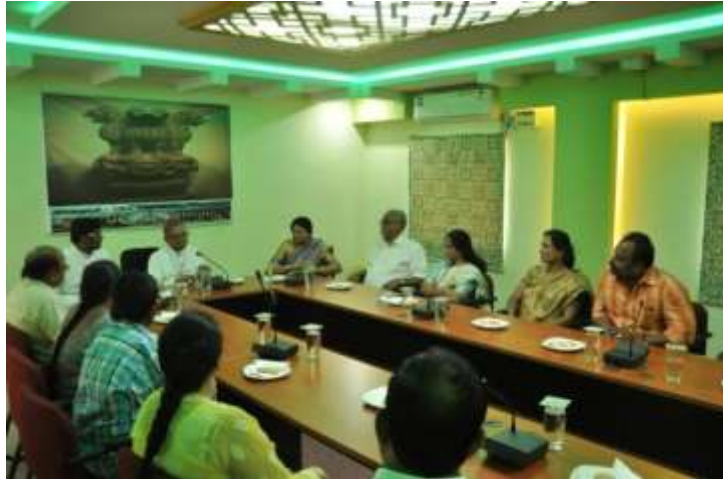
Archbishop's interaction with Parents: 21 Dec 2016

All the staff member were motivated and validated their academic/administrative system of records