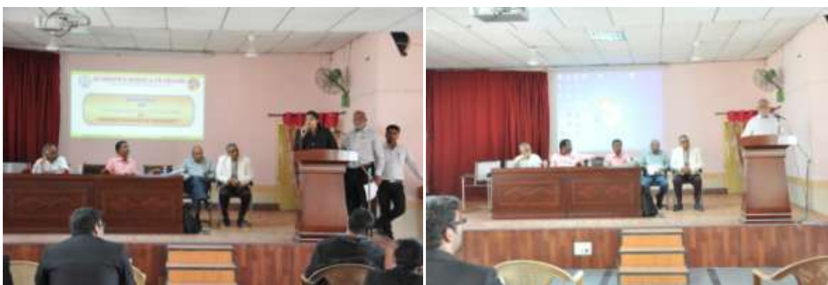
Awareness on Challenges and Opportunities of Demonetization of Currency - 28 Nov 2016

Students were enlightened with importance of demonetization and security design to avoid the production of counterfeit notes.