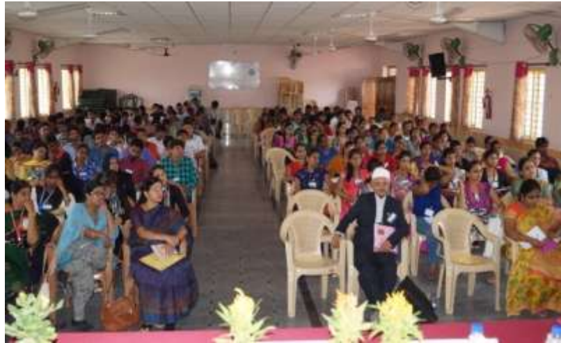
Lecture Series Workshop on “ Role of Mathematical Sciences in digitalization ”: 7 & 8 Sep 2016