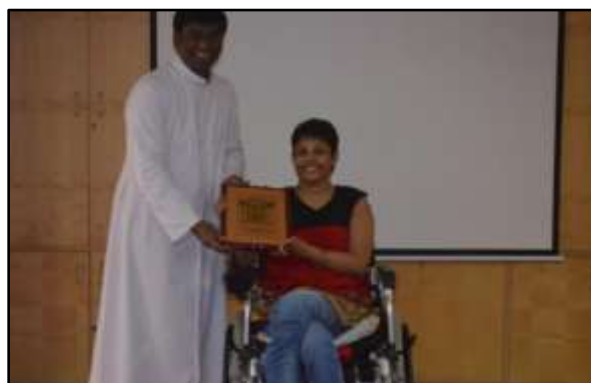
Principal felicitating the Resource person at Orientation program for students: 21/09/2016