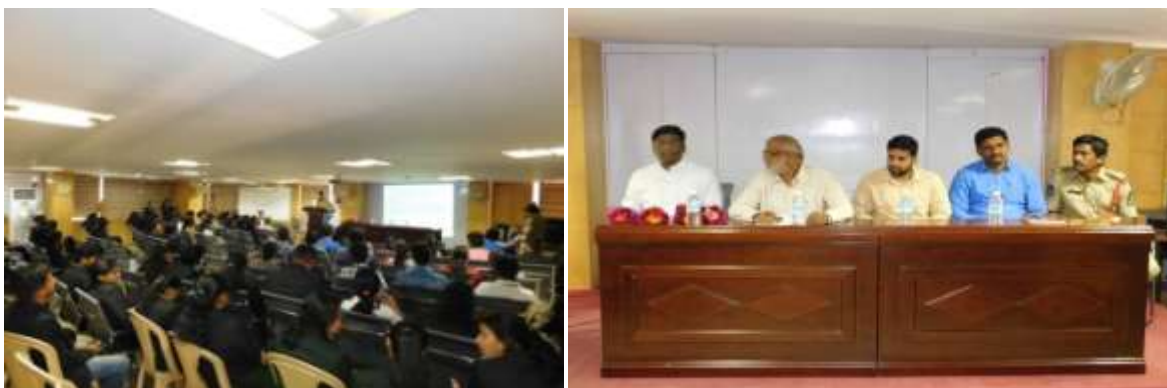
Panel Discussion on Cyber-Crime: 6 Mar 2017

The discussion had various questions from the students which helped them to get an overview on Cyber Crime.