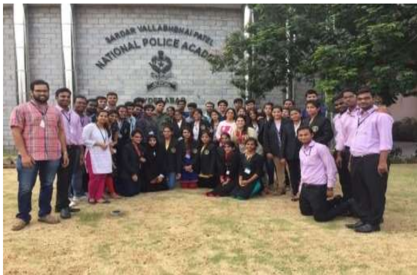
Visit to National Police Academy: 27 & 28Sep 2016

Students were taken to model police station where the trainees were given a mock crime scene and taught how to investigate on it. At the forensic science building, students were explained about the functioning of forensic science lab. Students were taken to various places such as gymnasium, badminton court, tennis court, swimming pool, Dhyan Kendra for yoga and meditation, rock climbing and urban shooting range where the trainees are given training. Later the students walked through guest houses of different states such as Rajasthan Bhavan, MP Bhavan, ITBP cottage etc.