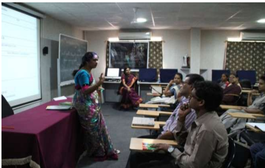
New faculty orientation: 5 Jun 2016

As a step towards inviting the newly recruited faculty and helping them understand the working system of the institution, the IQAC conducts New faculty orientation on 05 June, 2016 to give them an overview of the activities and responsibilities to be taken up as a faculty of the institution related to teaching-learning, examinations, student support and governance. This helps them to understand the work culture and also be familiarized with the faculty at college level and departmental level.