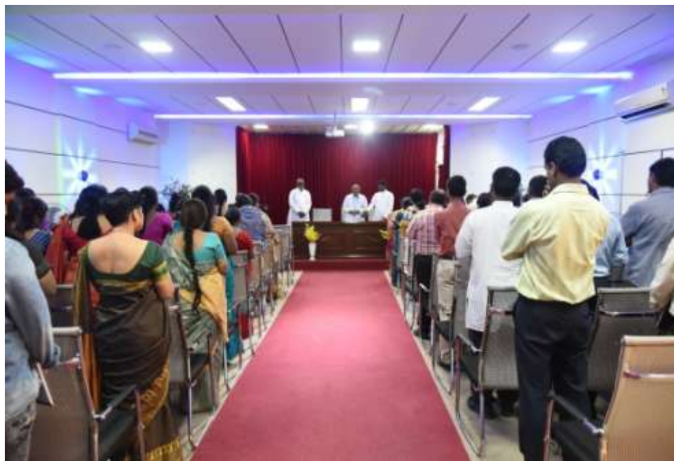
Investment Planning - 9 th February, 2017

Staff were enlightened with various plans, schemes and money management methods to be adopted to make life safe and secure.