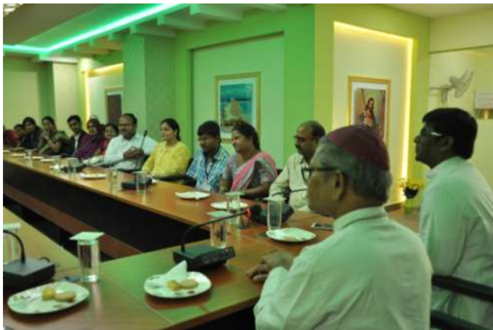
An Interactive session of parents with Chairman & Principal - 18 th Feb 2017