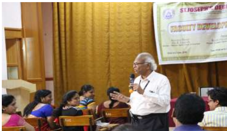
FDP on “Professional Development Program”: 6 - 14 June 2016