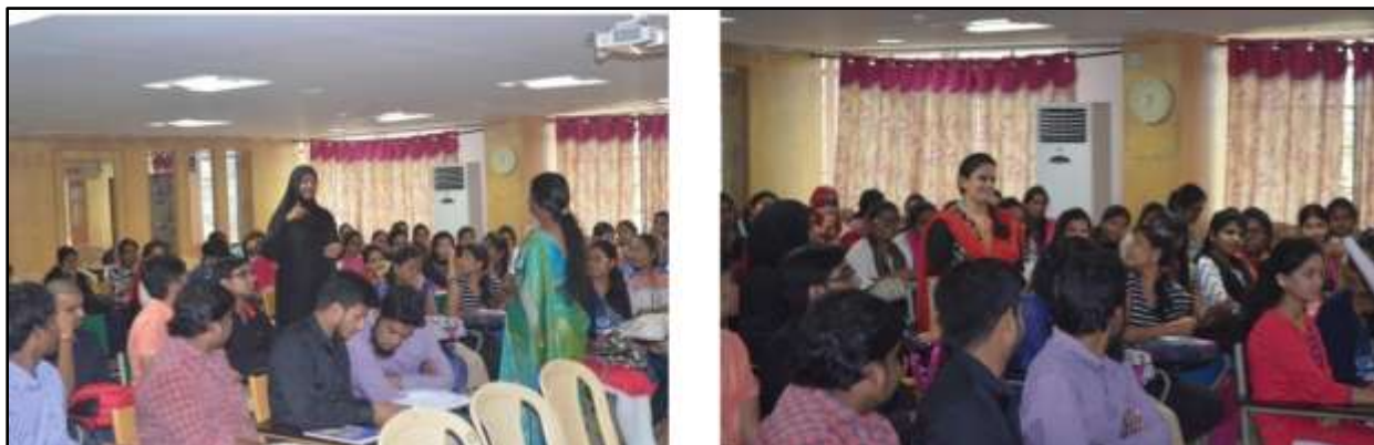
Orientation program for MBA I Year students: 21/09/2016