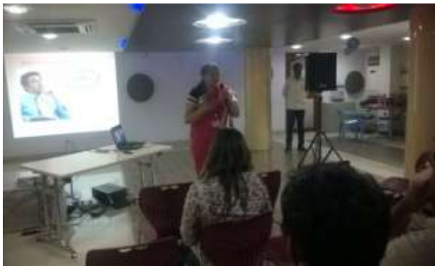
MDP on GLIDE: 11 Aug 2016