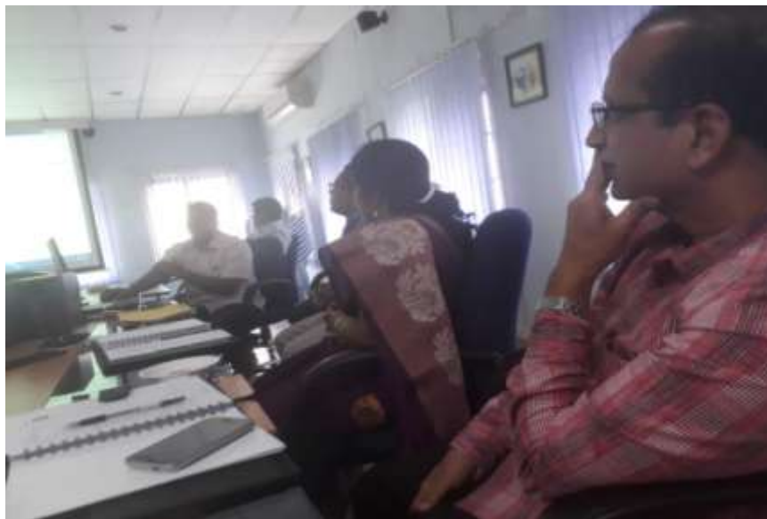
Workshop on Examination Evaluation Process - 19 Dec 2016

The team was made aware on various issues faced in conducting examinations and evaluating process.