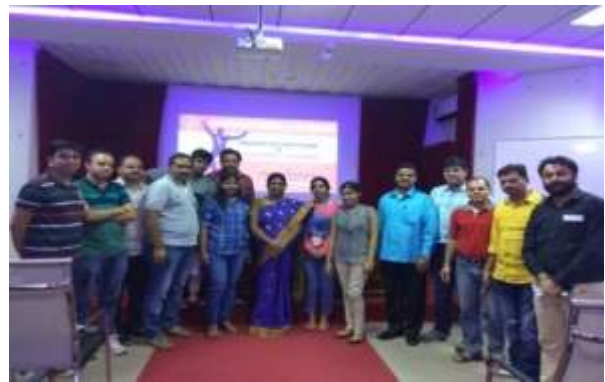
MDP on GLIDE: 11 Aug 2016