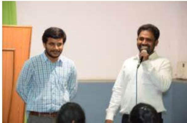
Orientation for MCJ I year students: 3 Aug 2016