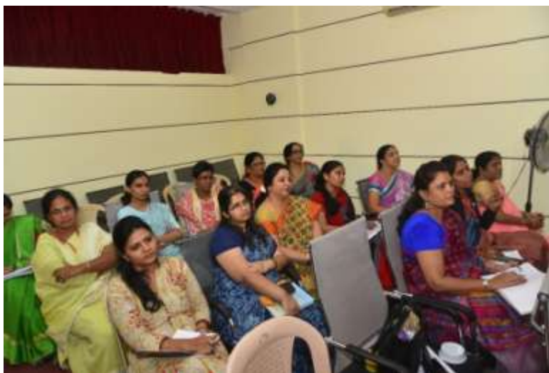
Faculty Orientation Programme

Program intended to help administrators, teachers, and other educators improve their professional knowledge, competence, skill, and effectiveness.