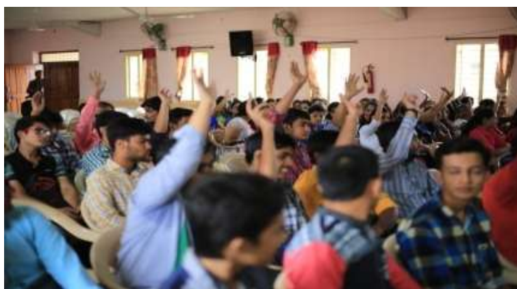
Orientation Programme for Second and Third Year Students: 15 Jun 2016