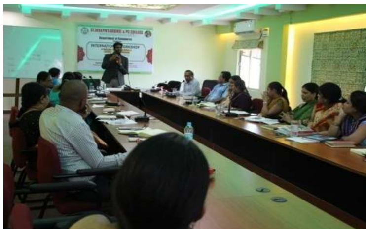
FDP on “Professional Development Program”: 6 - 14 June 2016

and purpose of financial reporting, qualitative characteristics of financial information, use of double entry and accounting systems, Recording transactions and events, Preparation of trial balance including identifying and correcting errors, Preparation of basic financial statements, Preparation of simple consolidated financial statements and Interpretation of financial statements with examples.