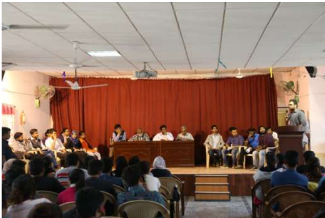
Panel discussion on “Role of Media in Democracy” - 8 February, 2017

At the end of the session students got a deep insights into the ways in which digital platforms are being used to share different types of news, and their concerns.