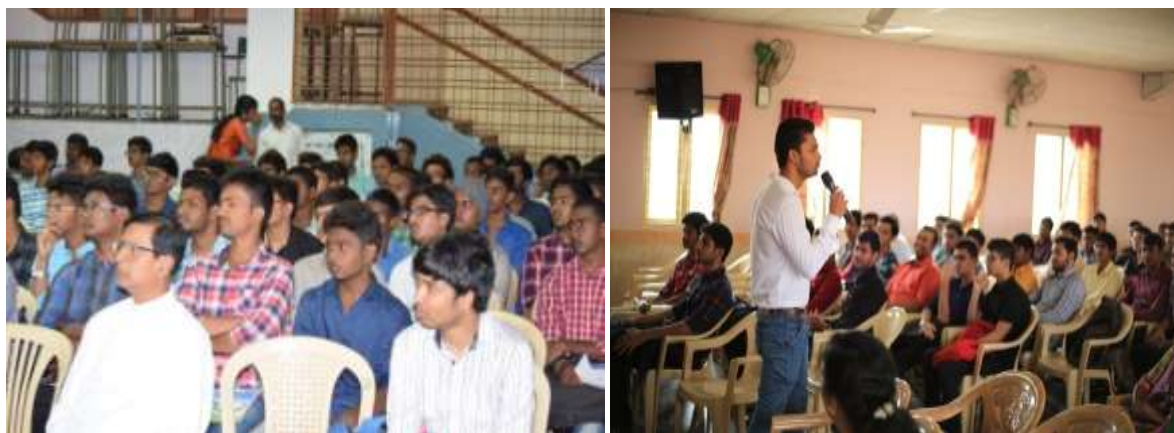
Orientation Programme for Second and Third Year Students: 15 Jun 2016

Orientation Programme for Second and Third Year Students was organized on 15 th June 2016. It was conducted for each class separately by the respective subject faculty. The students were informed about the curriculum, examinations, discipline, placements and other activities of the department and College. They were also reminded of their responsibilities as senior students to organize the departmental activities and college events during the academic year.