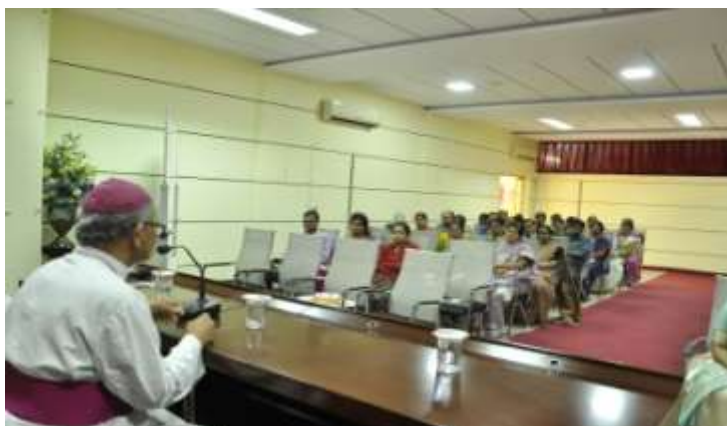
Chairman's visit: 28 Oct 2016