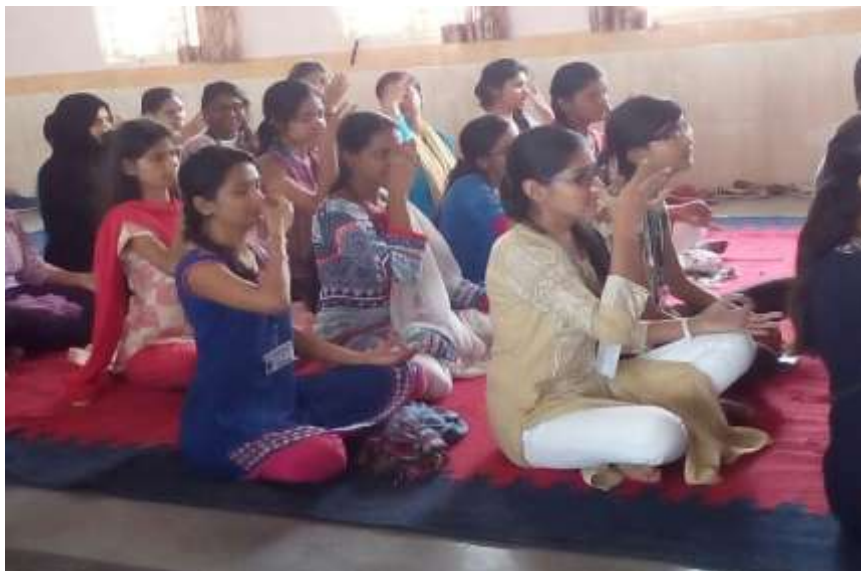
Yoga Practice Session -24 th June 2016

Students were made aware on importance of practicing yoga everyday