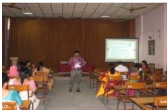
FDP on “Professional Development Program”: 6 - 14 June 2016