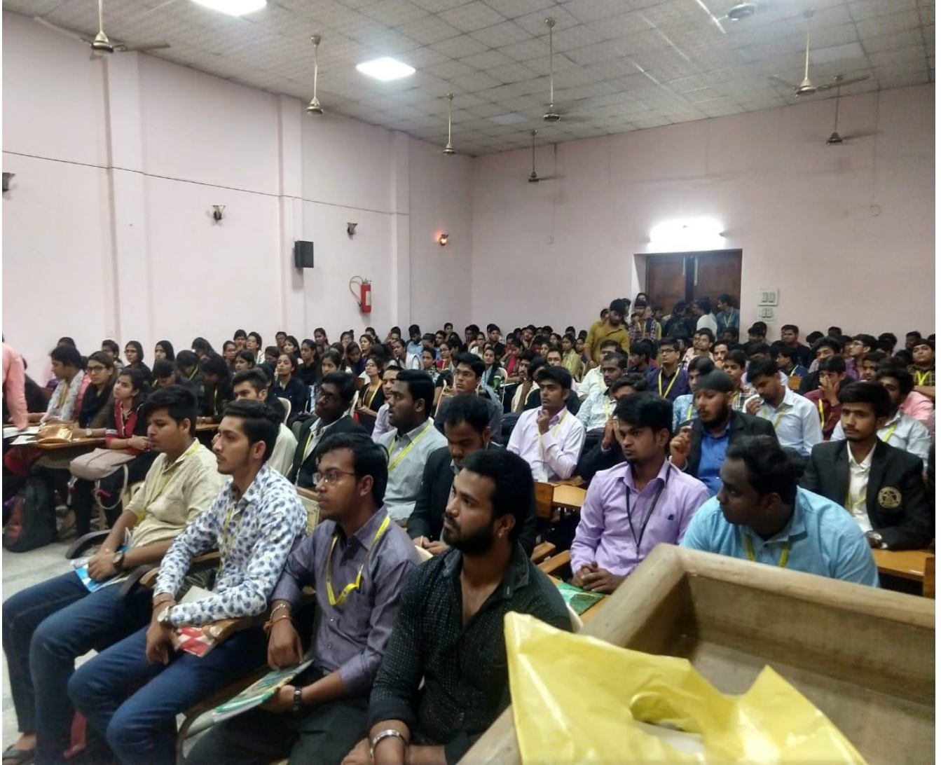
Orientation for NMAT