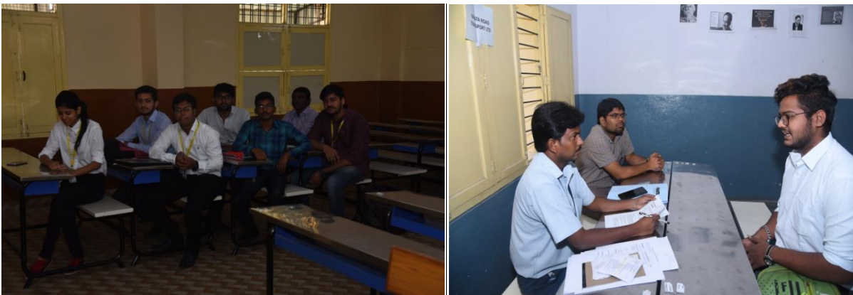
Students attending Interviews