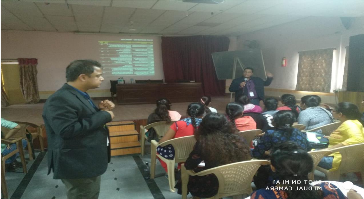
Deloitte Branding Session