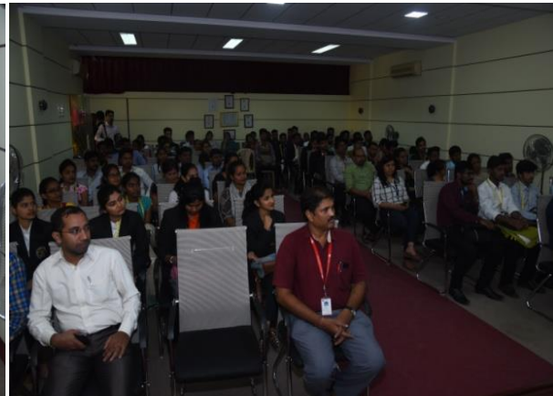
HR Managers interacting with Audience