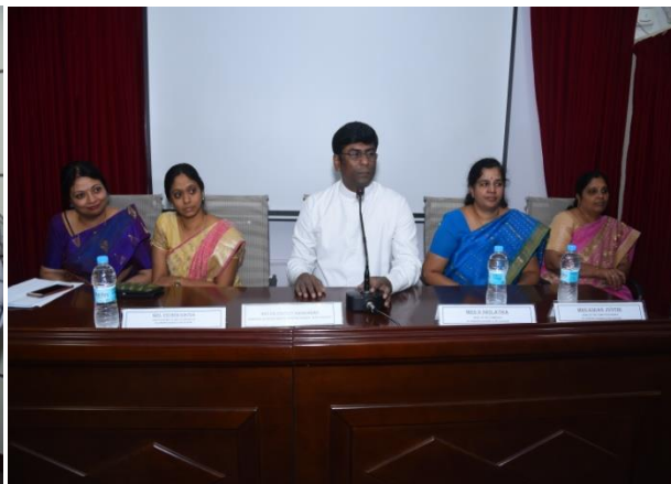
Dignitaries on the dais