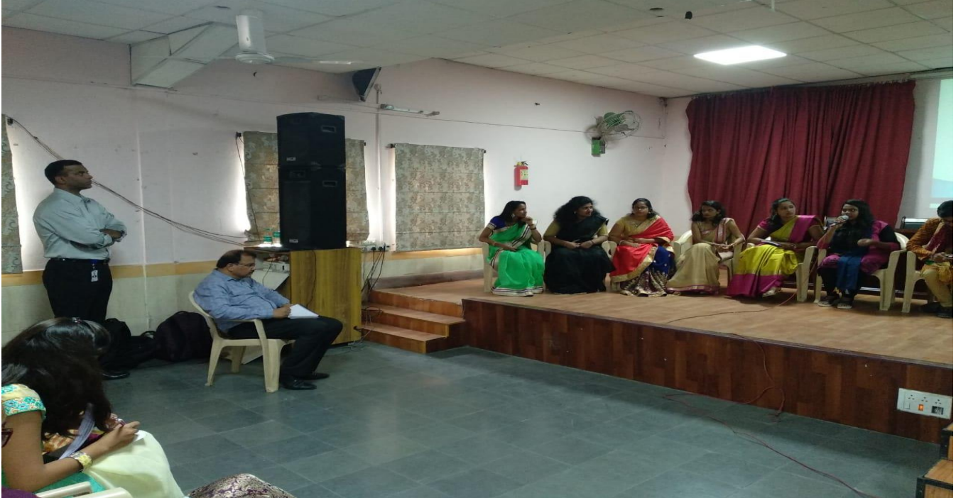
Deloitte Audit Pre Placement Talk