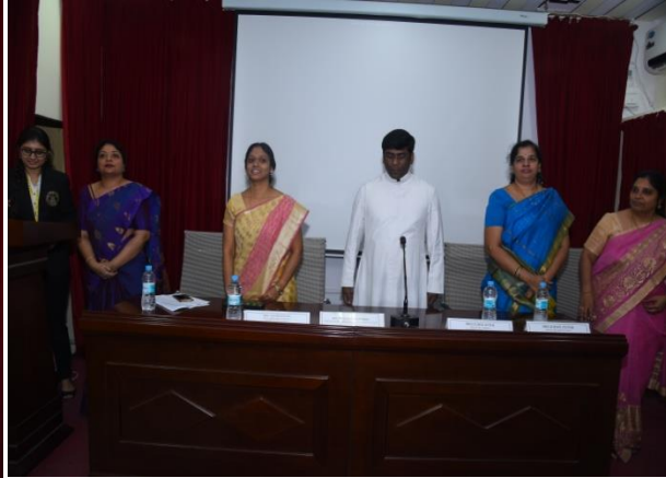
Prayer Song by College Choir "Anna Domini"