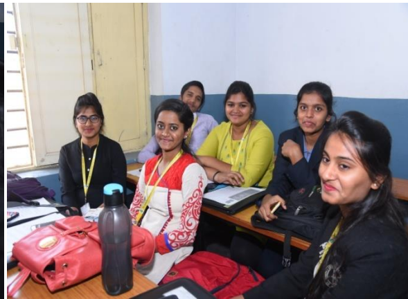
Students attending Interviews