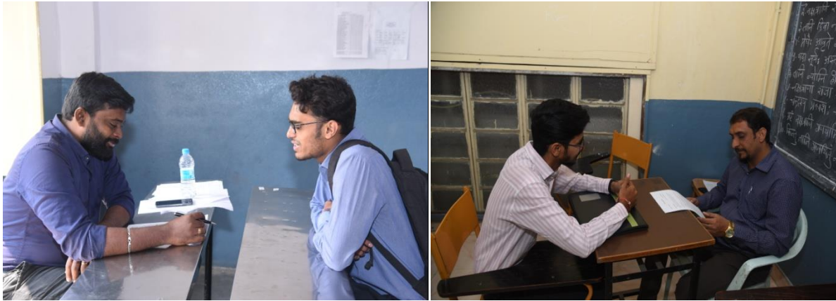
Students attending Interviews