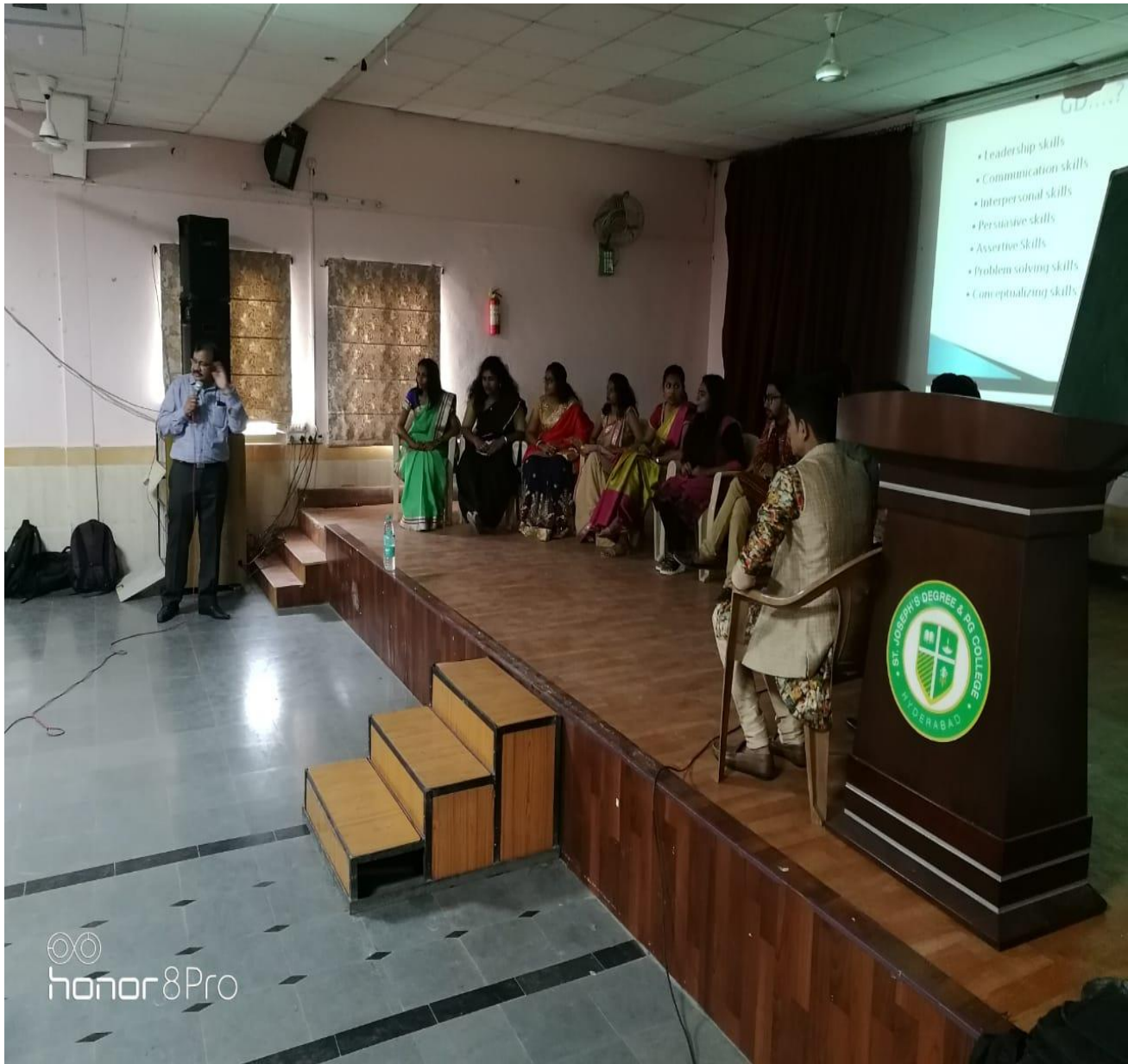
Mock GD Session - Campus to Corporate workshop