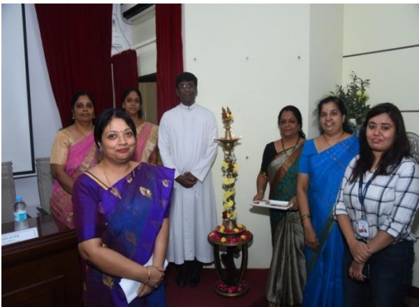
Lighting of the Lamp