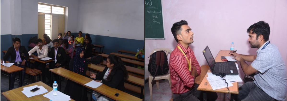
Students attending Interviews