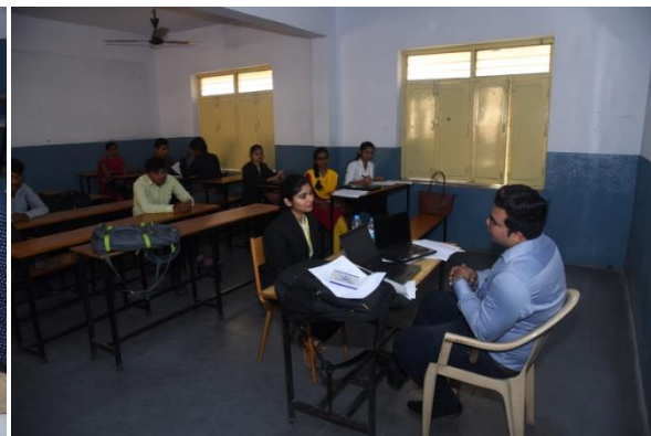
Students attending Interviews