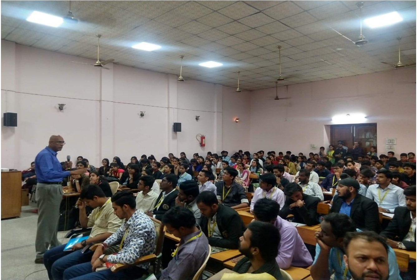
One Day MBA