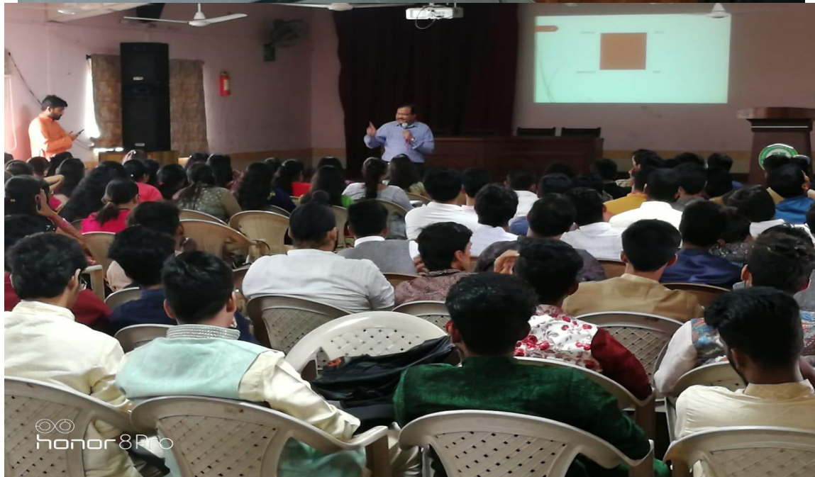
Campus to Corporate Workshop