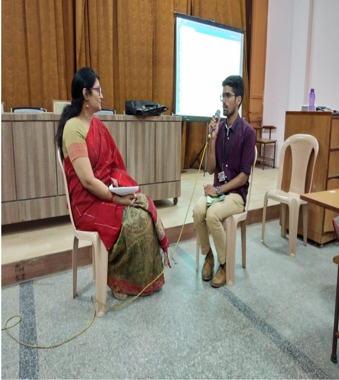
Mock Personal Interview – Campus to Corporate.