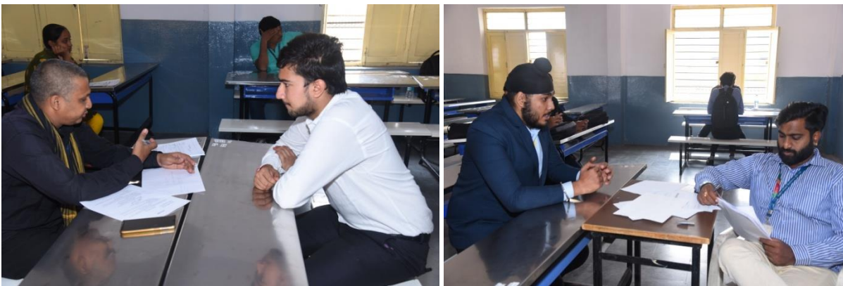
Students attending Interviews