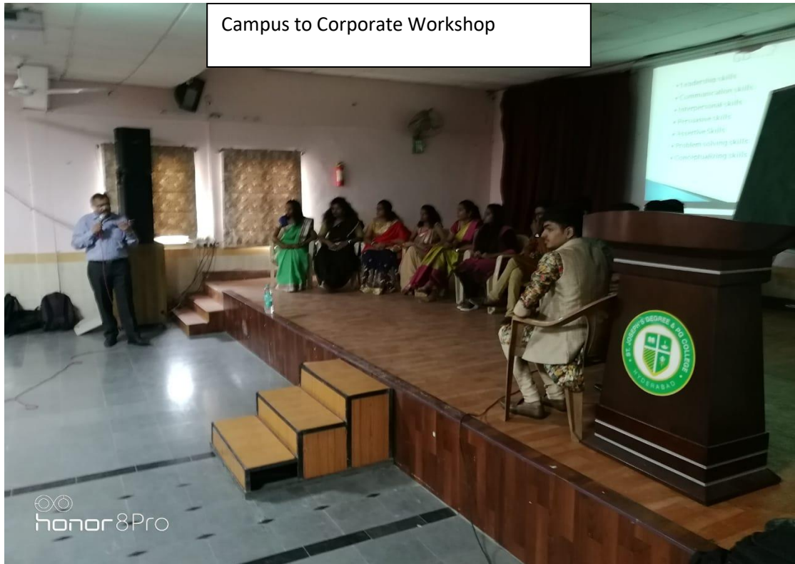
Campus to Corporate Workshop