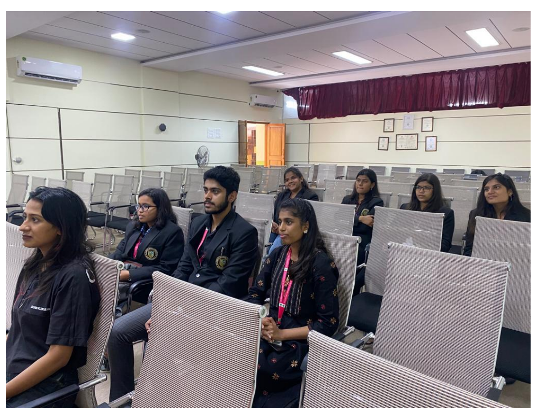
Editorial Team attending Motivational Talk