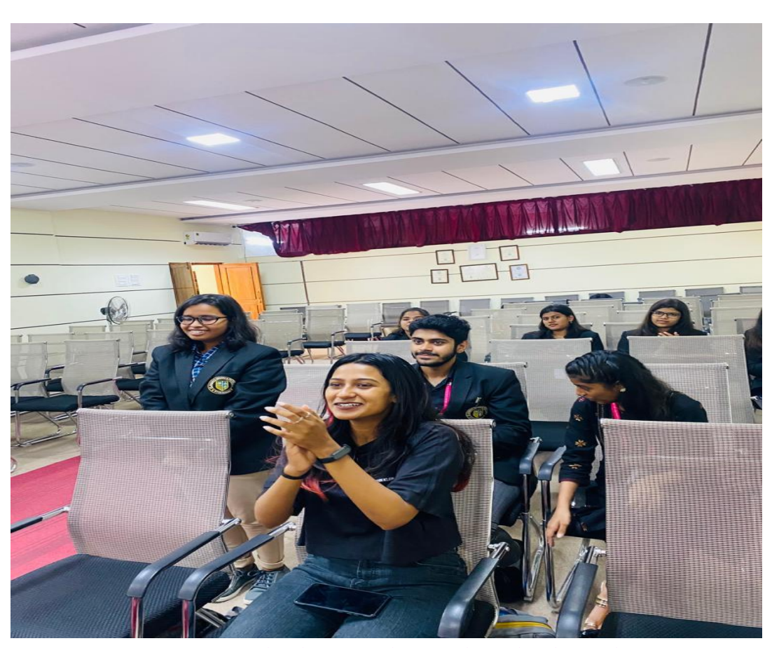
Editorial Team interacting with Alumni