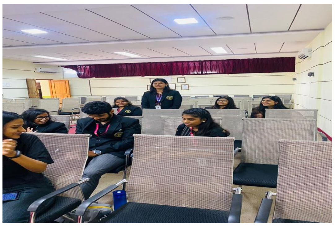
Editorial Team interacting with Alumni