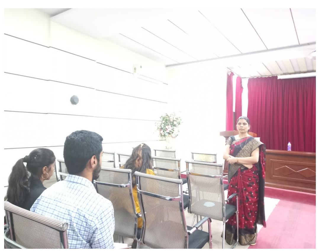
Editorial Team attending the meeting