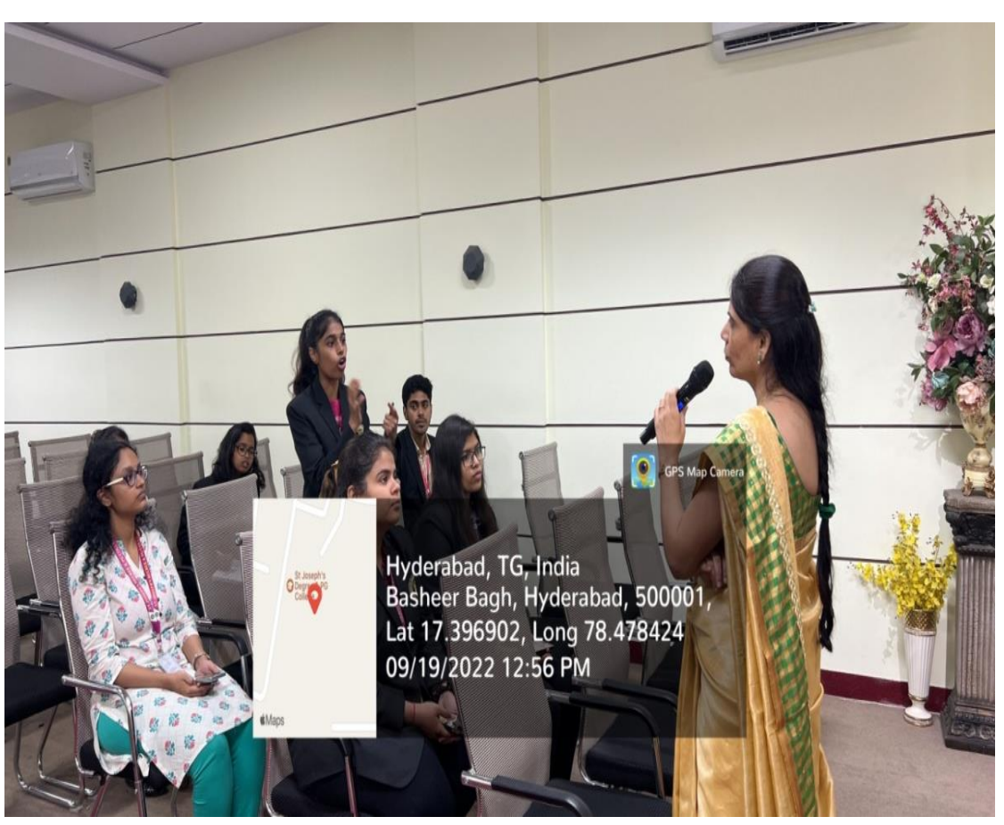
Team members introducing themselves