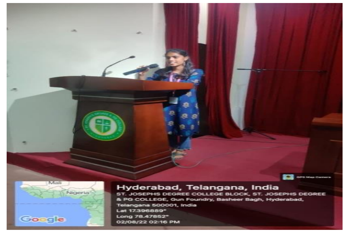
Evita participating in Round 1