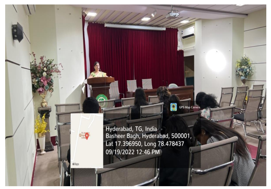
Editorial Team attending the meeting