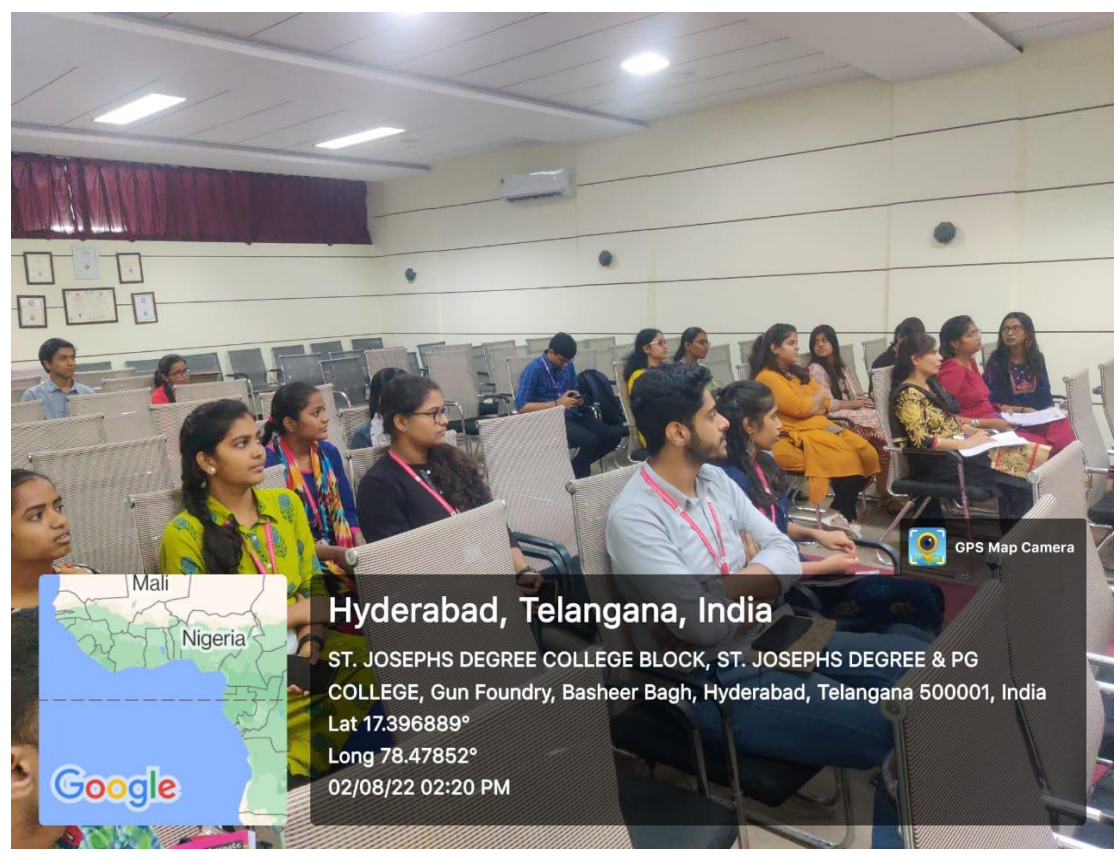
Participants at Selection of Editorial Team