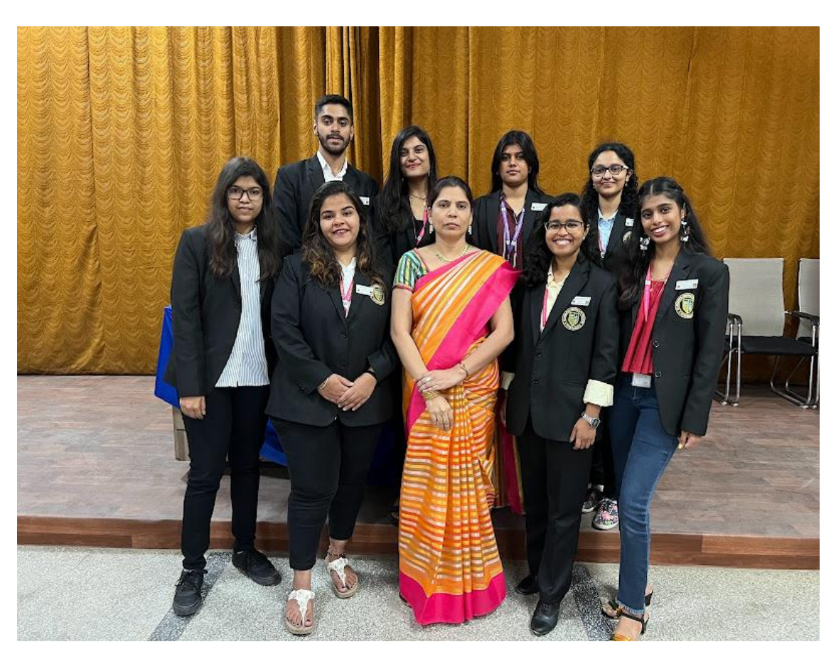
Editorial Team of Joseph's Herald